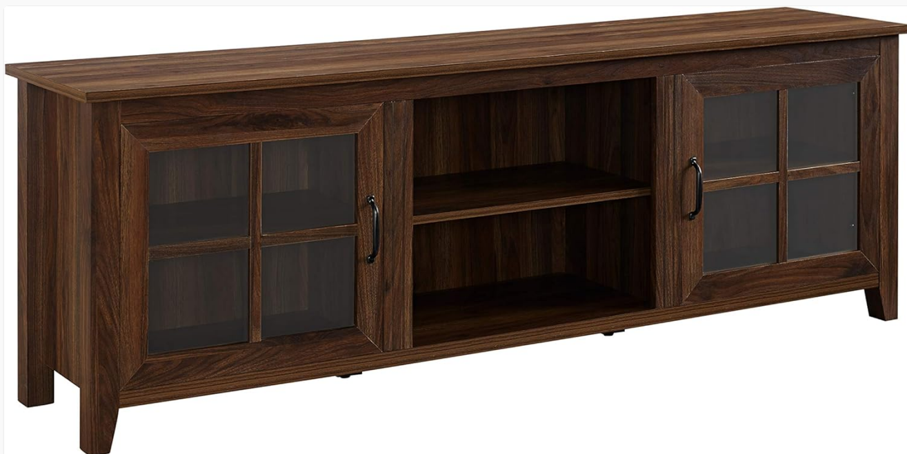
Figure 1: Walker Edison Portsmouth Classic 2 Glass Door TV Stand

This manual provides essential information for the assembly, operation, maintenance, and troubleshooting of your Walker Edison Portsmouth Classic 2 Glass Door TV Stand. Please read through this manual carefully before beginning assembly or use to ensure proper setup and longevity of your product.