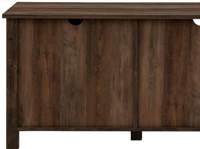
Figure 5: Cord Management Features

Easily organize messy wires with cut-outs for overall cord management.