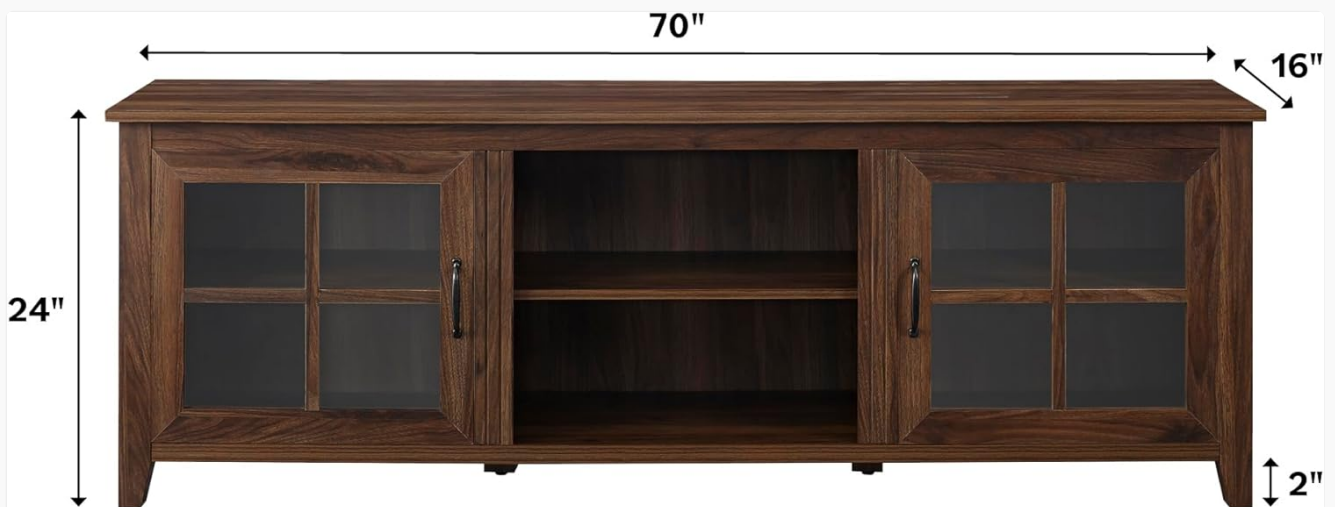
Figure 3: Product Dimensions

Helpful Tip: Some users have found that applying a small amount of wood glue to the wooden dowels during assembly can enhance the overall sturdiness of the unit, especially if a television will be placed on top.