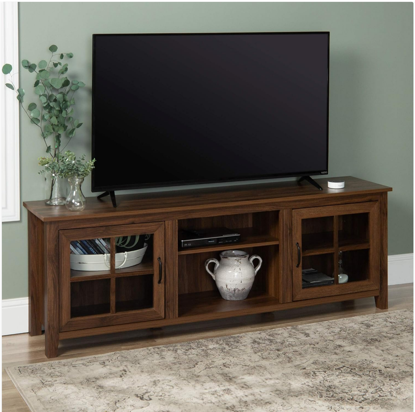
Figure 2: TV Stand in a typical living room setup