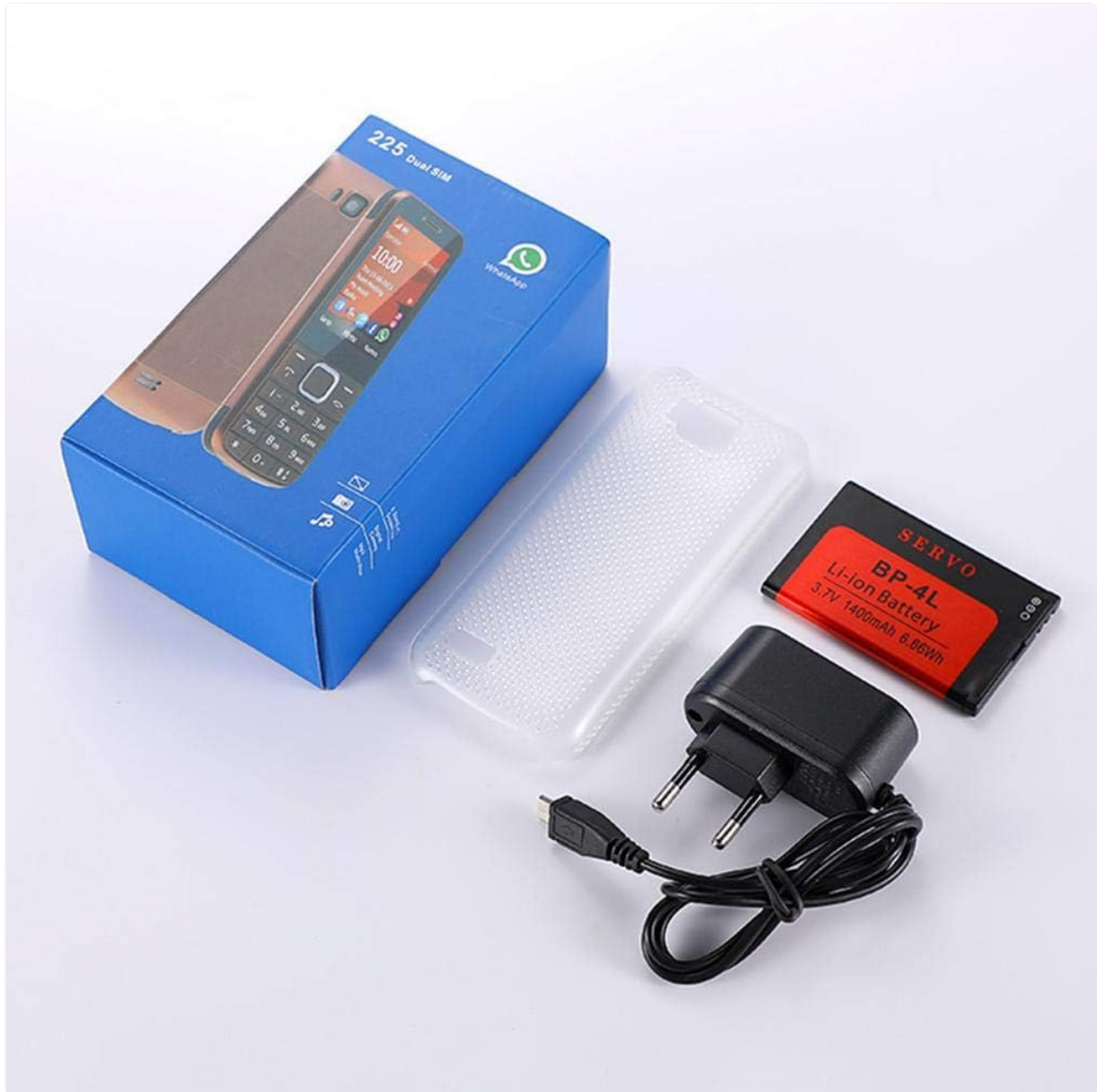
Figure 3.1: The SERVO 225 package contents, including the phone, battery, charger, and protective case.