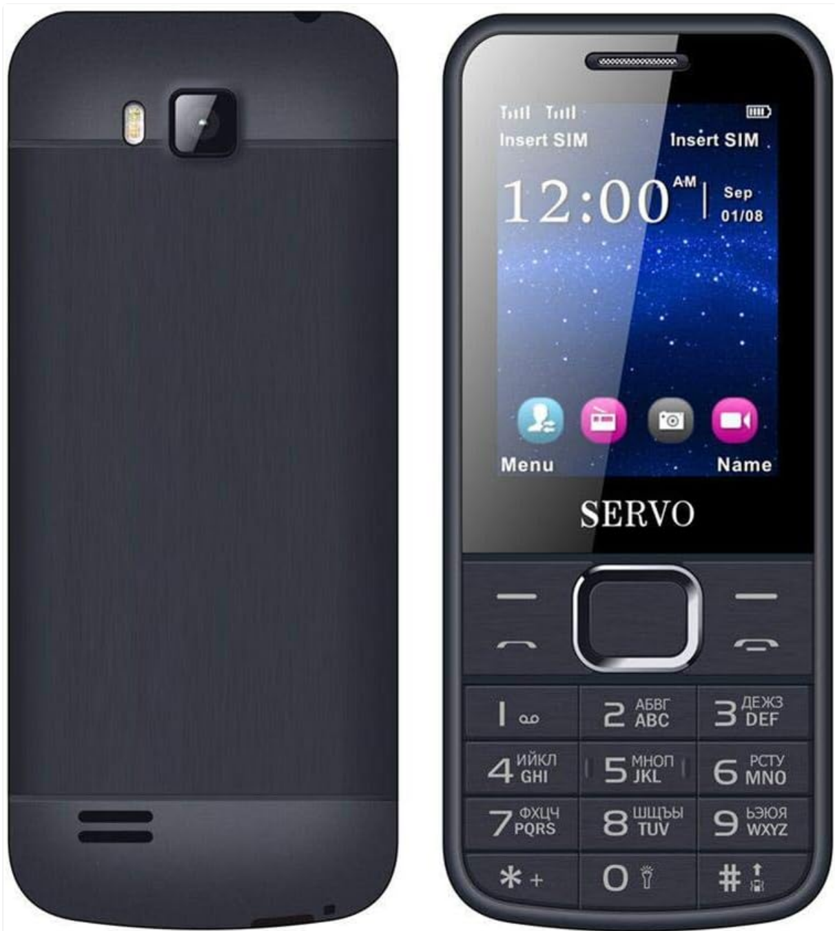
Figure 1.1: Front and back view of the SERVO 225 mobile phone, showcasing its compact design and keypad.