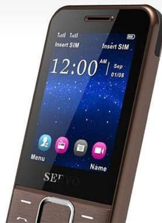
Figure 5.1: The 1400 mAh battery and the phone's zinc alloy paint shell design.