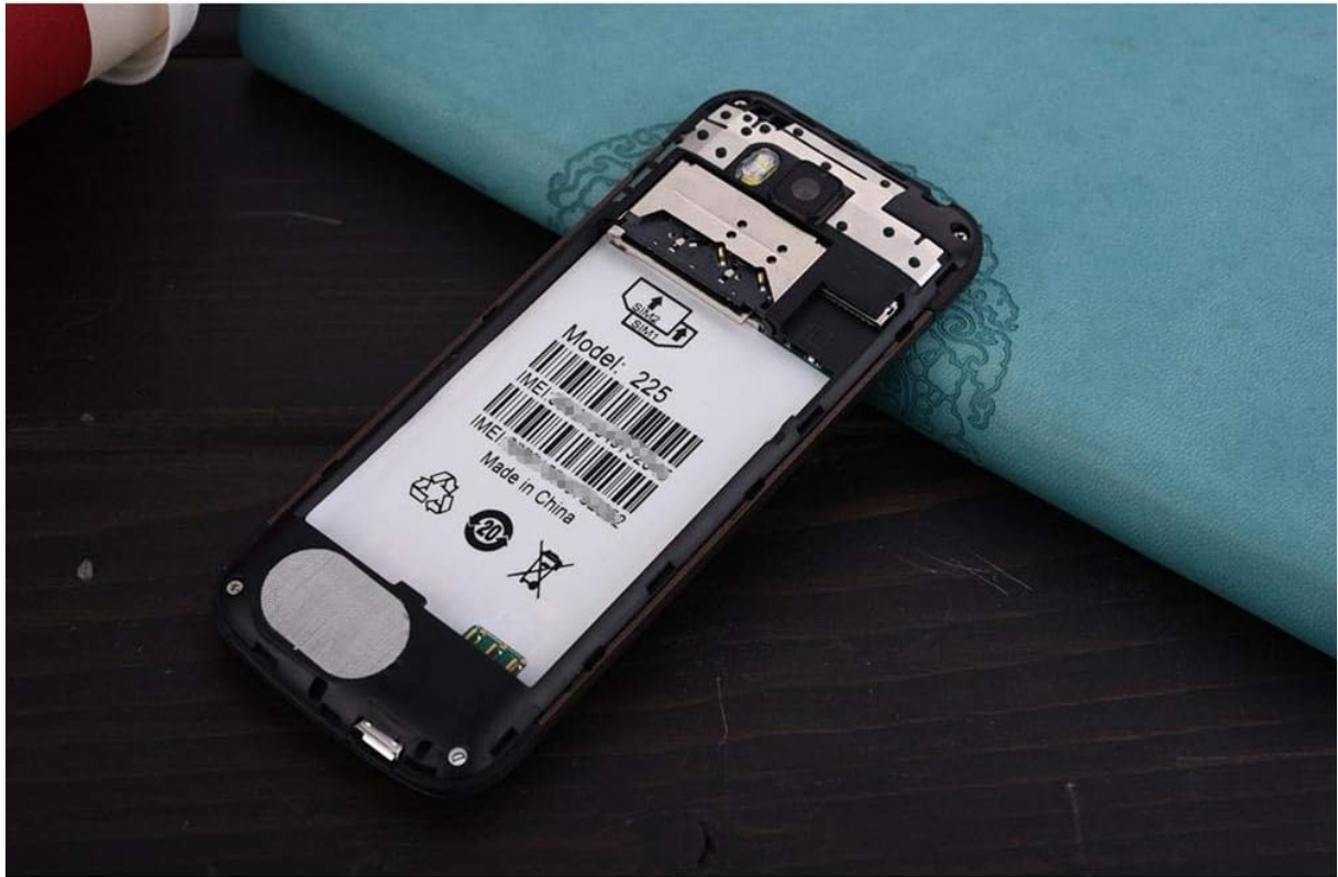
Figure 5.2: Internal view of the SERVO 225, illustrating the dual SIM card slots and the memory card slot.