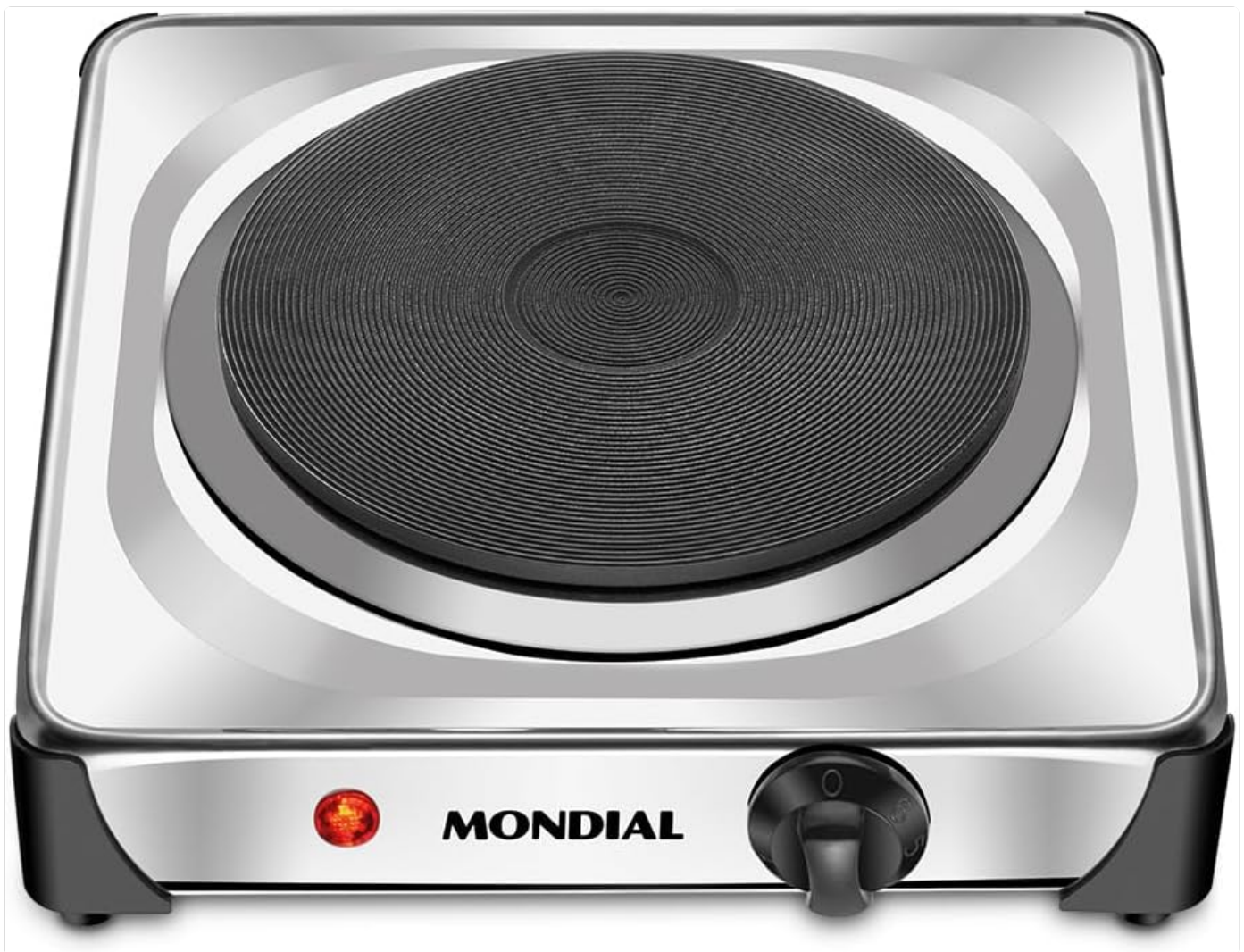
Figure 1: Top view of the Mondial Fast Cook FE-04 Electric Stove, showing the single heating plate and control knob.