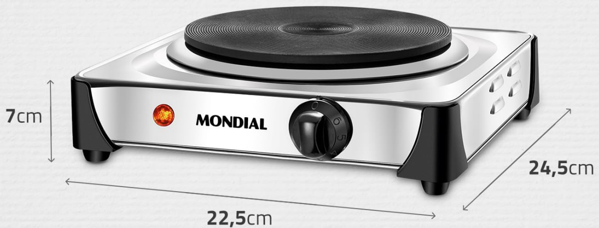
Figure 5: Dimensions of the Mondial Fast Cook FE-04 Electric Stove: 24.5cm depth, 22.5cm width, 7cm height, and 1.3kg weight.