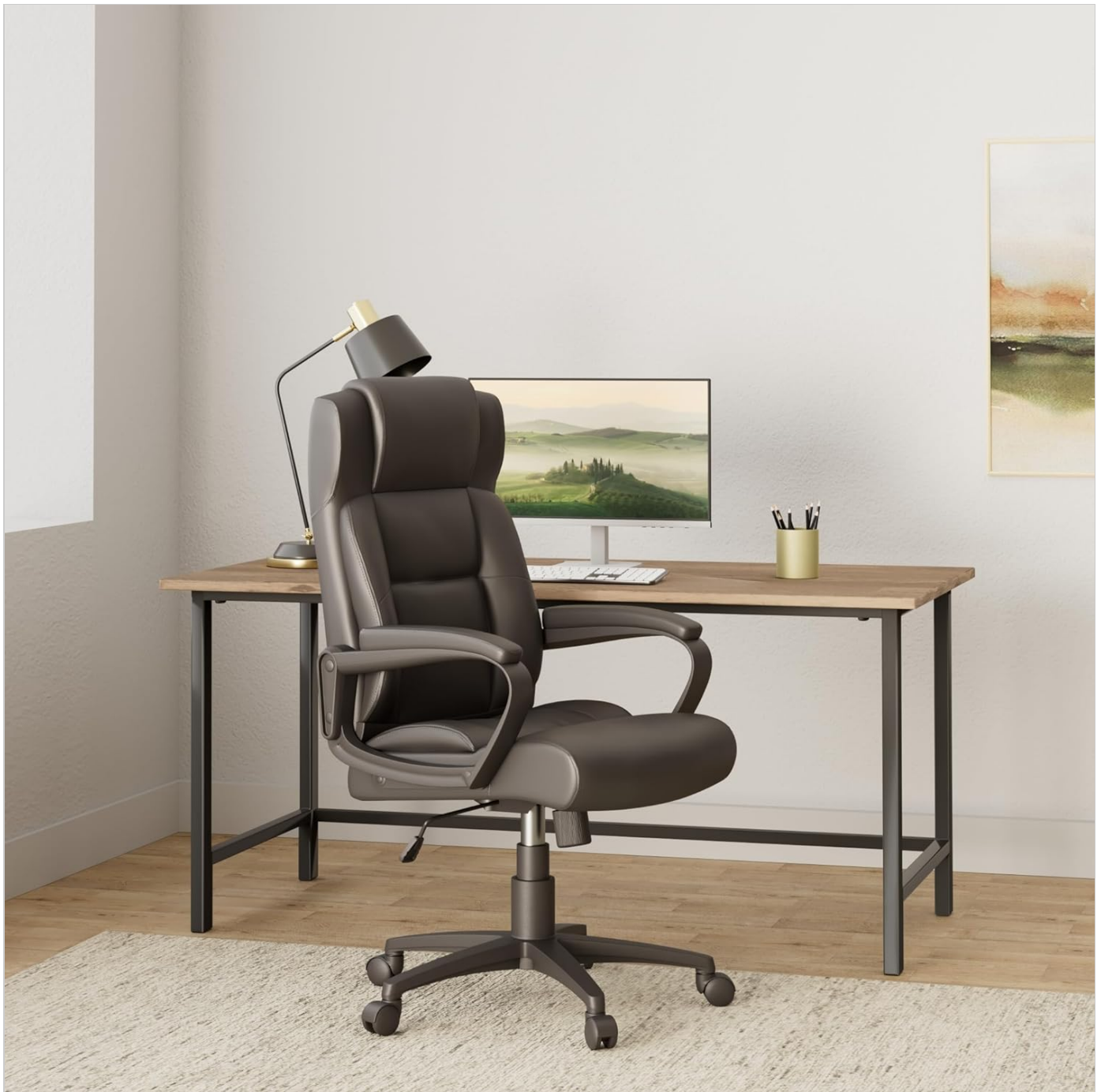
Image 3.1: An assembled Lorell Soho Executive Chair, showing the seat, back, armrests, and base. This image represents the final assembled product.