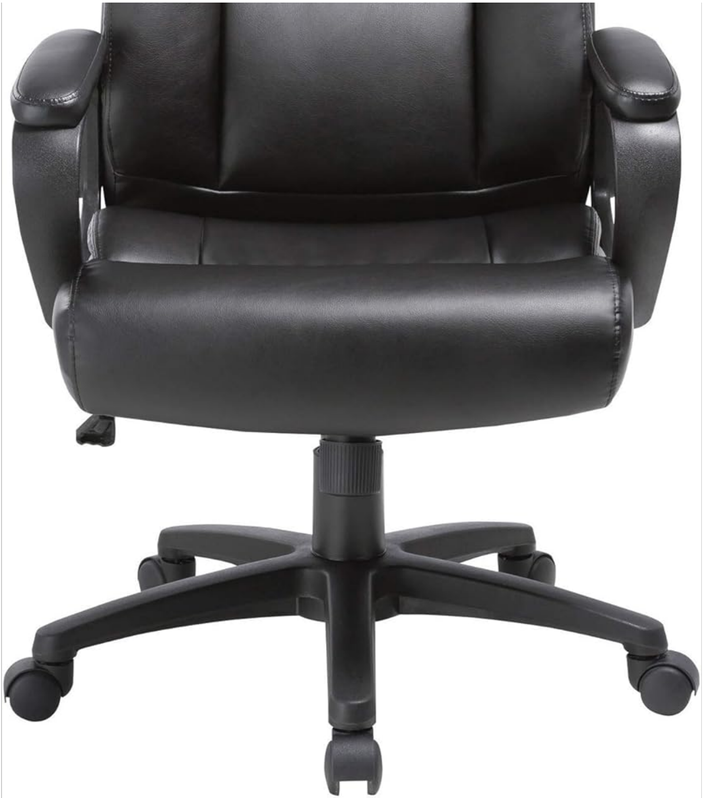
Image 1.1: Front view of the Lorell Soho High-Back Leather Executive Chair. The chair is upholstered in black bonded leather with padded armrests and a five-star base with casters.