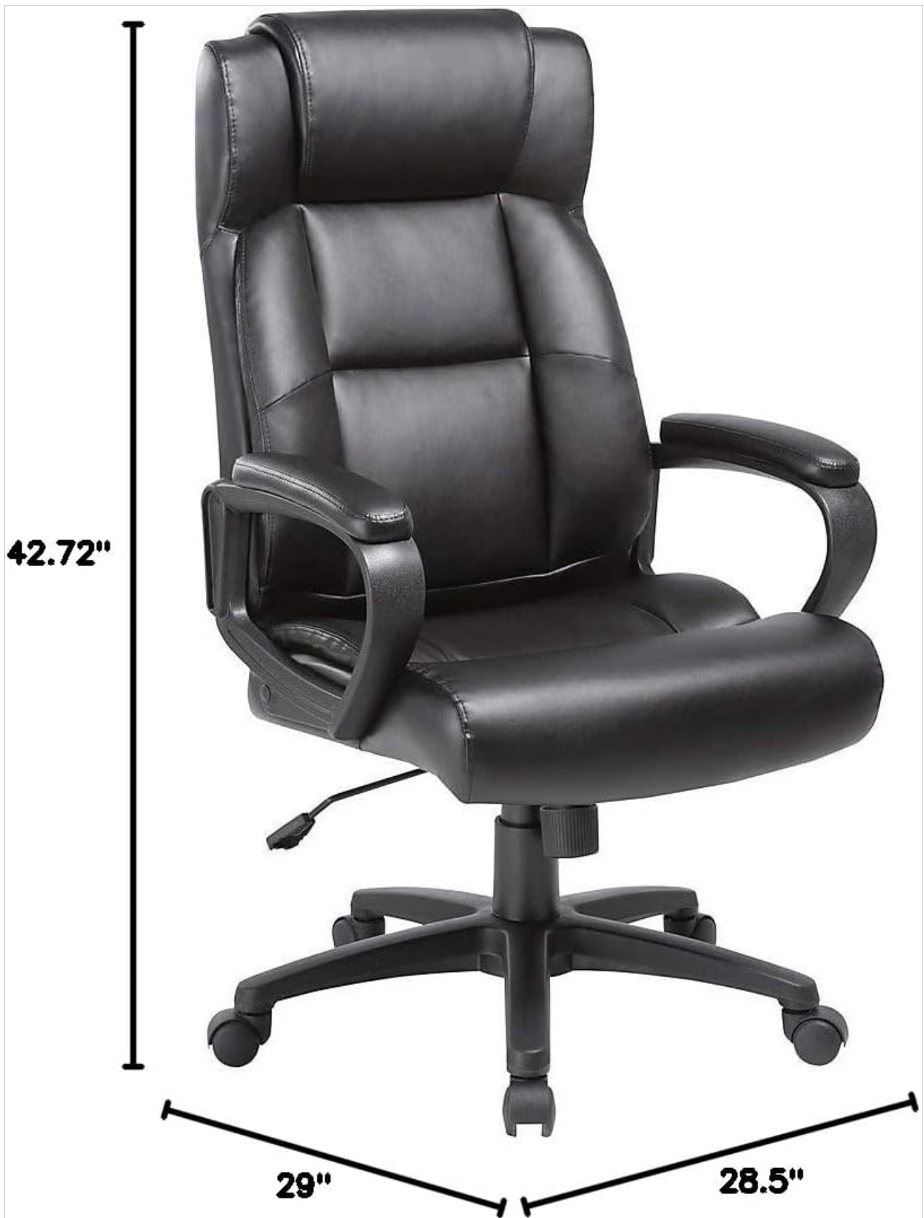
Image 7.1: Diagram illustrating the dimensions of the Lorell Soho Executive Chair, including overall height, width, and depth, as well as seat and backrest measurements.