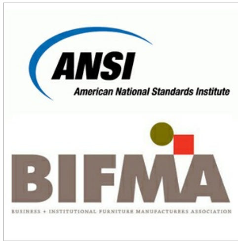
Image 8.1: Logos for ANSI (American National Standards Institute) and BIFMA (Business + Institutional Furniture Manufacturers Association), indicating compliance with industry standards.