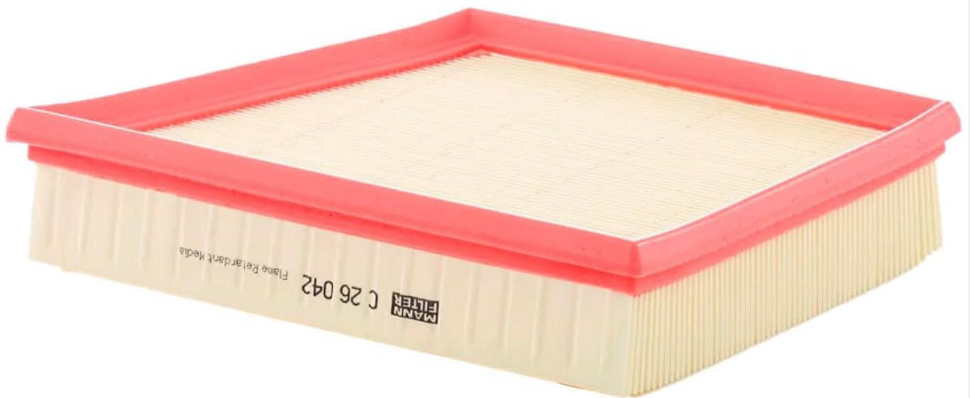
Image: Front view of the MANN-FILTER C 26 042 Air Filter, highlighting the clean filter media.

Vedações robustas e de alta qualidade que impedem a entrada de contaminantes no ar aspirado, evitando assim, o desgaste do motor.