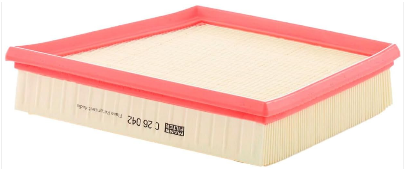
Image: Main view of the MANN-FILTER C 26 042 Air Filter, showing its rectangular shape and filter media.

This air filter is compatible with various Jaguar models, including specific variants of the XE Notchback and F-Pace Closed Off-Road Vehicle. For a complete list of compatible vehicles, please refer to the product specifications or consult your vehicle's manual.