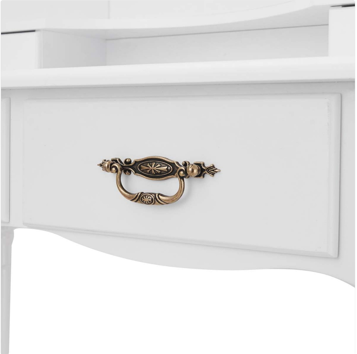
Figure 6.1: Detail of the rust-proof hardware, designed for long-term use.