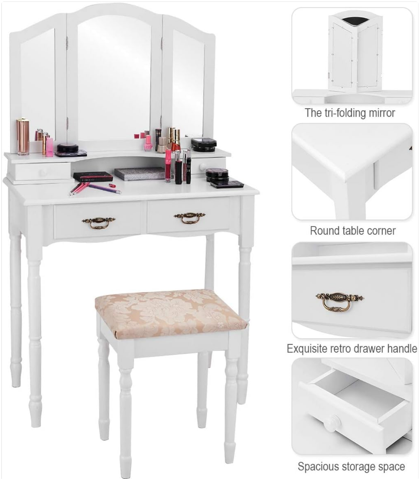
Figure 4.1: The detachable mirror top allows the vanity to function as a writing desk.