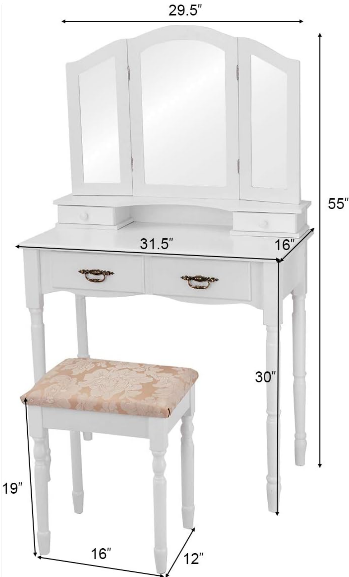
Figure 4.2: Product dimensions for assembly planning.