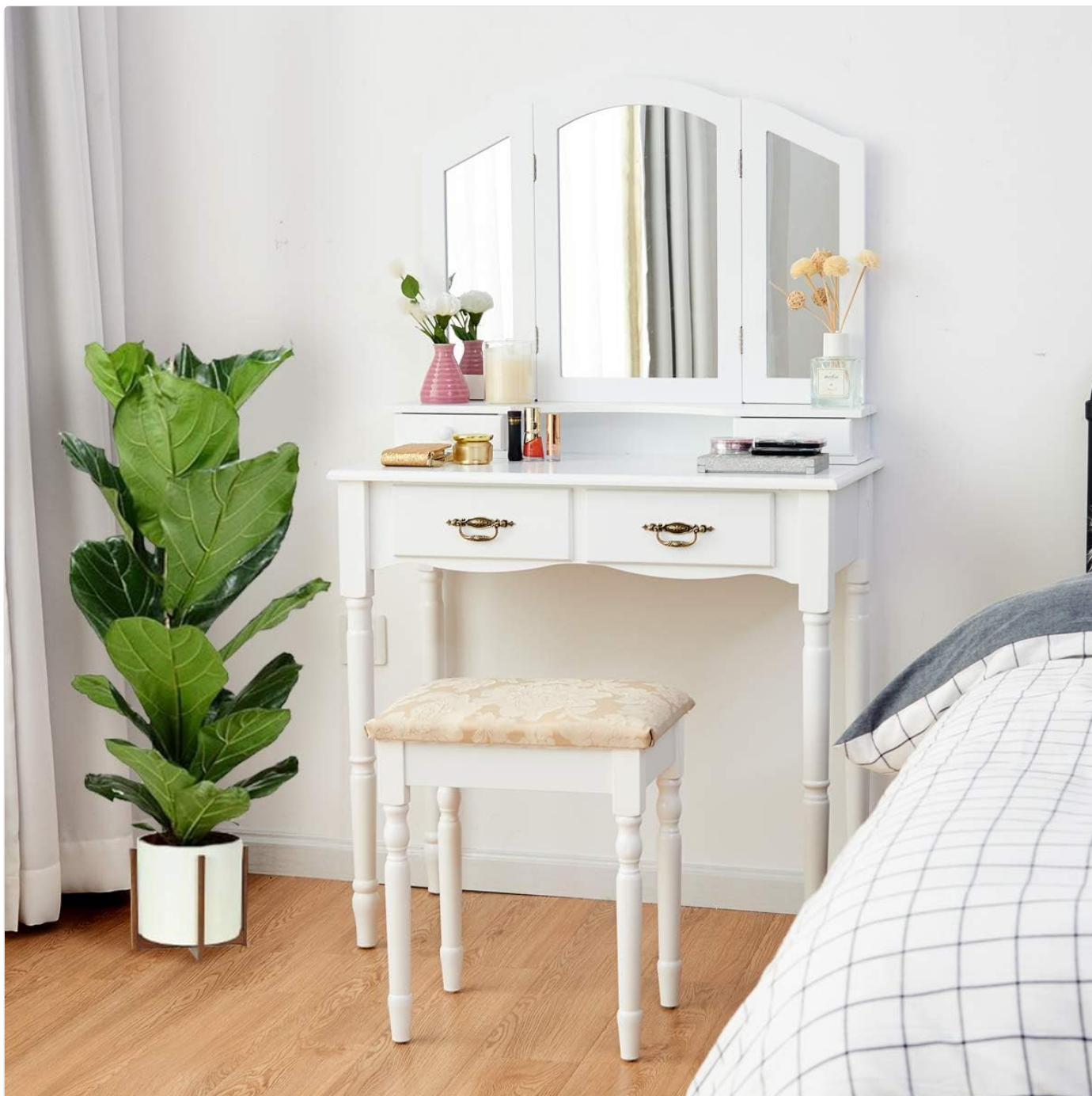
Figure 1.1: Giantex Vanity Set with Tri-Folding Mirror and Stool.