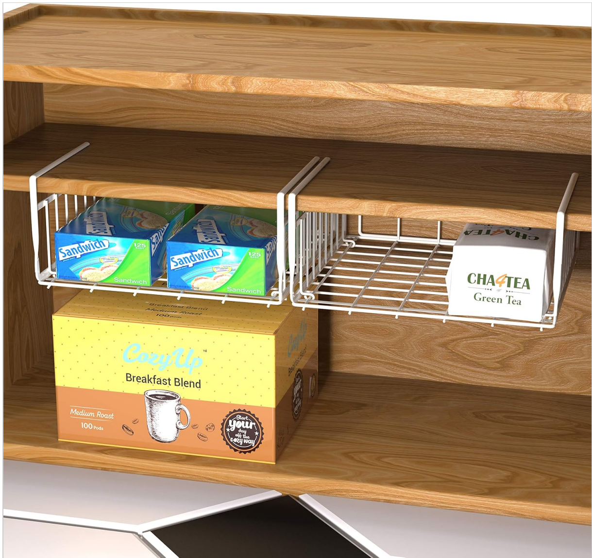
Figure 3: Example of pantry organization with under shelf baskets.