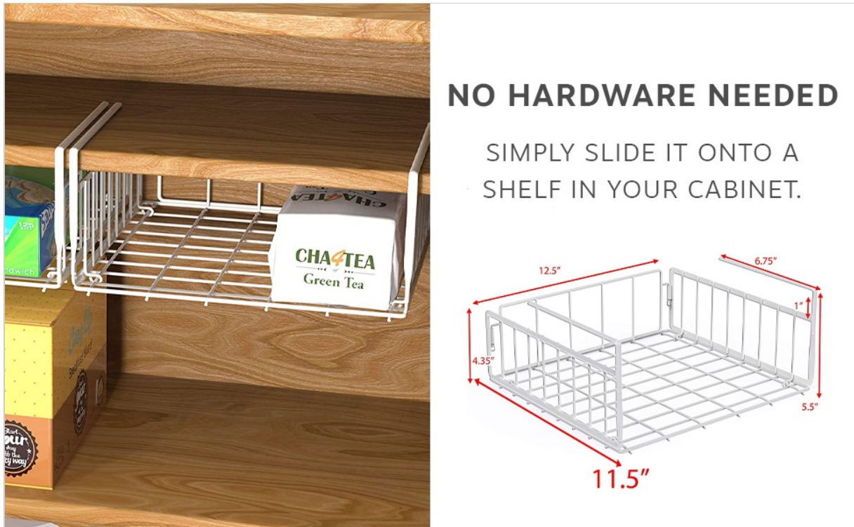
Figure 2: Simple slide-on installation process.