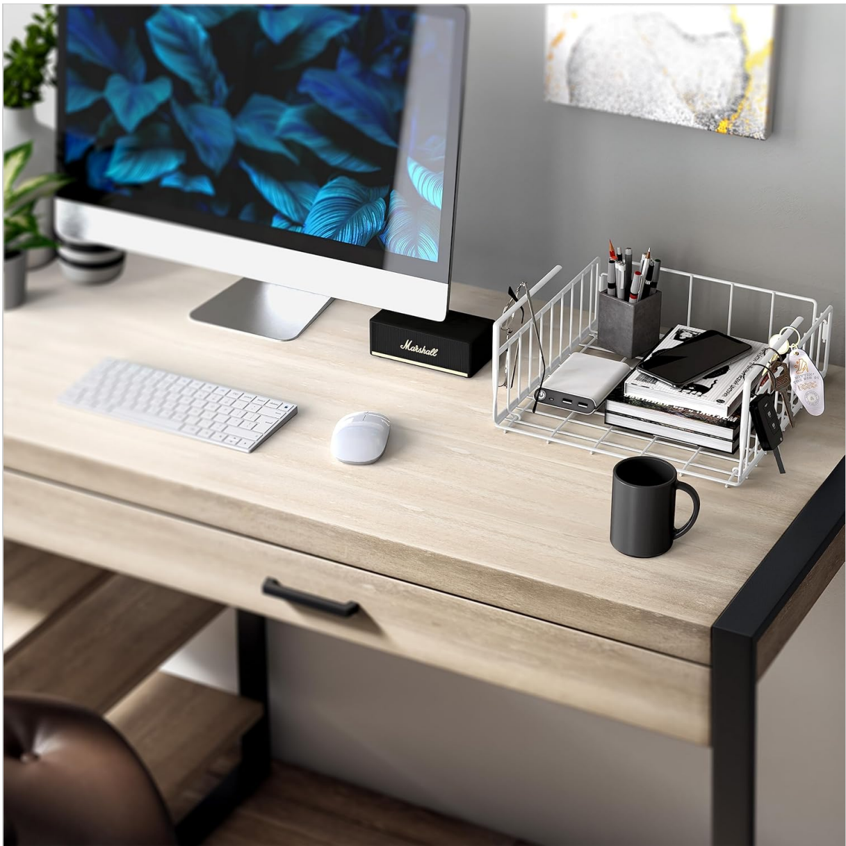
Figure 4: Example of office desk organization with an under shelf basket.