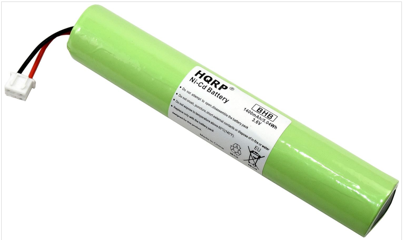
Image: The HQR Ni-Cd replacement battery, showing its green casing, white connector, and printed warning labels regarding safe handling and disposal.