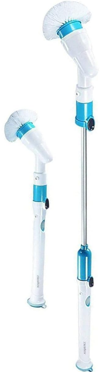
Image: The HQR Ni-Cd battery alongside illustrations of the Hurricane Spin Scrubber, highlighting features such as "High Quality Cells," "Safe and Reliable," and "Long-lasting and Stable Performance."