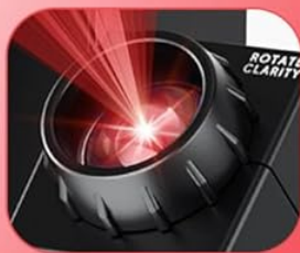
360° Focus Ring