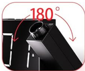
180° Rotatable Projector