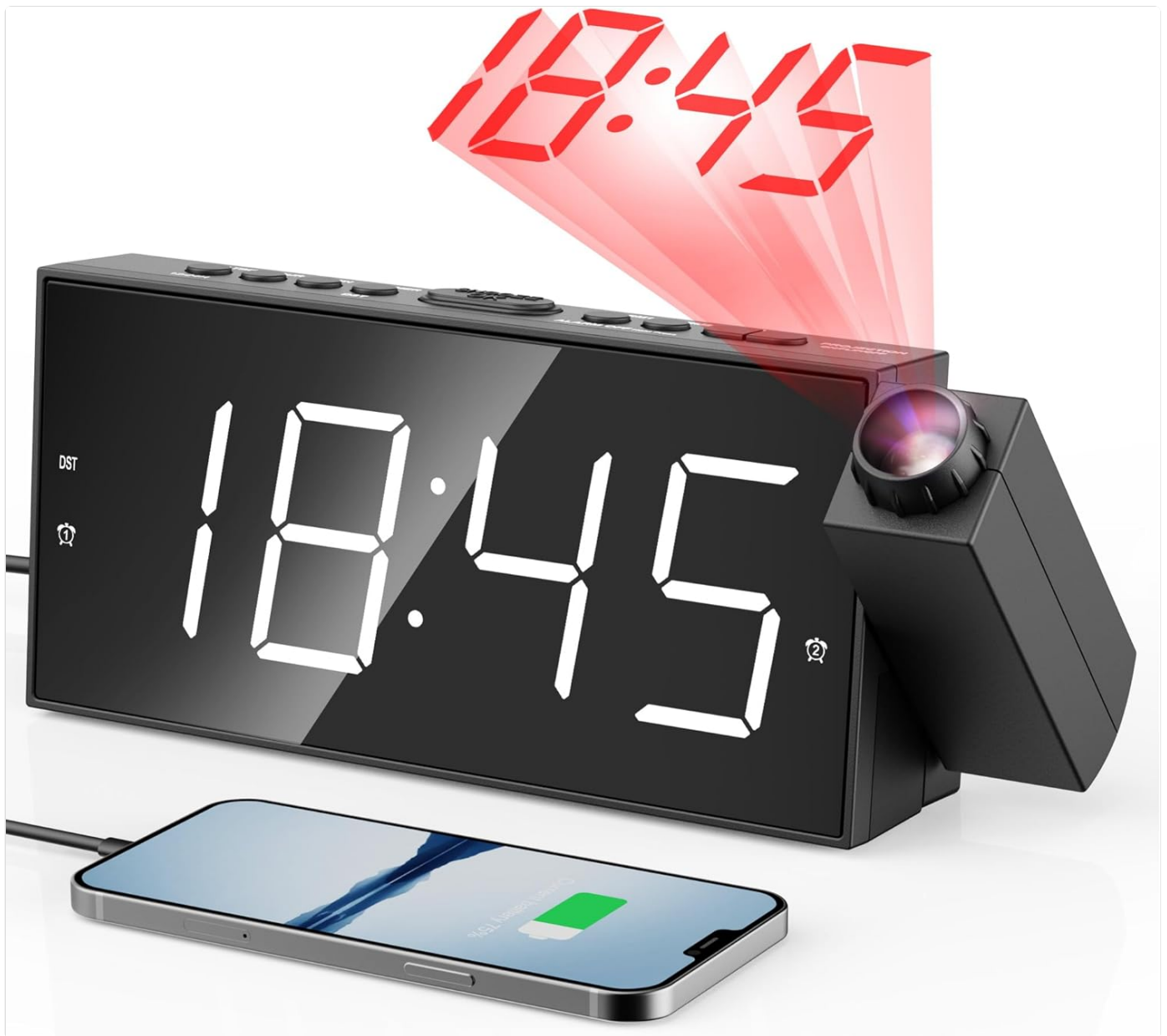
The Mesqool Ultra-Clear Digital Alarm Clock, featuring its large display, time projection, and USB charging capability.