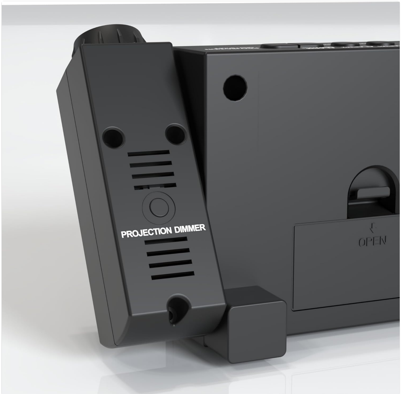
The projection dimmer switch is located on the side of the projector.