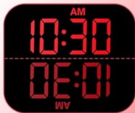
180° Flip of Projection Image