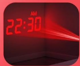
Projection Distance: 1.64~10ft

Adjust the projection angle, focus, and flip the image for optimal viewing.