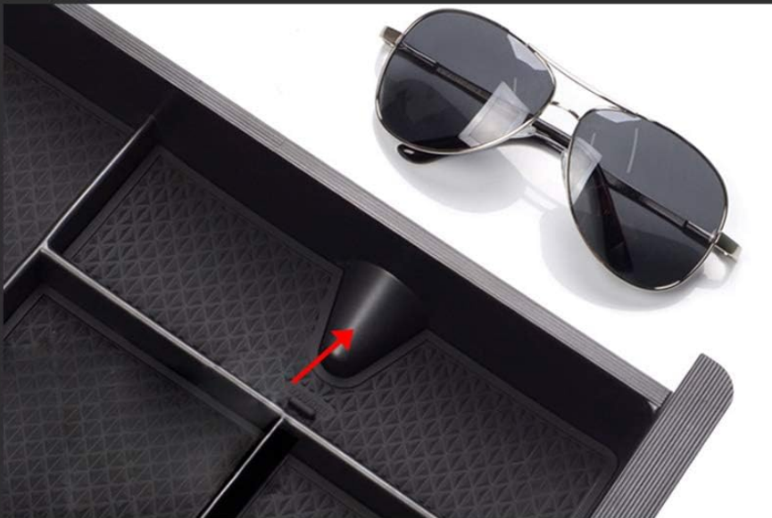
Image 2.5: This image demonstrates how the coin box can be securely fixed into various positions within the organizer tray using its integrated buckles, indicated by red circles.

Prevent glasses from rolling or scratches.