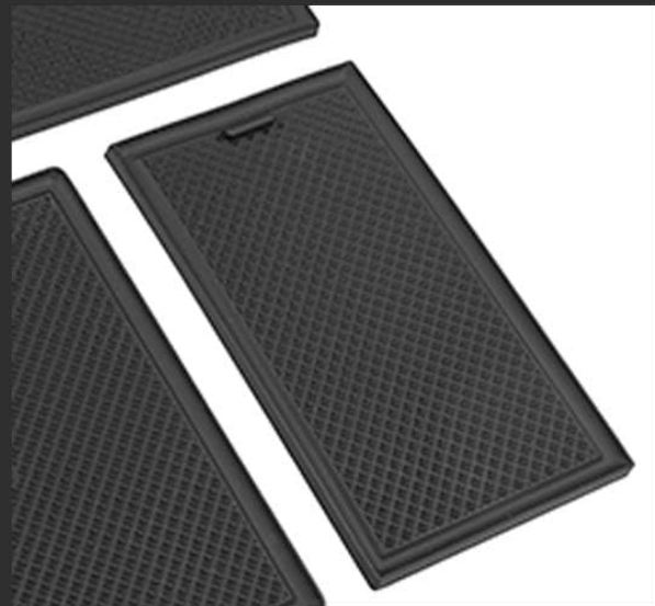
Image 2.3: This image highlights the high-quality ABS and PC materials used in the organizer's construction (top panel) and the textured silicone mats designed to prevent items from slipping (bottom panel).

Silicone mat prevents objects from slipping