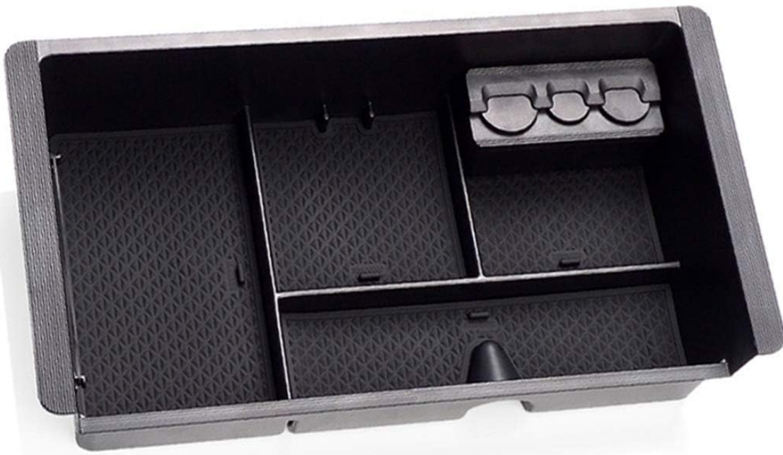
Image 3.1: The Jaronx Center Console Organizer Tray shown installed in a vehicle's console, demonstrating its seamless integration and immediate organizational benefits.