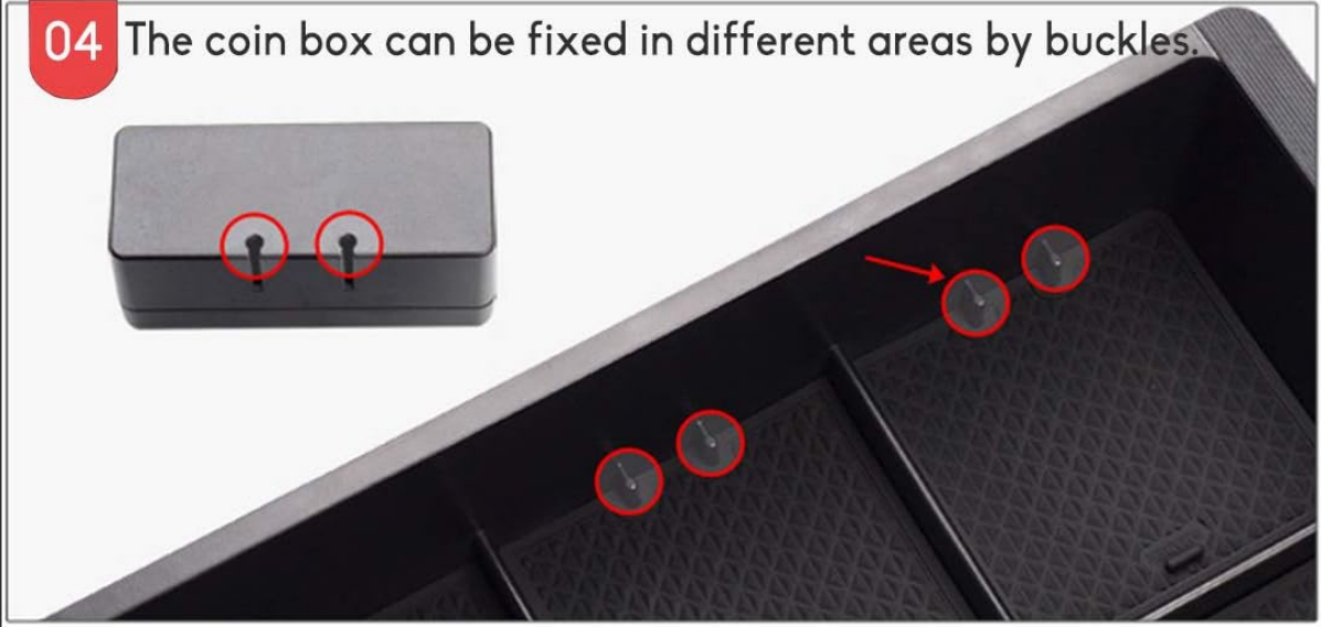
Image 2.4: The detachable coin organizer is shown, designed to securely hold coins. This component can be removed or repositioned as needed.

04 The coin box can be fixed in different areas by buckles.