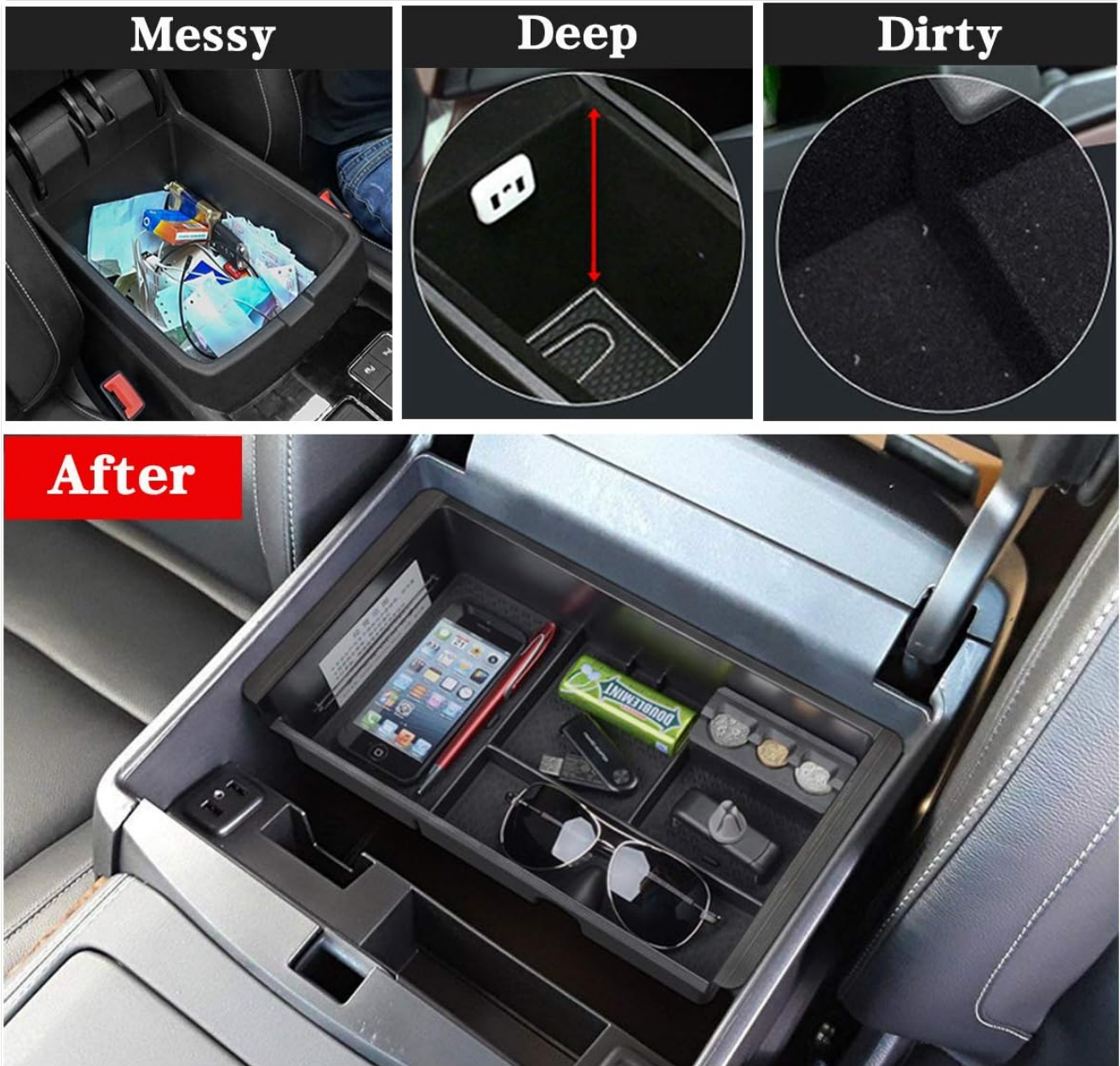
Image 2.1: The top row shows a messy, deep, and dirty console. The bottom image shows the same console after installation of the organizer, demonstrating improved organization and accessibility.