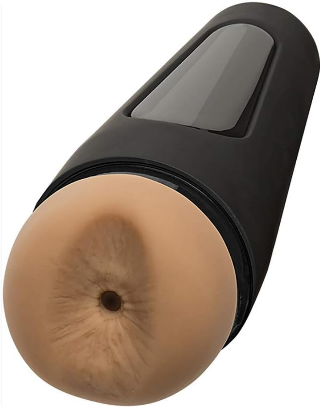
Image 1.1: The Doc Johnson Man Squeeze - Bear, showcasing its discreet black casing and the realistic ULTRASKYN insert.