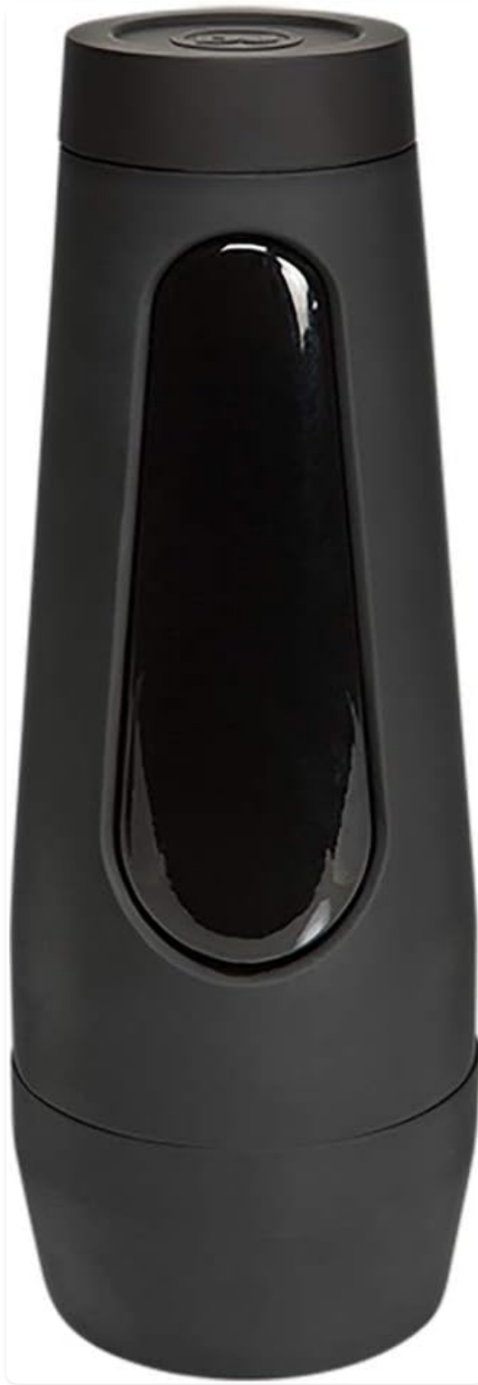
Image 4.1: The Man Squeeze - Bear fully assembled within its discreet hard case.