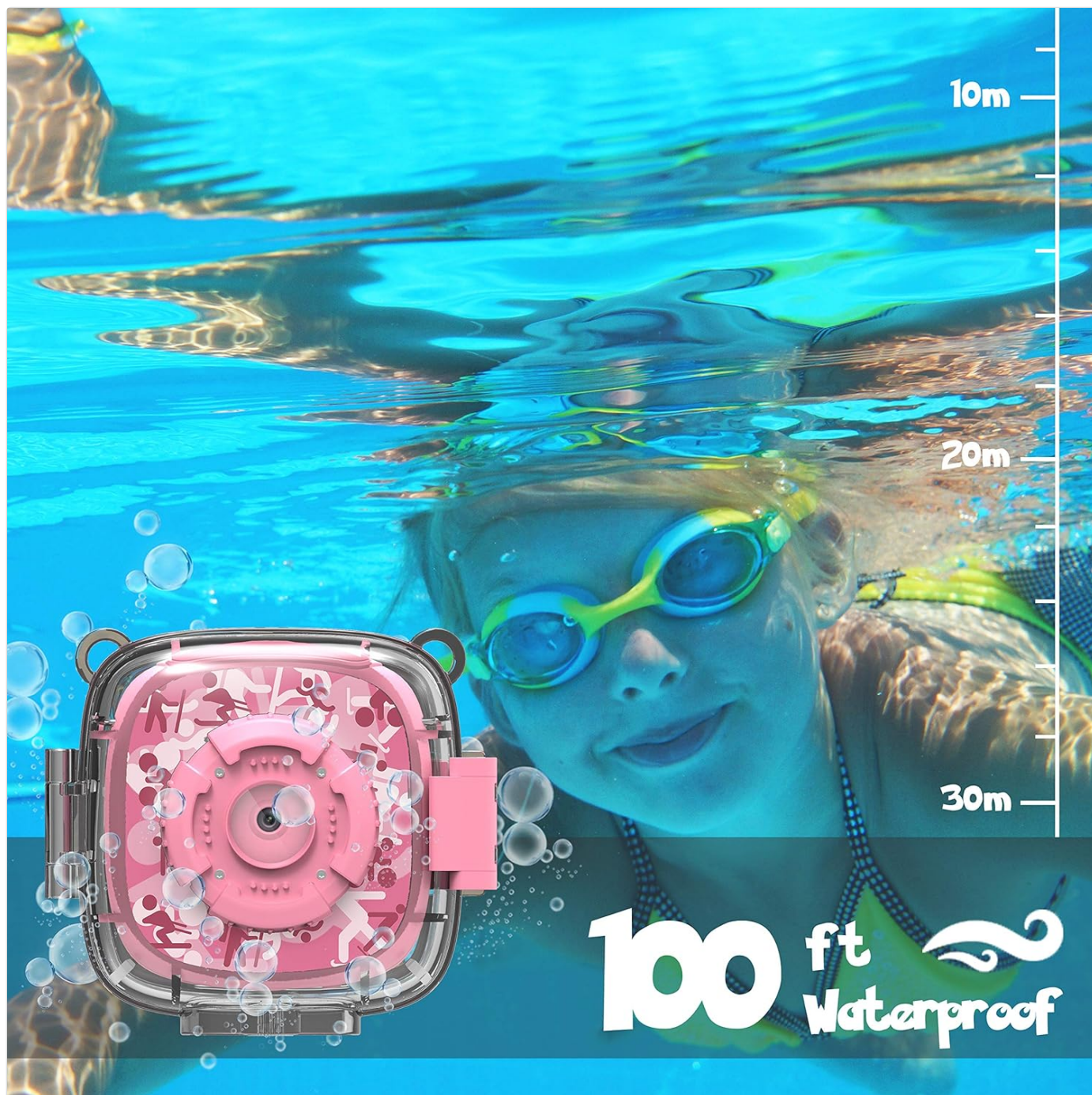
Image: The AKAMATE Kids Action Camera submerged in its waterproof case, demonstrating its capability for underwater use.

Warning: Always test the waterproof case without the camera inside first to ensure no leaks. The case is designed for depths up to 30m (100ft).