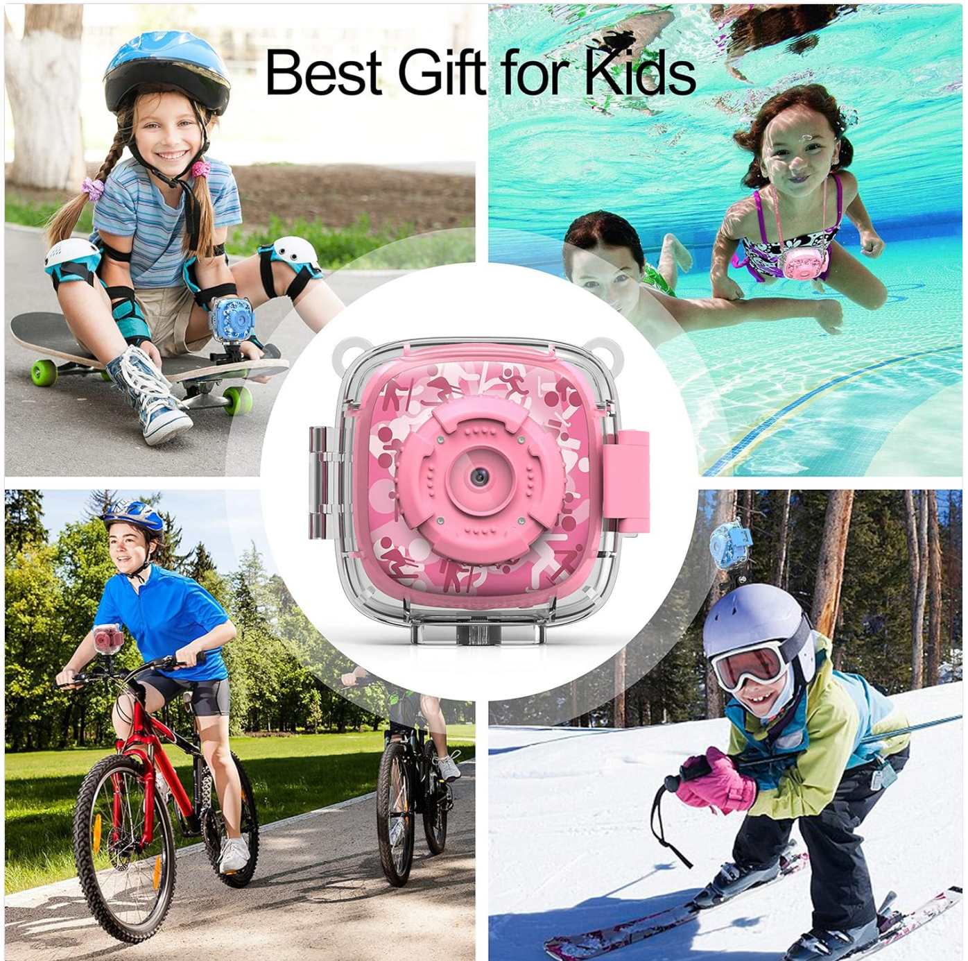
Image: The AKAMATE Kids Action Camera and its various accessories, including the carrying case, demonstrating how to keep all components organized and protected.

Store the camera and its accessories in the provided zipper carry bag to protect them from dust and damage.