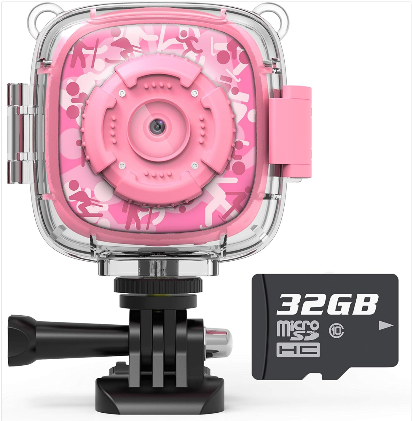
Image: The AKAMATE Kids Action Camera in its waterproof case, alongside the included 32GB Micro SD card, ready for insertion.