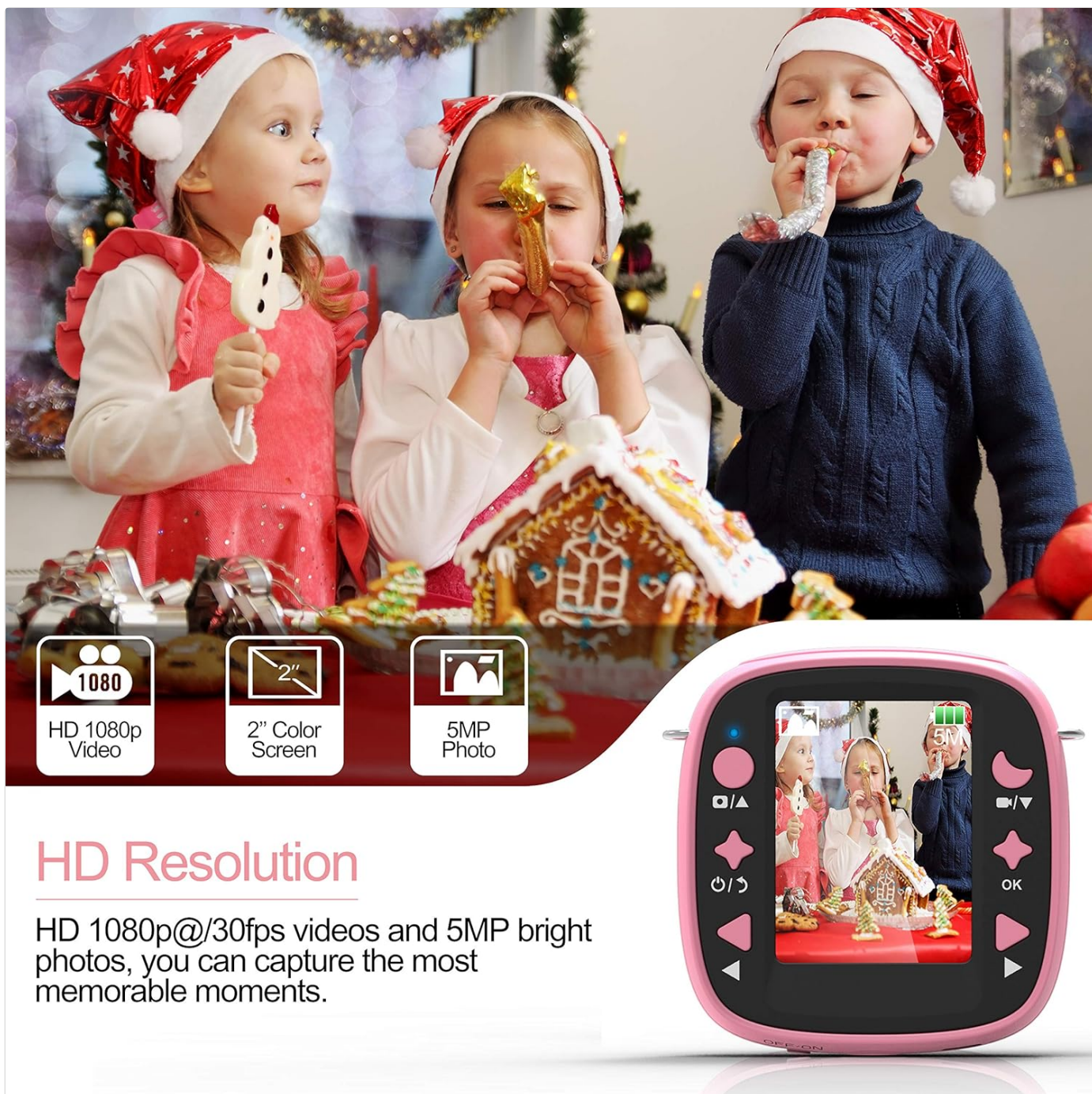
Image: The camera's screen showing a captured image, highlighting its HD 1080p video and 5MP photo capabilities.