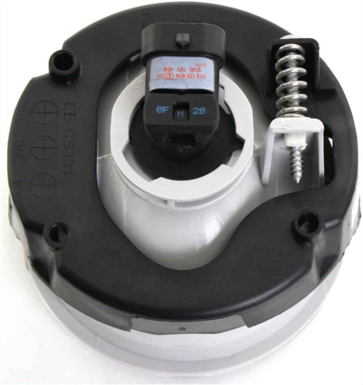
Image 2: Rear view of the fog light, highlighting the bulb and adjuster mechanism.