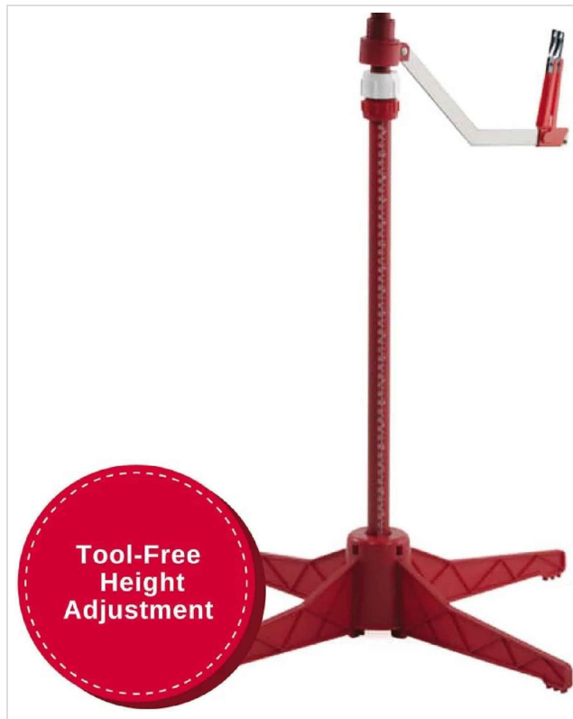
Figure 3.1: The dress form stand with the height adjustment and hem guide components.

Video 3.1: Official SINGER video demonstrating the assembly and basic features of the Red Dress Form.