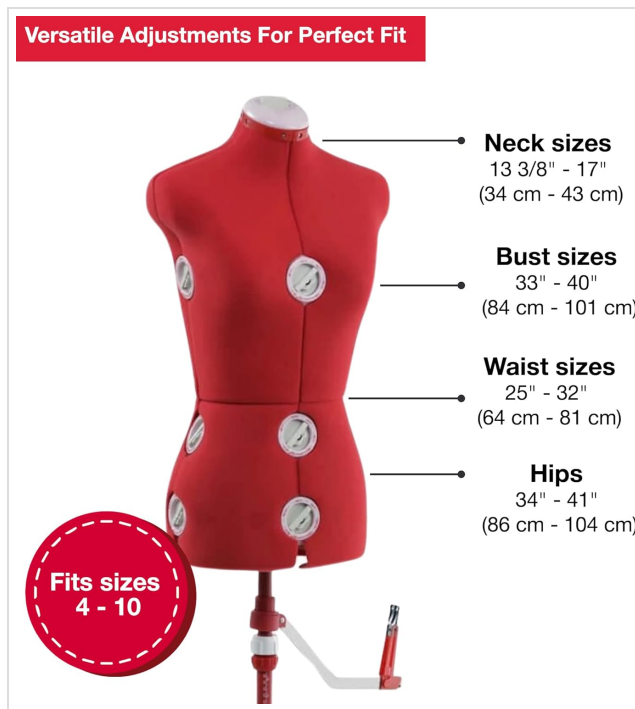
Figure 4.1: The dress form showing adjustable measurement ranges for key body areas.