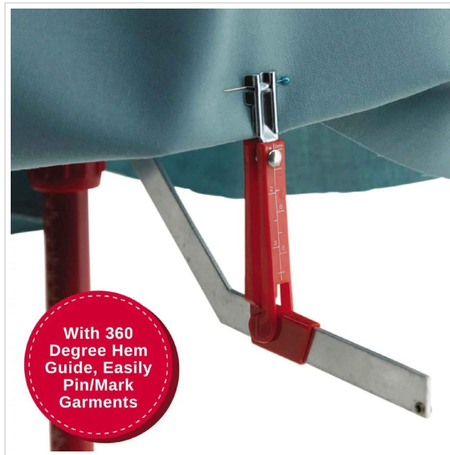
Figure 4.3: The 360-degree hem guide in action for precise garment marking.