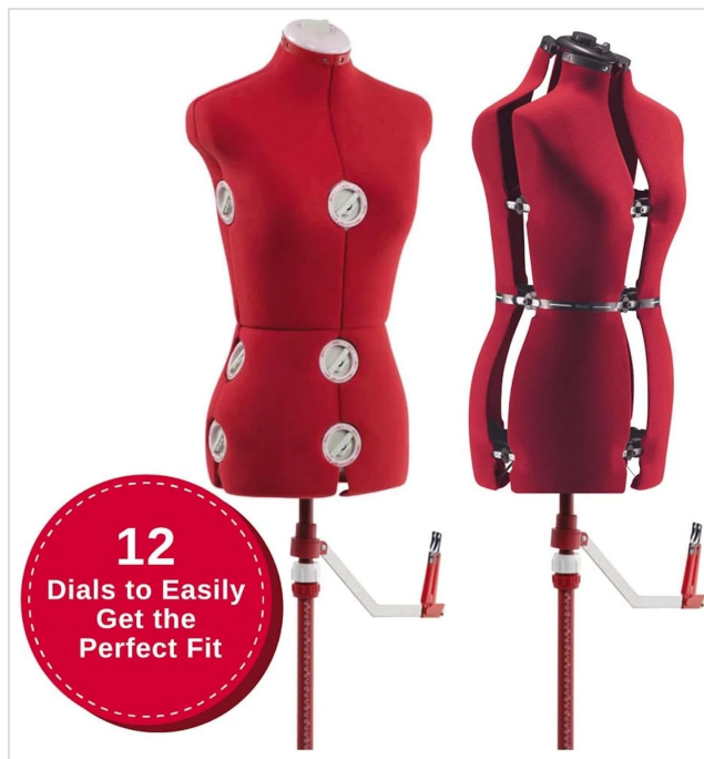
Figure 2.1: Front and back view of the SINGER Adjustable Red Dress Form, highlighting the 12 adjustment dials.