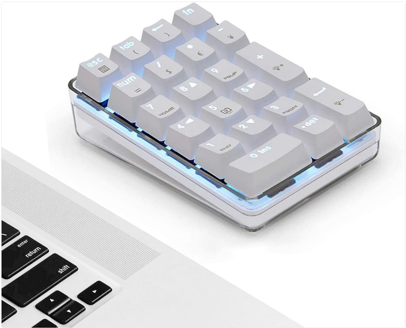
The Magicforce 21-Key Mechanical Numeric Keypad, shown connected to a laptop, features a compact design and LED backlighting.