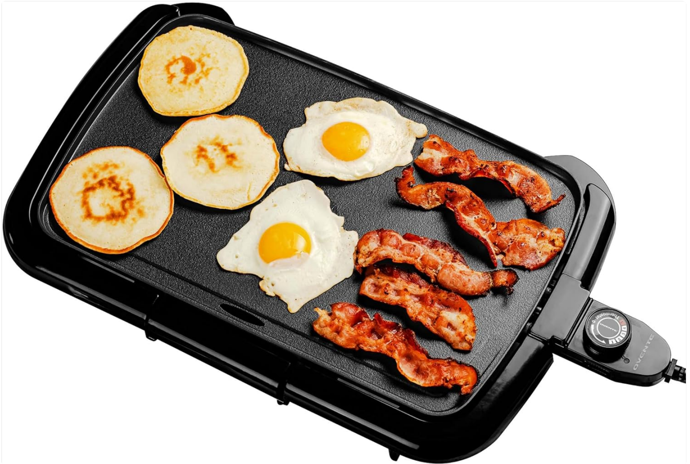
The OVENTE Electric Griddle in use, demonstrating its cooking capacity for breakfast items.