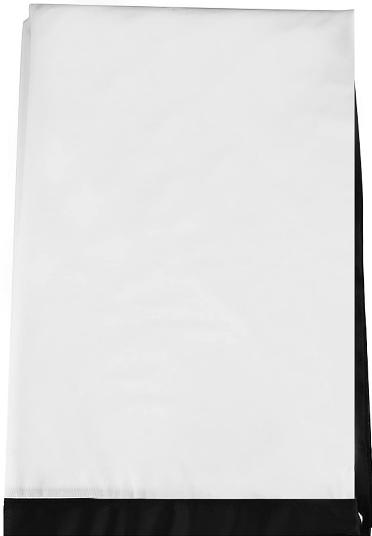
Image: The ASHATA 72-inch projector screen displaying a vibrant image, suitable for home theater use.