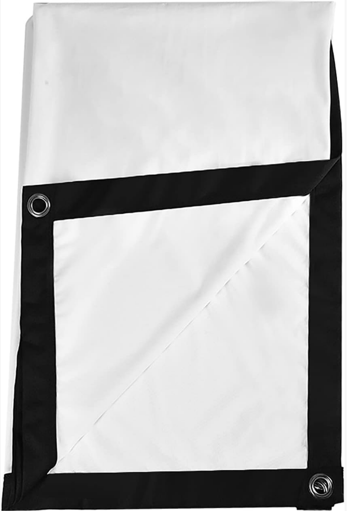
Image: The ASHATA projector screen folded for storage, demonstrating its portable and compact design.