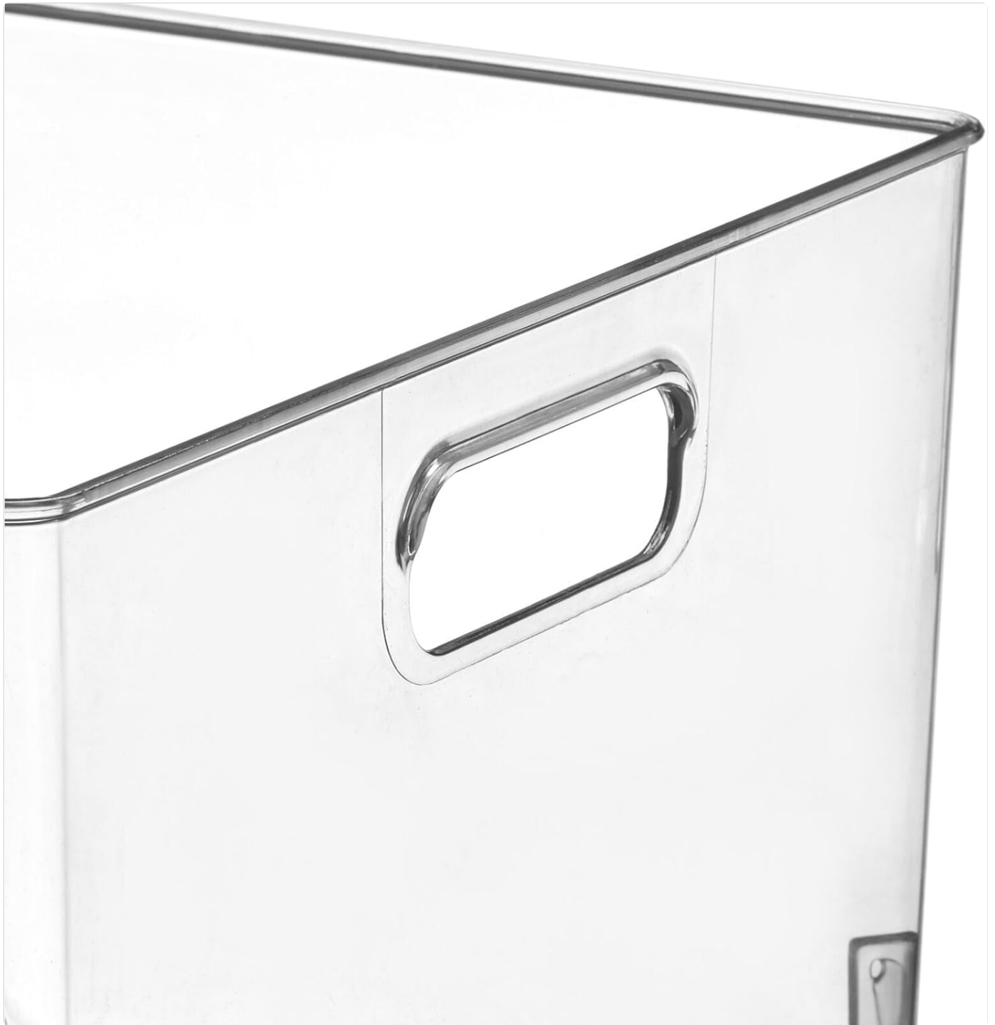
Figure 3: Close-up of the integrated handle, highlighting the ergonomic design for easy carrying.