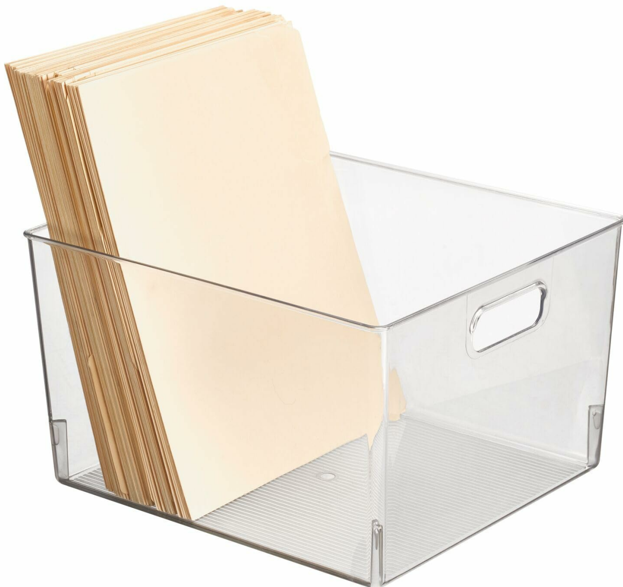
Figure 1: mDesign Large Plastic Storage Organizer Bin, demonstrating its capacity for a legal pad.