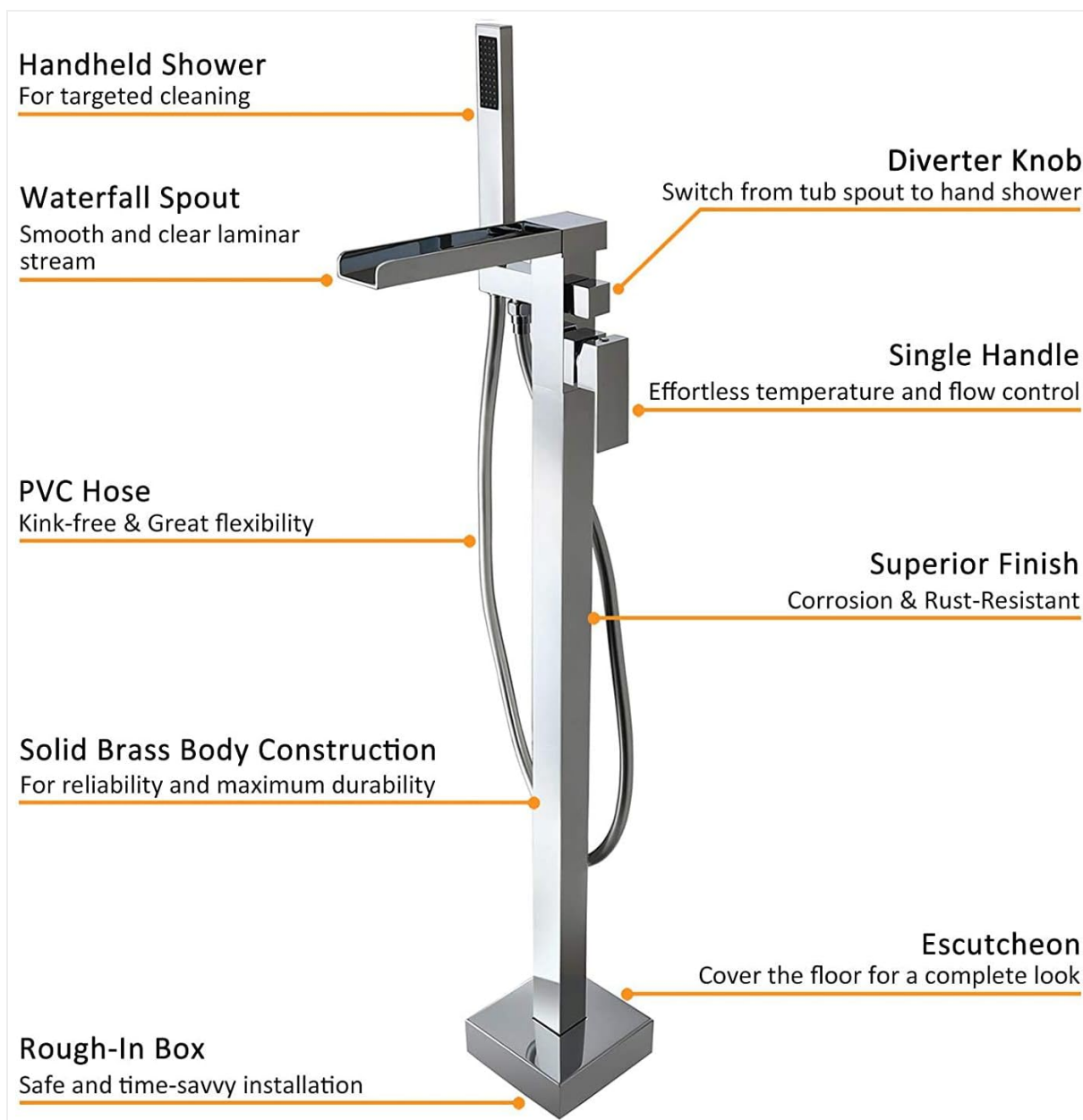
Image: Labeled diagram highlighting key components of the faucet, such as the waterfall spout, handheld shower, and diverter knob, which are important for understanding installation and operation.