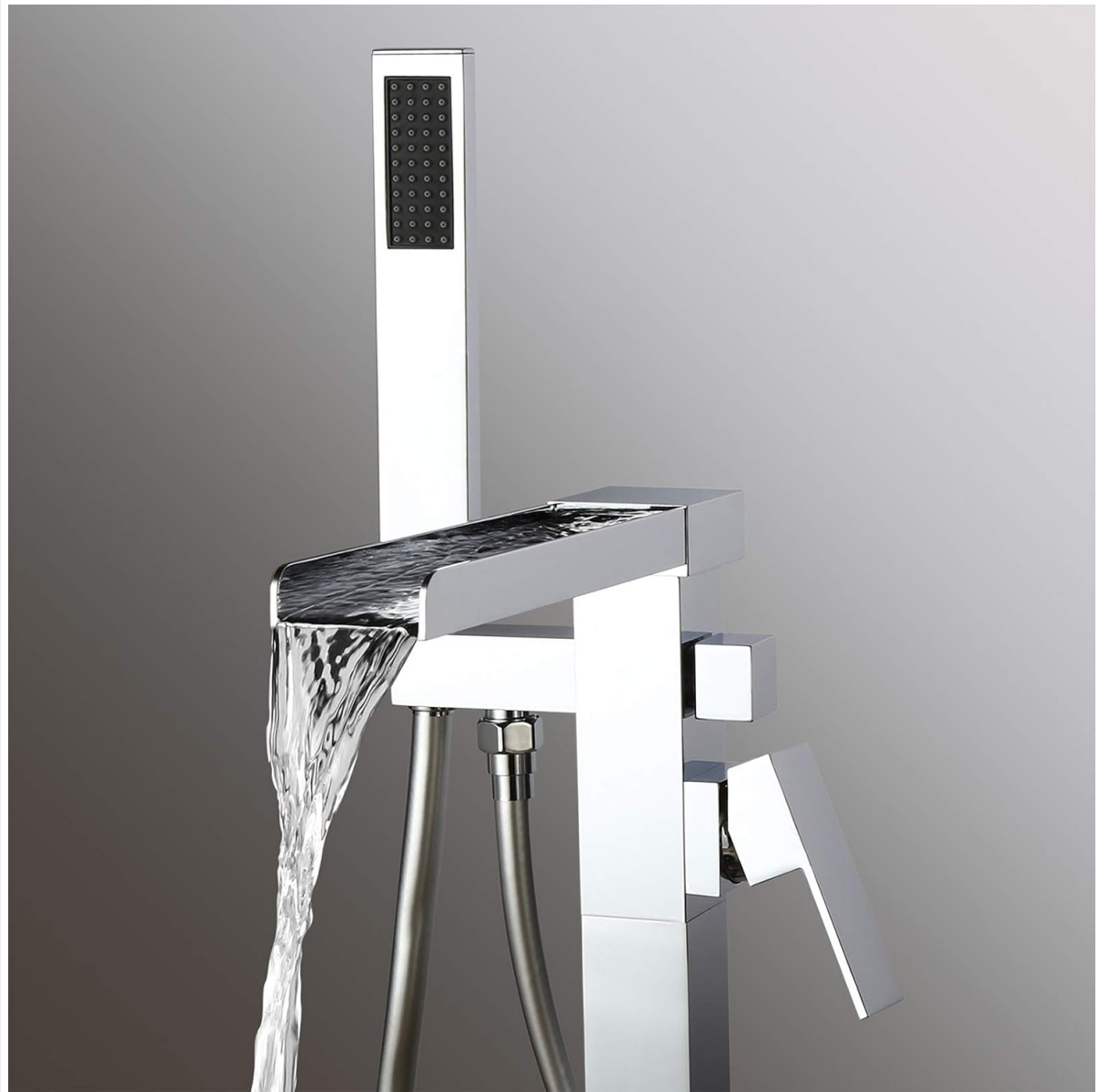
Image: The faucet's waterfall spout in operation, demonstrating the smooth laminar stream of water.

Once the diverter knob is engaged, the handheld sprayer will provide water. Direct the sprayer as needed for targeted cleaning or rinsing.