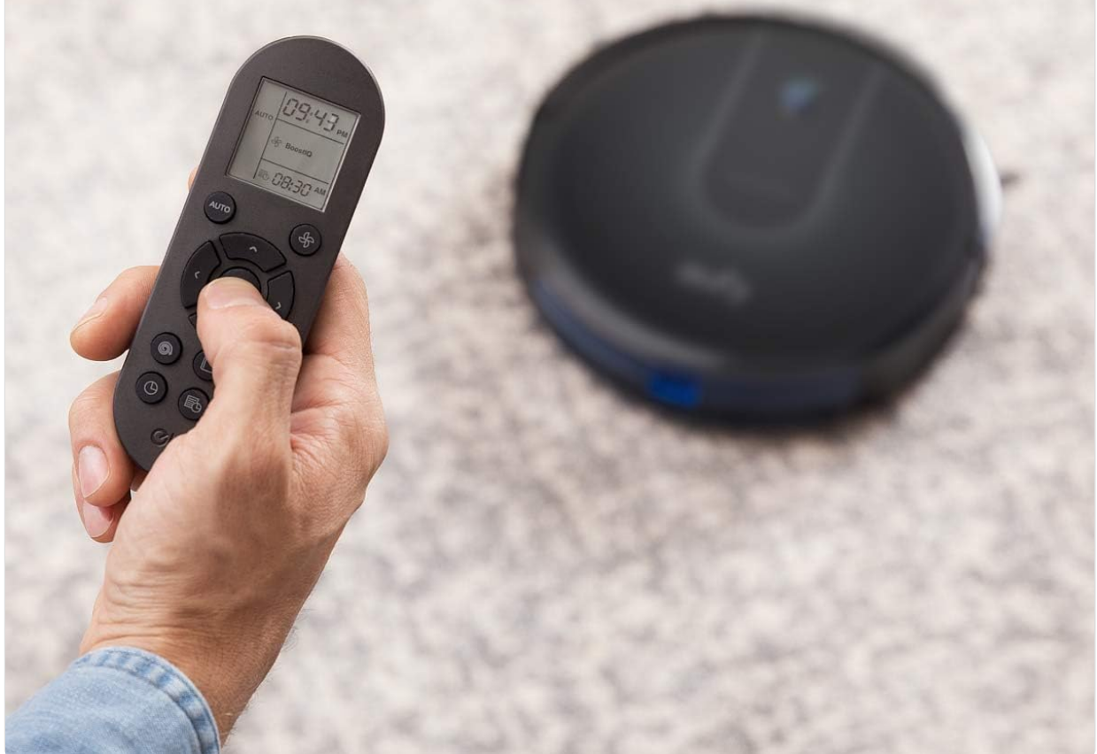
Image: A hand holding the remote control for the eufy RoboVac 12, with icons representing different cleaning modes (Auto, Spot, Edge, Single Room) visible on the remote and above the vacuum.