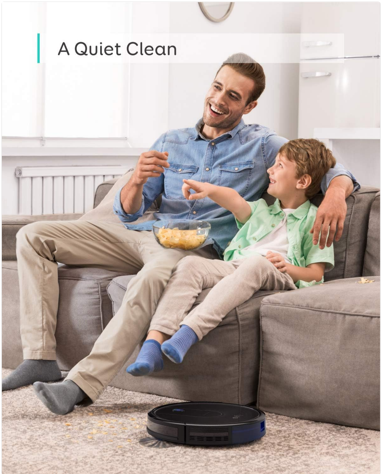
Image: The eufy RoboVac 12 cleaning a carpet in a living room while a man and child relax on a sofa, emphasizing its quiet operation.