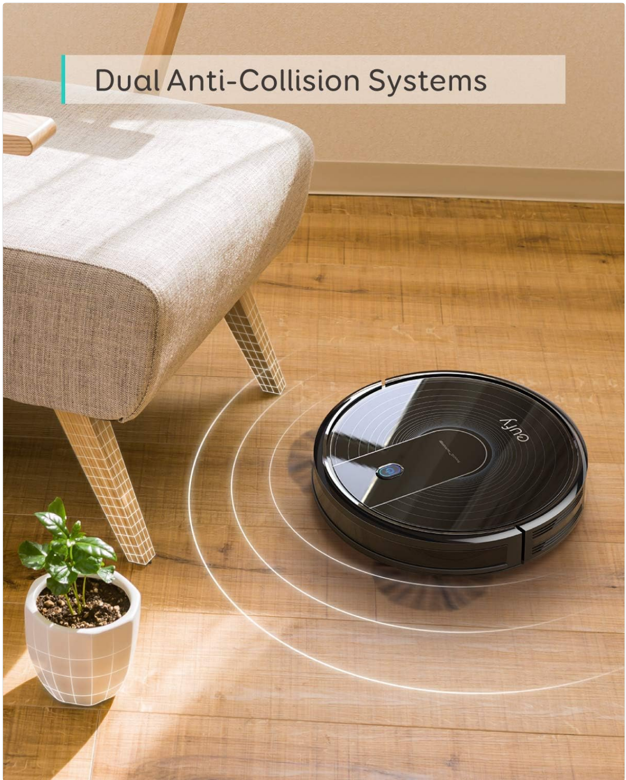
Image: The eufy RoboVac 12 navigating around furniture on a hard floor, illustrating its dual anti-collision systems with circular sensor waves.