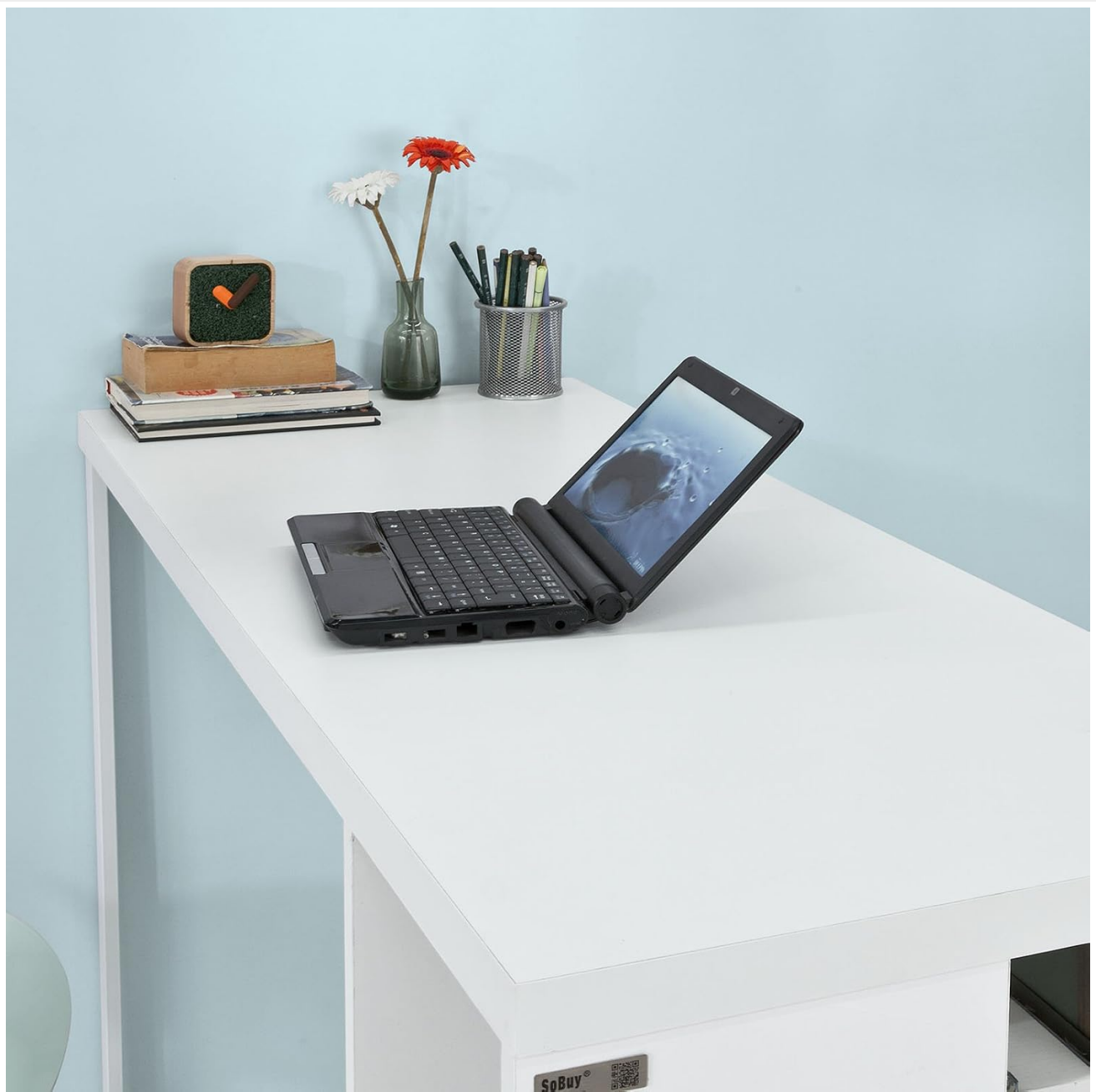
Image 4.2: The bar table functioning as a compact workspace, with a laptop placed on its surface.