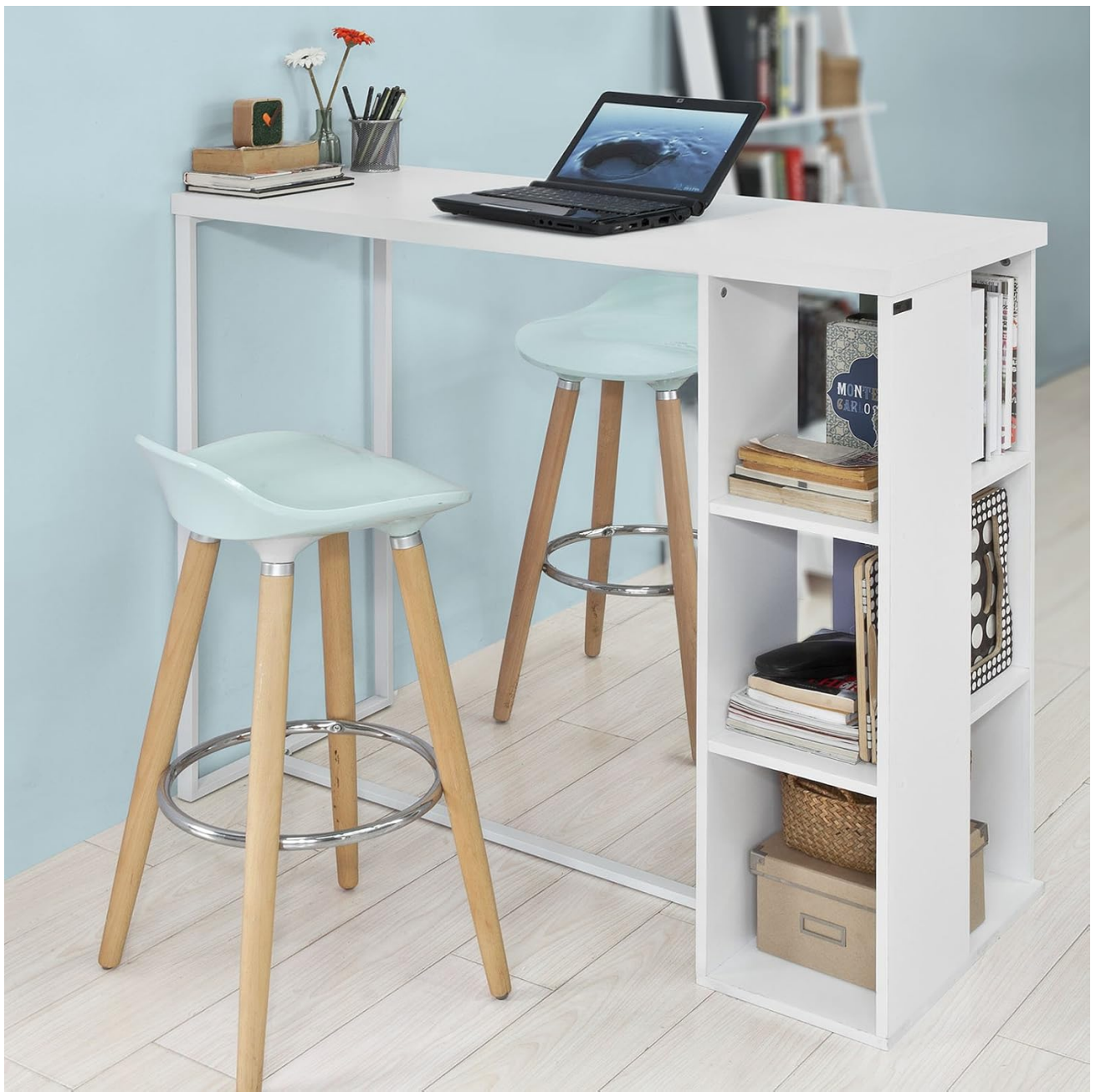
Image 1.2: The FWT39-W bar table in a kitchen environment, showcasing its use with bar stools and items stored on its shelves.