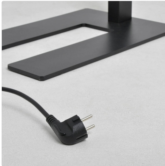
Figure 3.1: The U-shaped base and power plug of the Arcchio Logan lamp, indicating the components for stable placement and electrical connection.