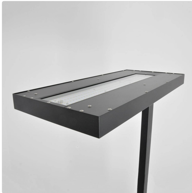
Figure 1.2: Top view of the Arcchio Logan lamp head, revealing the integrated LED array that provides powerful and efficient illumination.