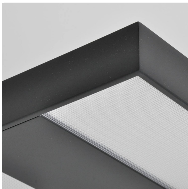
Figure 6.1: Detailed view of the prismatic diffuser on the underside of the lamp head, designed to provide glare-free light.