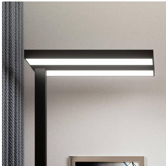
Figure 5.2: Close-up of the lamp head with the LED lights illuminated, showing the dual light strips and the prismatic diffuser.