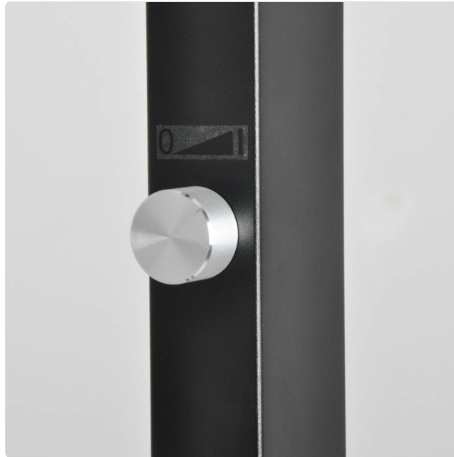
Figure 5.1: Close-up view of the swivelling dimmer switch on the Arcchio Logan lamp, used for adjusting light brightness.