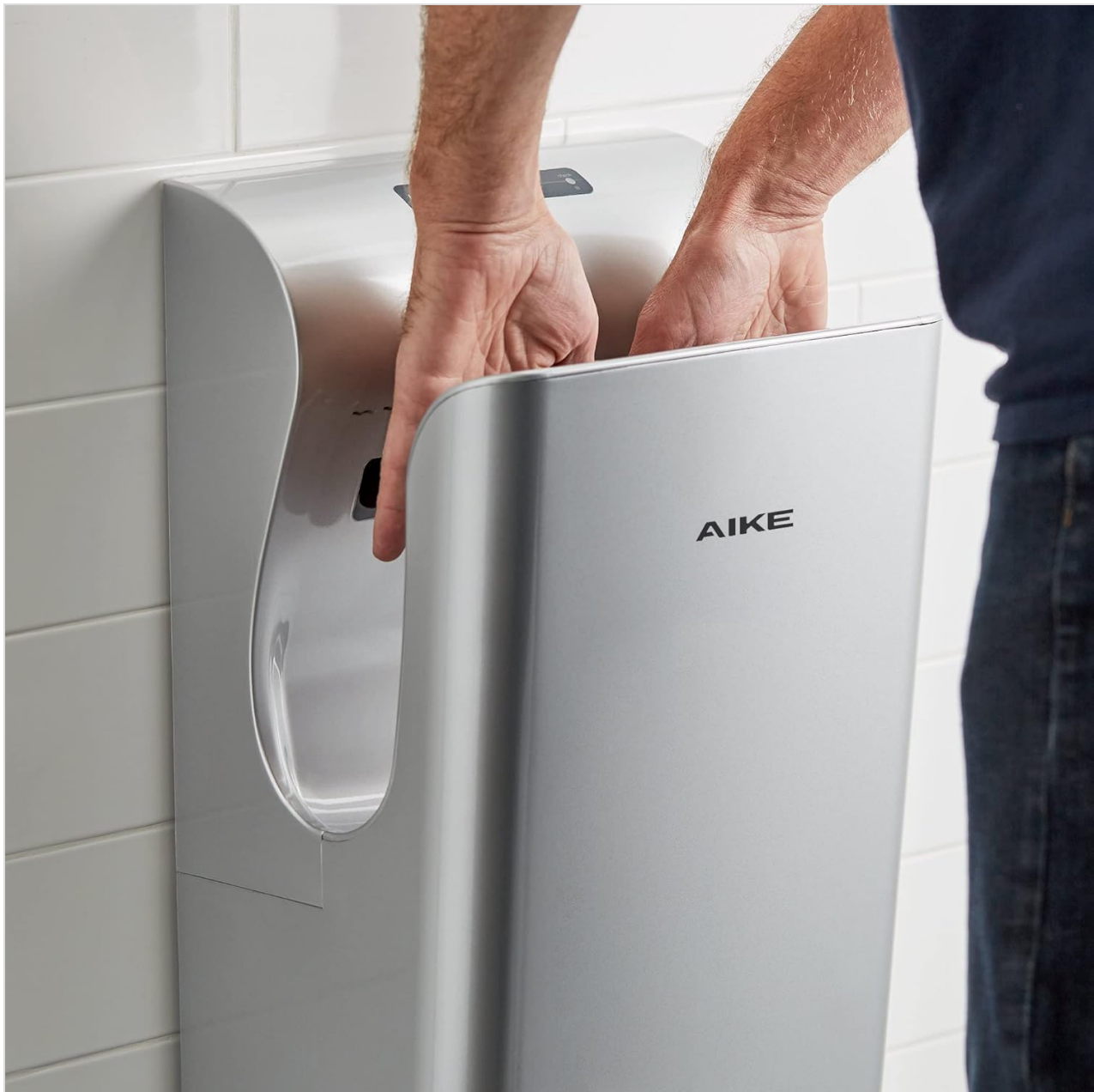
Figure 3.1: Front view of the AIKE AK2030 Hand Dryer.

The AIKE AK2030 hand dryer features a robust outer casing, internal air ducts, a powerful brushless motor, and a dual HEPA filtration system. A water collection tank is located at the base of the unit.