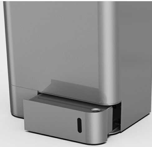
Figure 3.2: Illustration of the two-stage HEPA filtration system, designed to capture germs and particles.

500ml water drain tank with level window, keeps the ground clean.