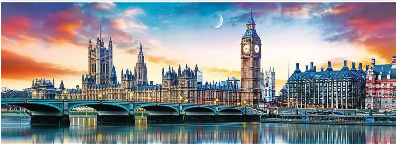
Figure 2: The completed puzzle, showcasing the panoramic London cityscape.