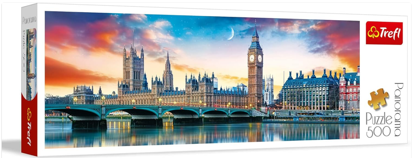
Figure 1: The Trefl Panorama London Big Ben and Palace of Westminster 500 Piece Jigsaw Puzzle box.

Welcome to the world of Trefl puzzles! This manual provides essential information and guidance for assembling your Trefl Panorama London Big Ben & Palace of Westminster 500 Piece Jigsaw Puzzle. This high-quality puzzle features a stunning evening city view of London, including iconic landmarks like Big Ben and the Palace of Westminster. Designed for individuals aged 10 and up, jigsaw puzzles offer a relaxing and engaging activity that enhances observation, concentration, and manual skills.