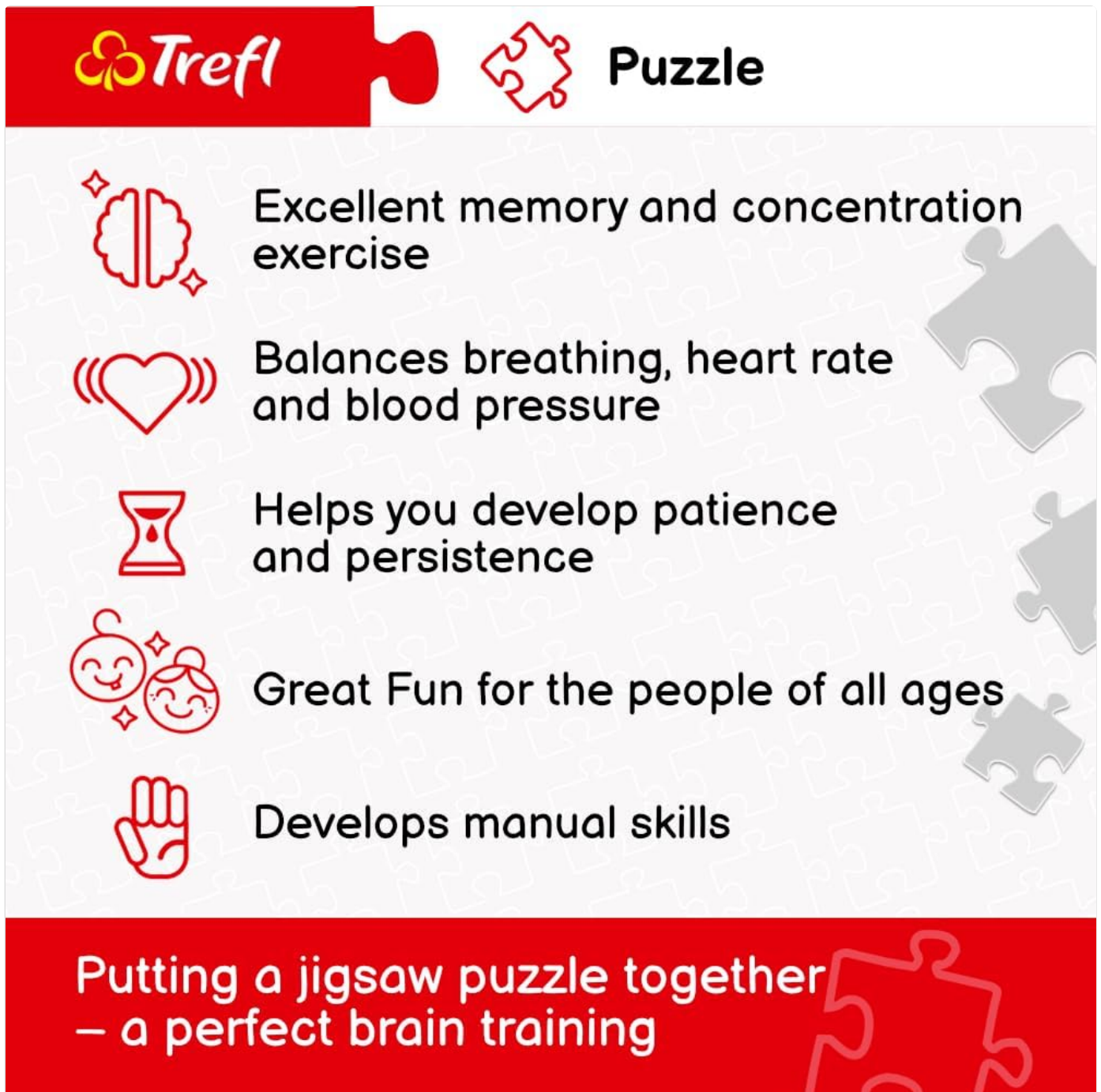
Figure 3: Jigsaw puzzles offer numerous cognitive benefits, including improved memory, concentration, and manual dexterity.

Video 1: A guide to solving Trefl puzzles, offering tips on sorting and assembly techniques.