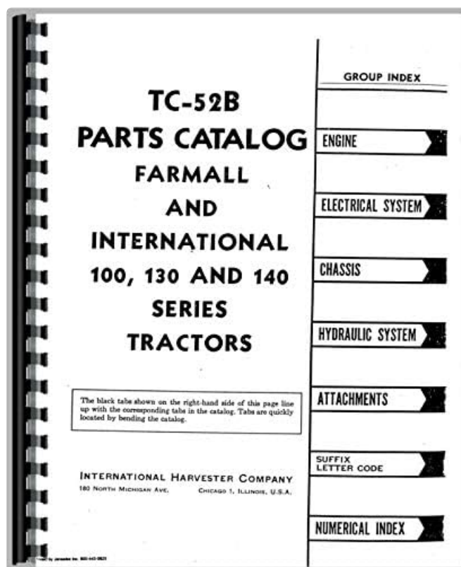
Figure 2.1: An introductory page from the manual detailing the organization and numbering system. This page explains how part numbers, illustrations, and the method of listing are used throughout the catalog.

The catalog includes a Group Index with tabs for major sections such as Engine, Electrical System, Chassis, Hydraulic System, and Attachments. These tabs are located on the right-hand side of the pages, allowing for quick navigation by bending the catalog.