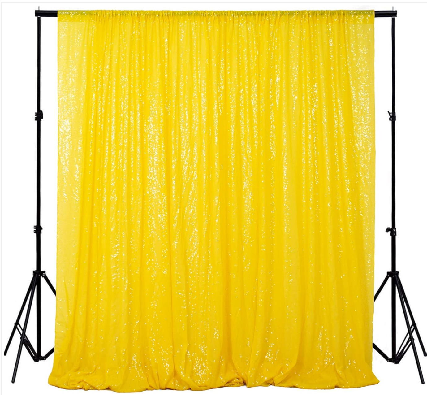
Figure 1: The ShiDianYi 4FTx7FT Yellow Glitter Sequin Backdrop, showcasing its vibrant yellow color and shimmering texture, set up on a typical backdrop stand.