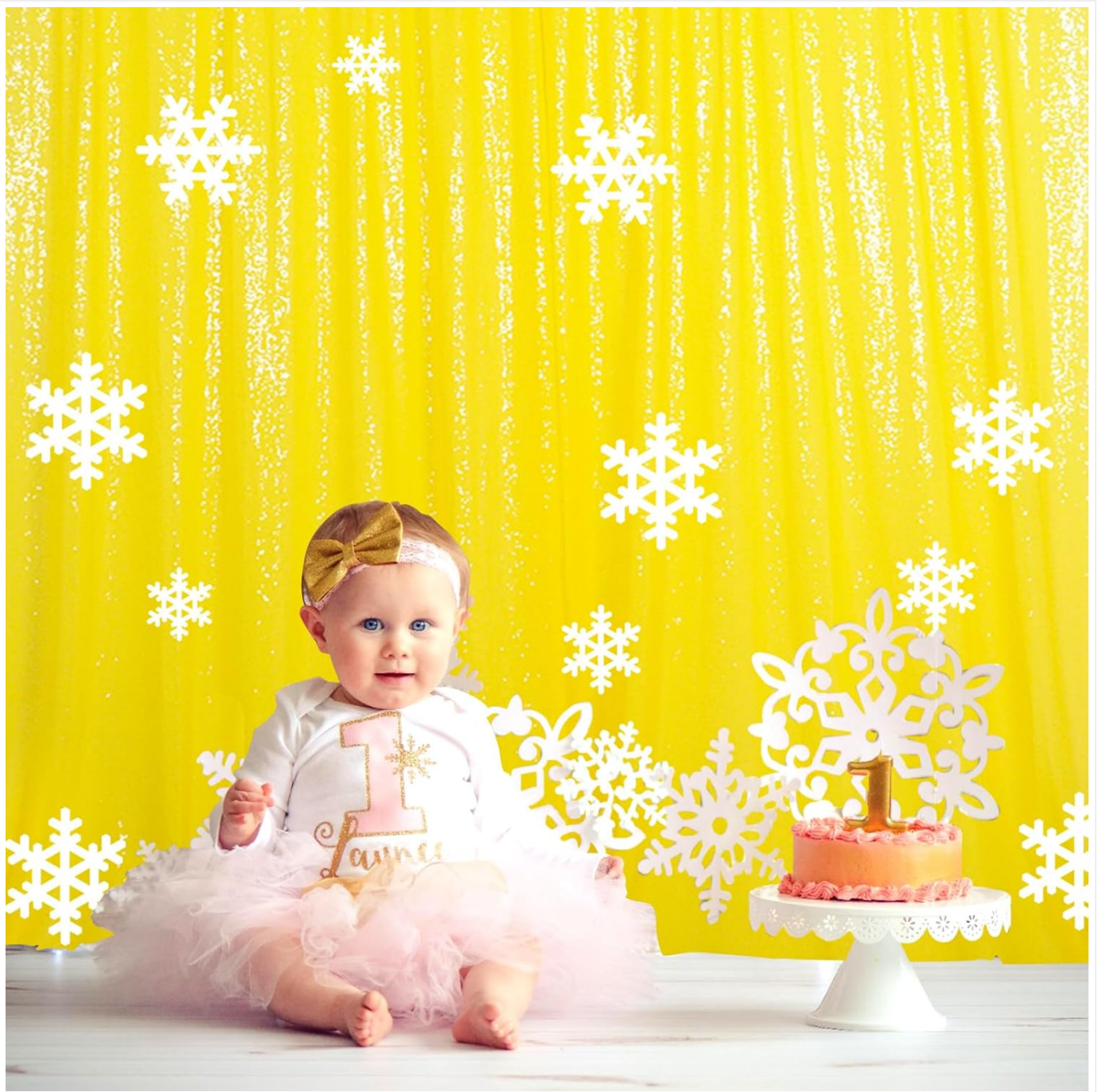
Figure 3: Examples of the yellow sequin backdrop in use, demonstrating its versatility for various event themes and photography.