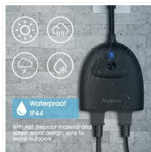
Image 3.3: Visual representation of the IP44 waterproof rating, indicating protection against various weather conditions including sun, rain, snow, and humidity.