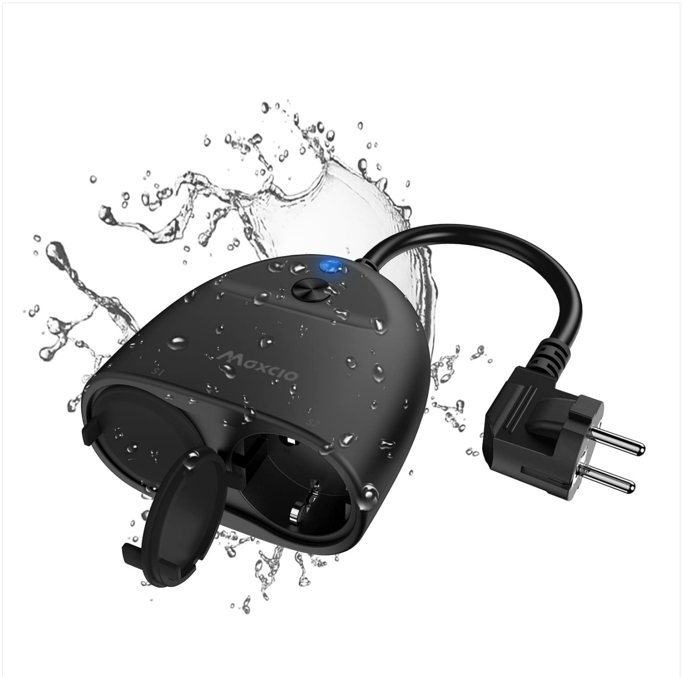
Image 3.2: The Maxcio Smart Outdoor Plug, depicted with water droplets, illustrating its IP44 splash-proof design for outdoor environments.