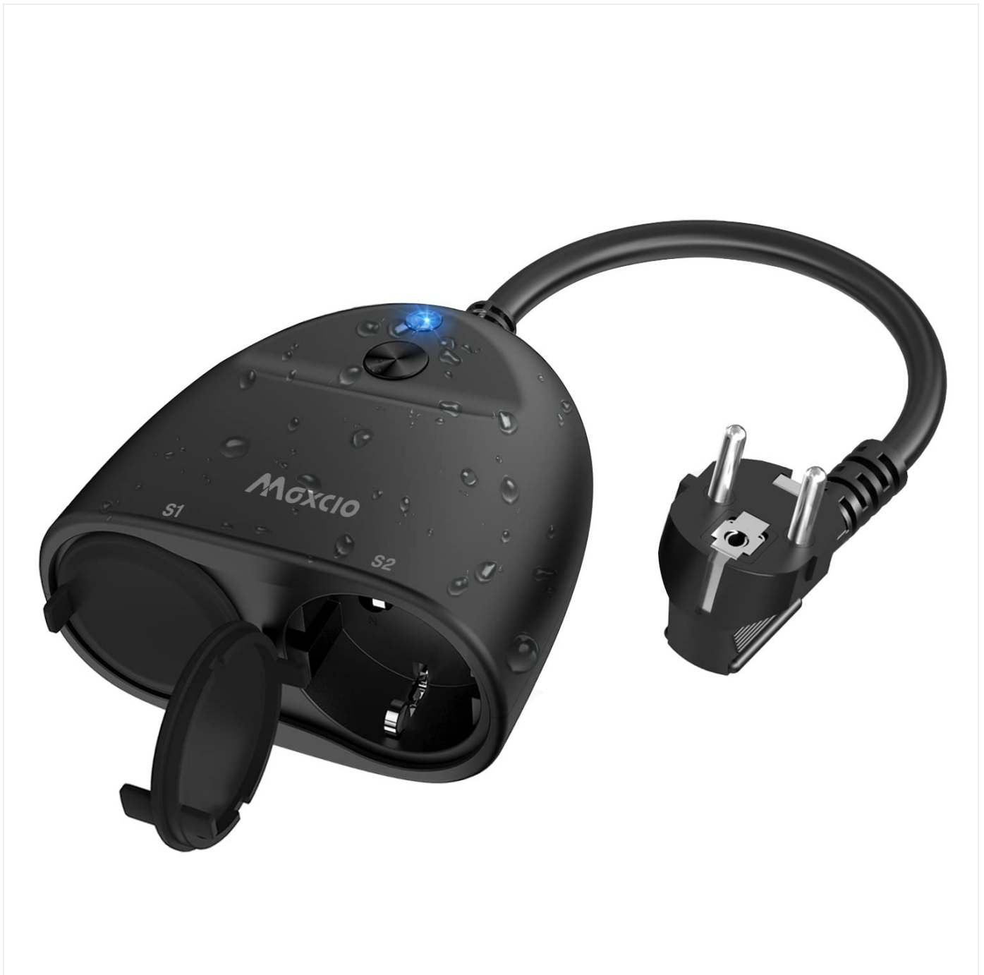
Image 3.1: The Maxcio 2-in-1 Smart Outdoor Plug, showcasing its two individually covered outlets and EU-type plug. This image highlights the compact design and robust construction suitable for outdoor use.