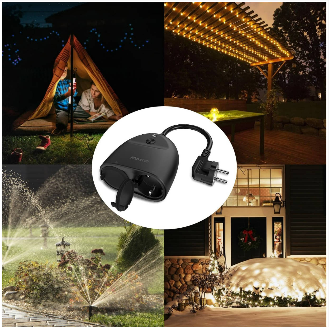
Image 6.1: A collage illustrating various outdoor applications for the Maxcio Smart Outdoor Plug, including camping lights, garden lighting, irrigation systems, and holiday decorations.