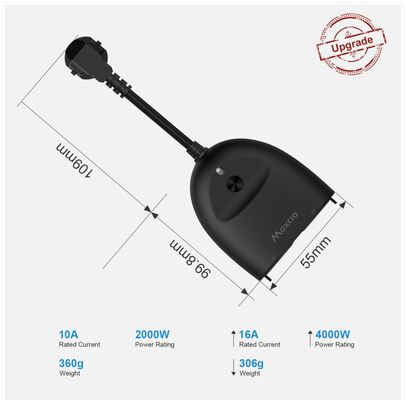
Image 4.1: Technical diagram displaying the dimensions (109mm length, 99.8mm width, 55mm height) and updated power ratings (16A rated current, 4000W power rating) of the Maxcio Smart Outdoor Plug.