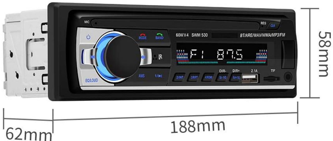
Figure 3: Dimensional drawing of the SWM-530 unit. This image illustrates the width (188mm), height (58mm), and approximate depth (62mm) of the car stereo for installation purposes.