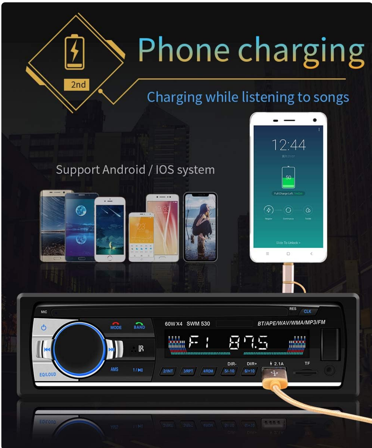
Figure 8: SWM-530's various input options. This image shows the USB, AUX (3.5mm Jack), and TF card inputs, illustrating the multiple ways to connect external audio sources.