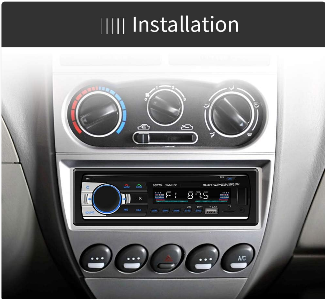
Figure 4: SWM-530 Car Stereo Player installed in a vehicle's dashboard. This image demonstrates the unit's appearance when properly mounted in a standard car stereo slot.