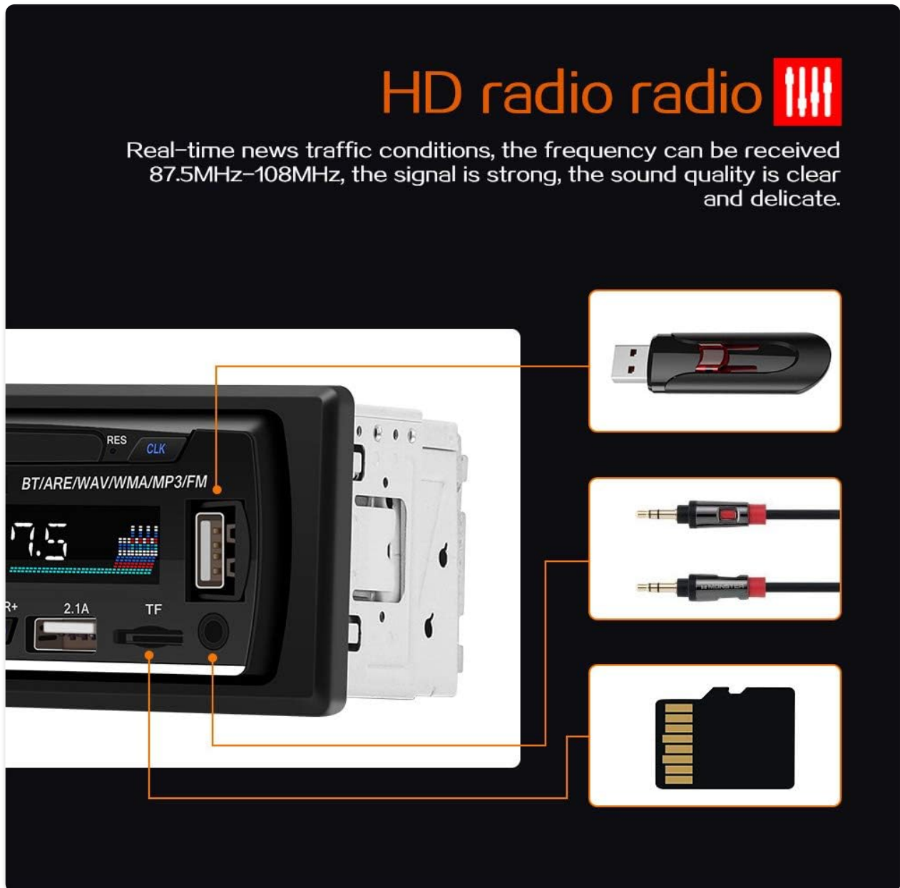
Figure 7: SWM-530's dual USB interface. This image highlights the two USB ports, one for U disk playback and the other primarily for phone charging, demonstrating the unit's versatility.