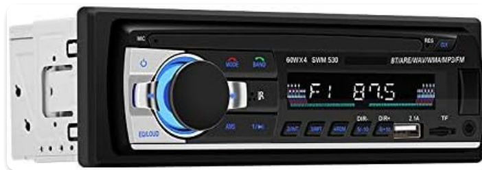
Figure 1: Front view of the SWM-530 Car Stereo Player. This image displays the main unit with its control knob, buttons, LCD screen, USB ports, and TF card slot.

Thank you for choosing the SWM-530 Car Stereo Player. This manual provides detailed instructions for the installation, operation, and maintenance of your new car audio system. Please read this manual thoroughly before use to ensure proper functionality and to maximize your listening experience.