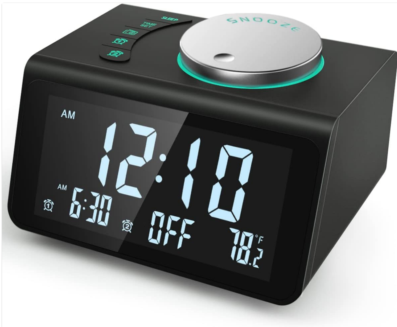
Figure 1: Front view of the ANJANK Small Alarm Clock Radio displaying time and temperature.