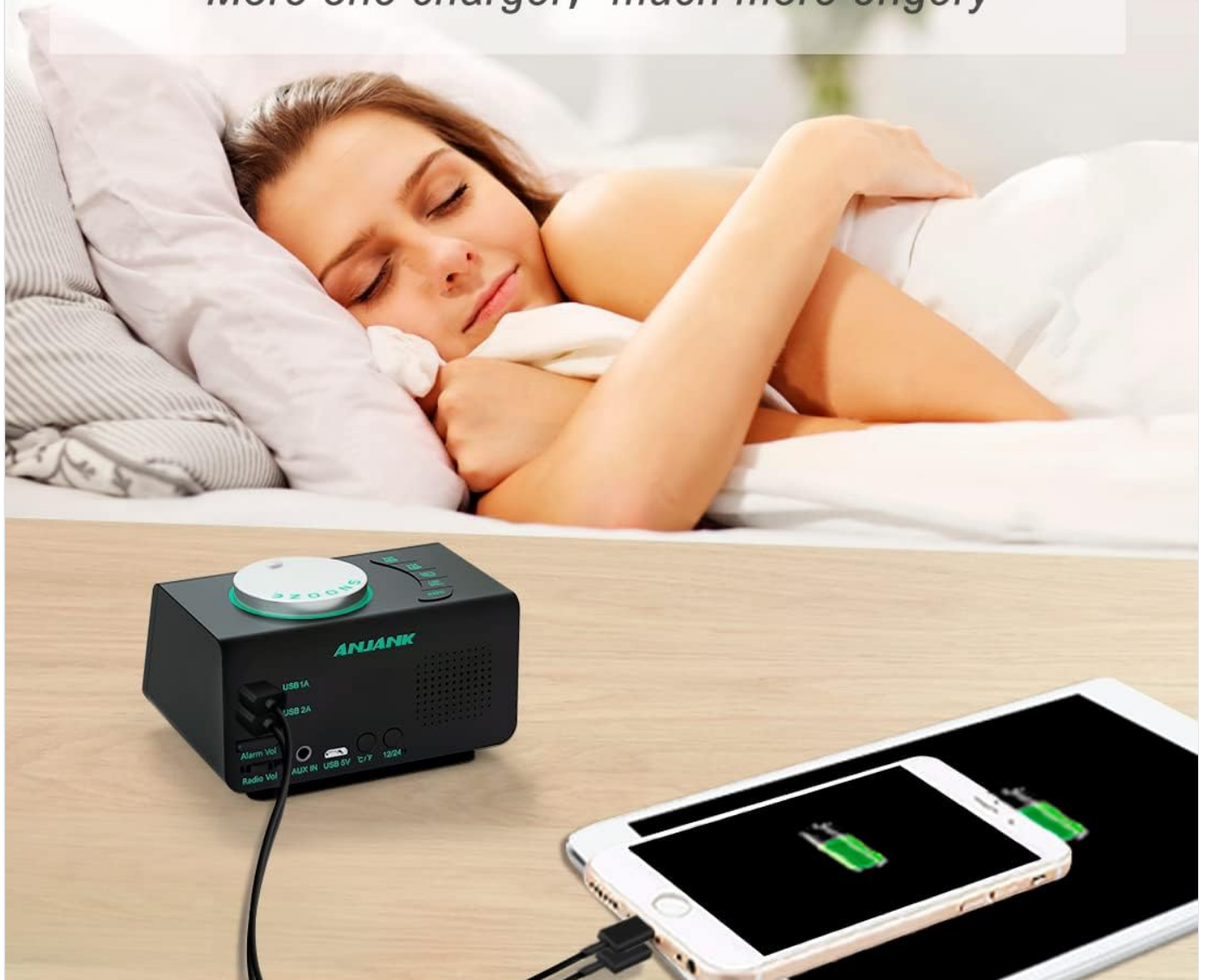
Figure 7: Dual USB charging ports in use.