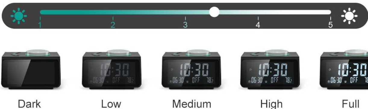
Figure 6: Adjustable brightness levels of the display.

Tap big knob to get your most comfortable brightness