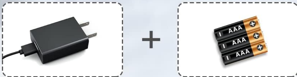
Figure 2: Powering options for the alarm clock, including AC adapter and AAA battery backup.