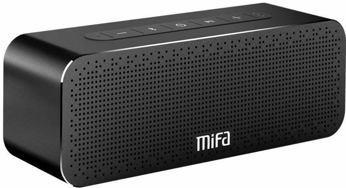
A sleek, black rectangular MIFA A20 Bluetooth speaker with a perforated grille on the front and top, showcasing its compact and modern design.