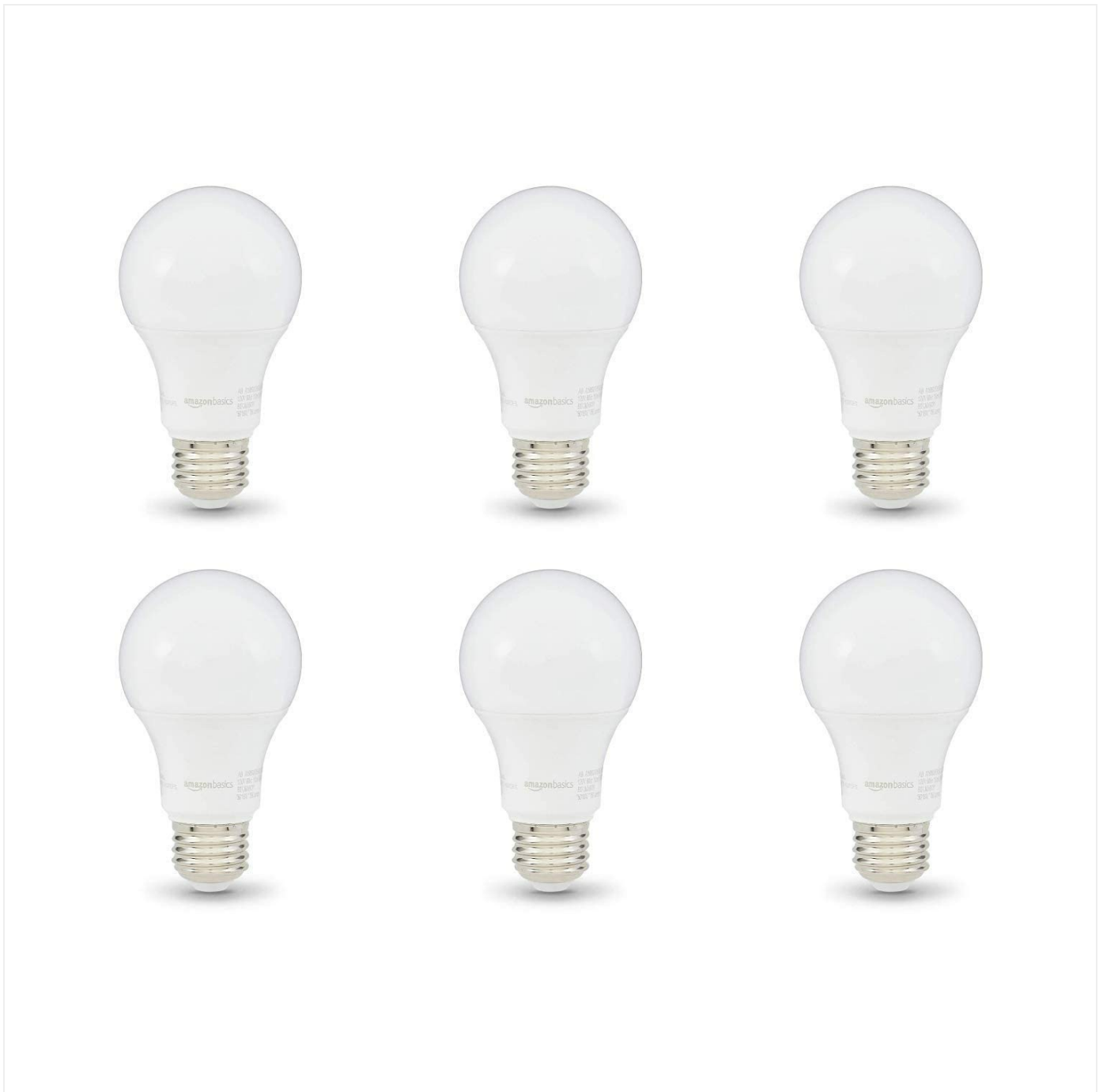
Image: A pack of Amazon Basics A19 LED Light Bulbs.