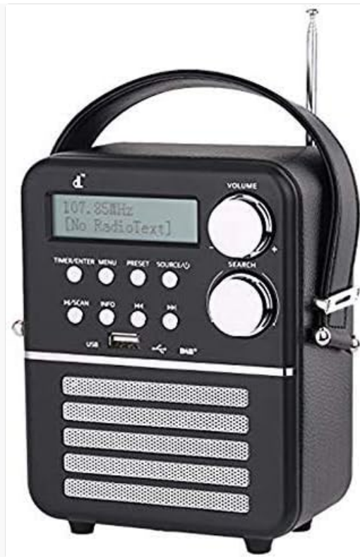
Figure 2: Front View with Controls