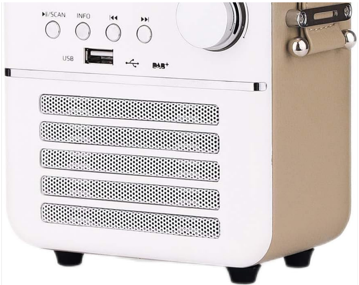
Figure 1: Front view of the Mini dI DAB and FM Digital Radio.