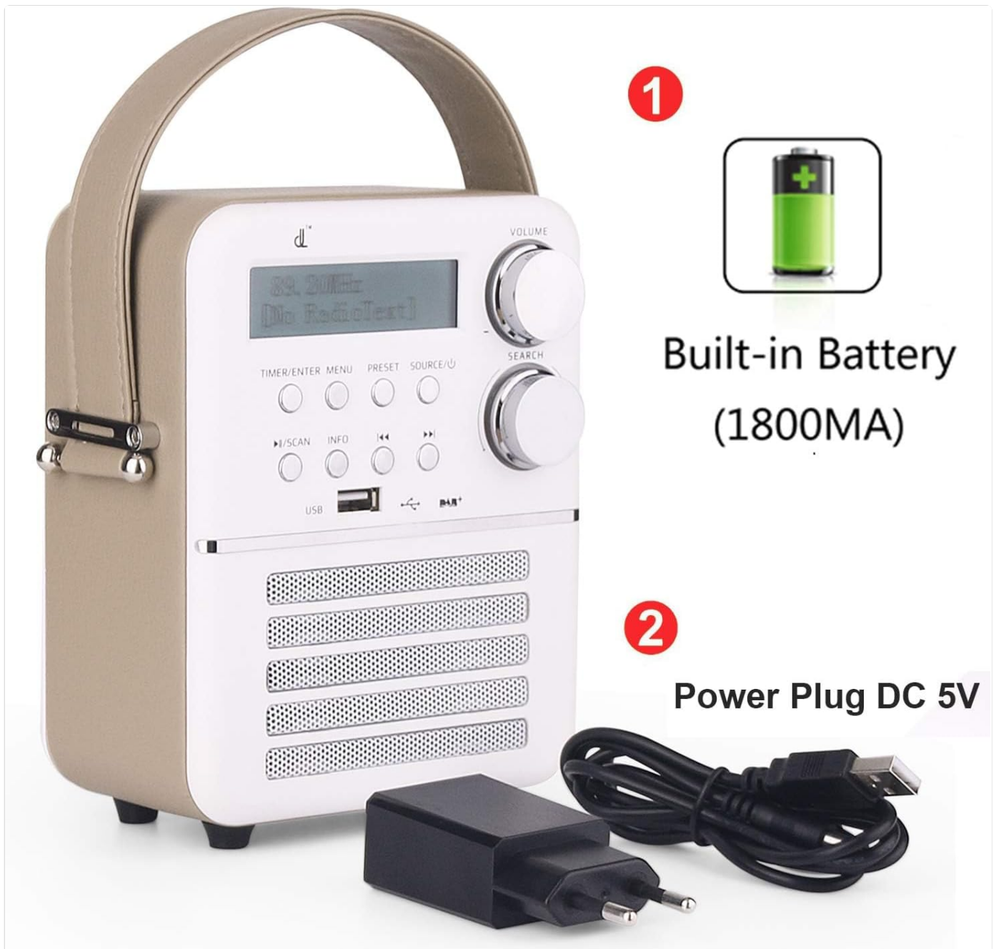
Figure 2: Included accessories: the radio unit, power adapter, and an indication of the built-in battery.