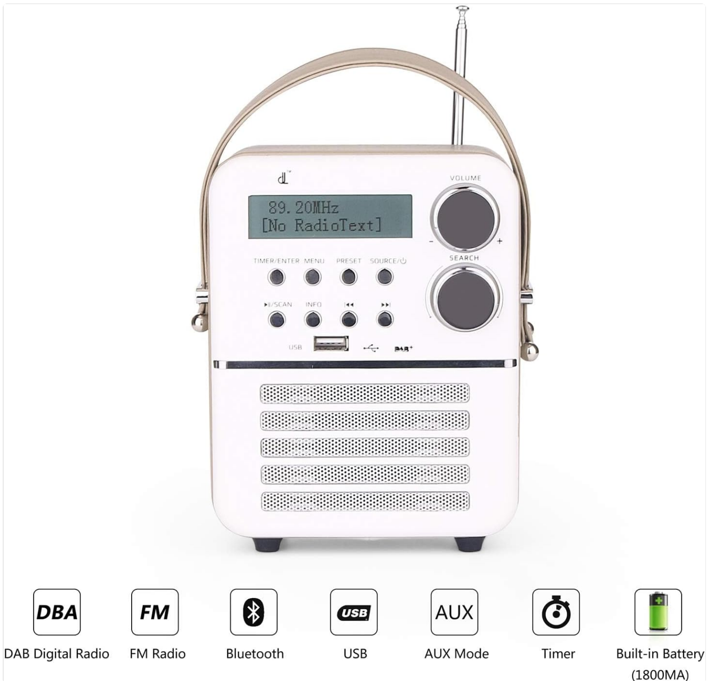
Figure 4: Front panel controls and display.