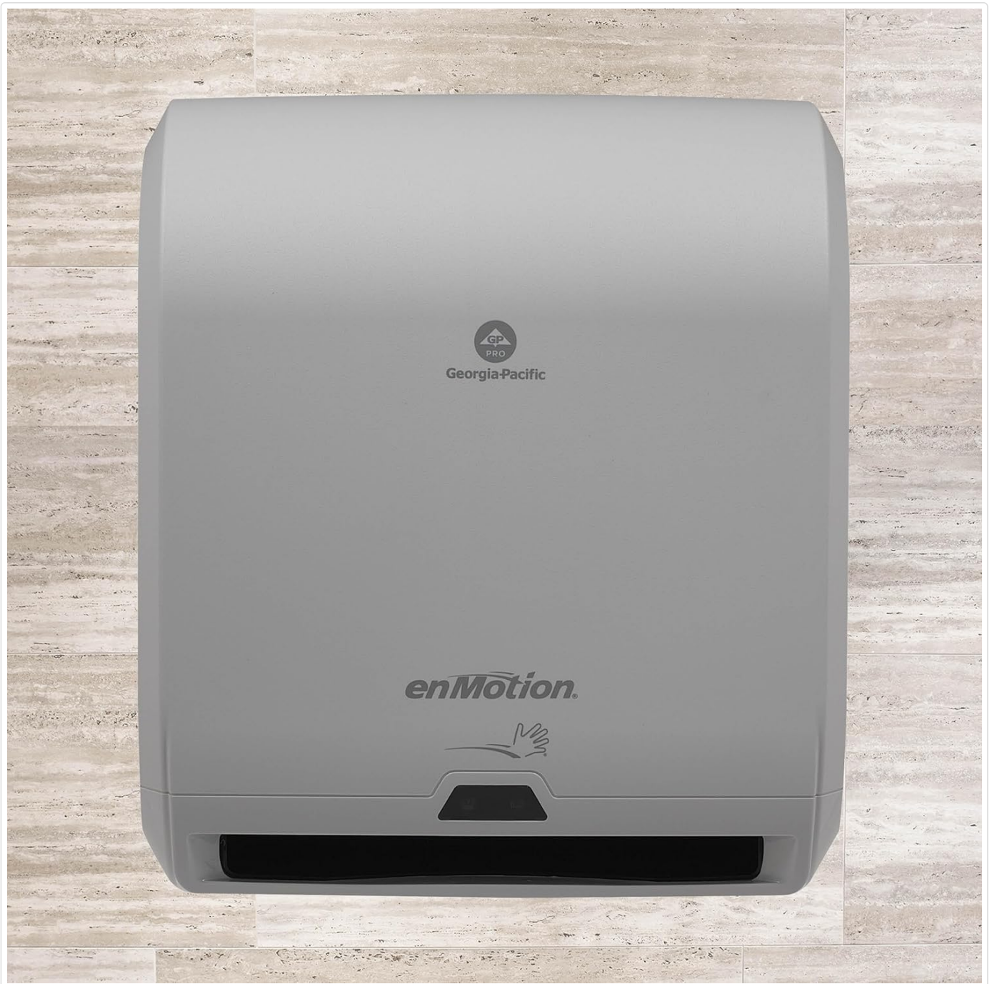
Figure 4: The enMotion dispenser securely mounted on a wall.