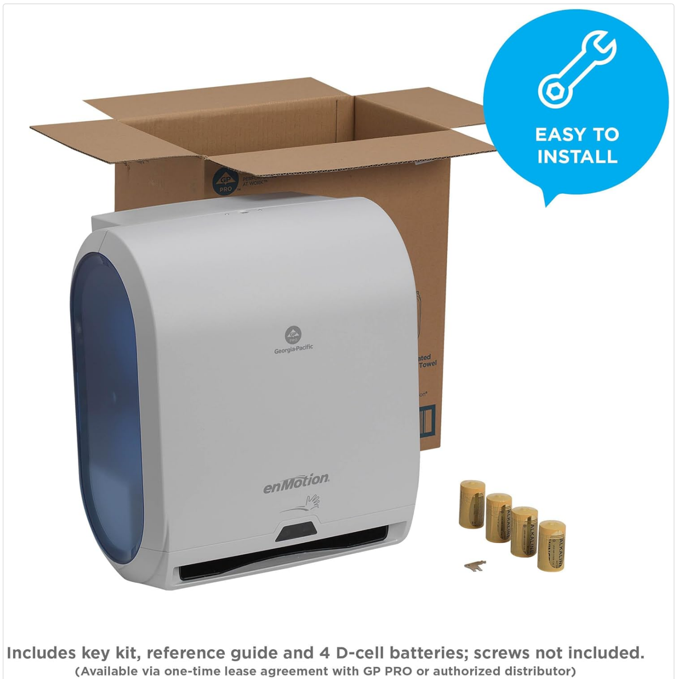
Figure 3: Included accessories: key kit, reference guide, and 4 D-cell batteries.