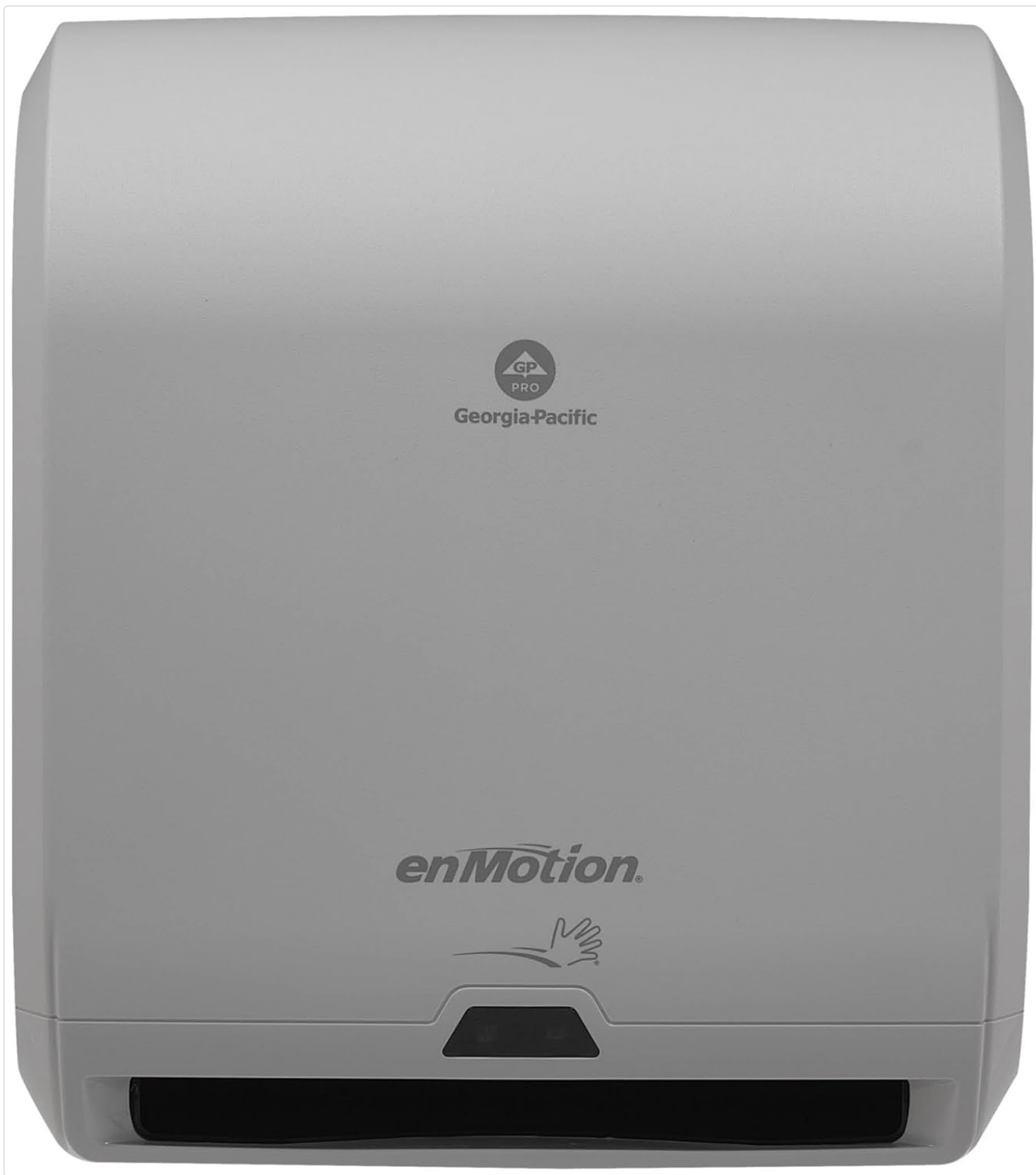
Figure 1: Front view of the enMotion 10" Automated Touchless Paper Towel Dispenser in Gray.