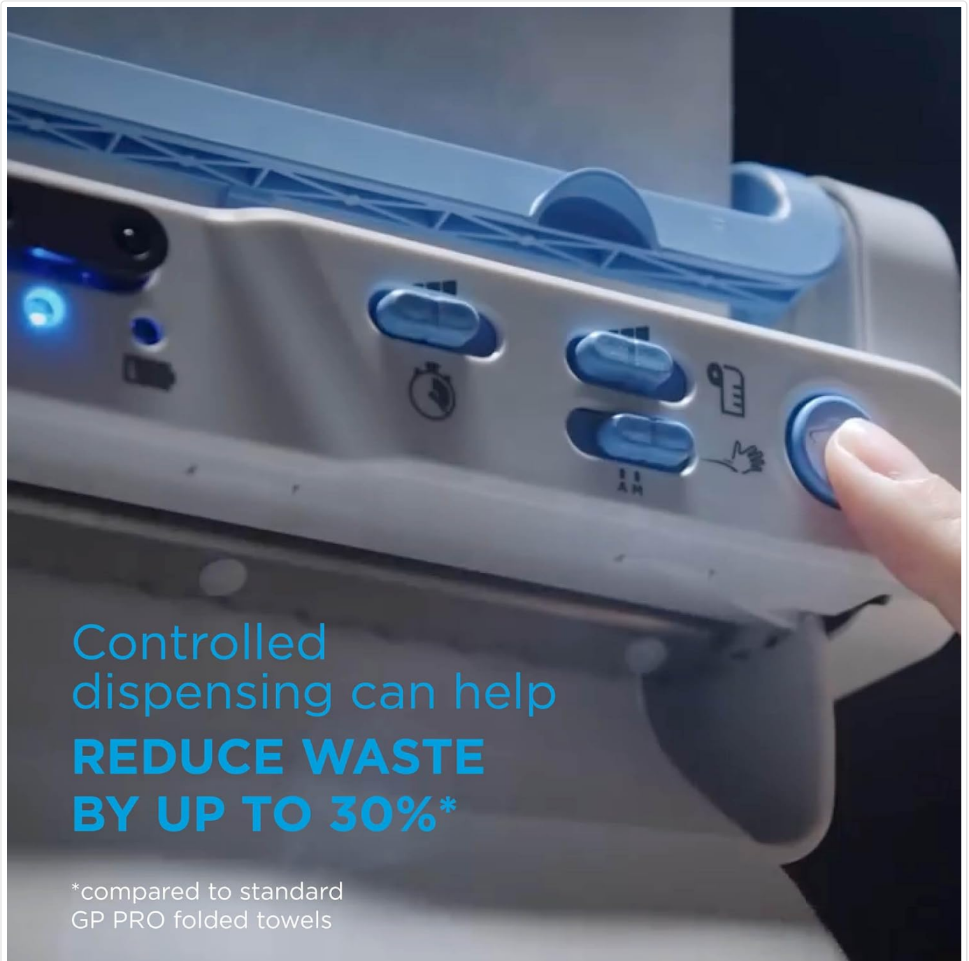
Figure 6: Internal control panel for adjusting dispenser settings.