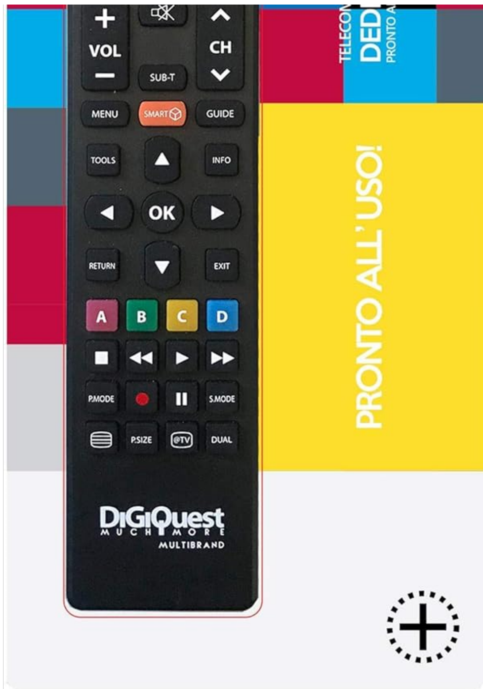
Image: The DIGIQUEST TLC128 Universal TV Remote Control shown in its retail packaging.