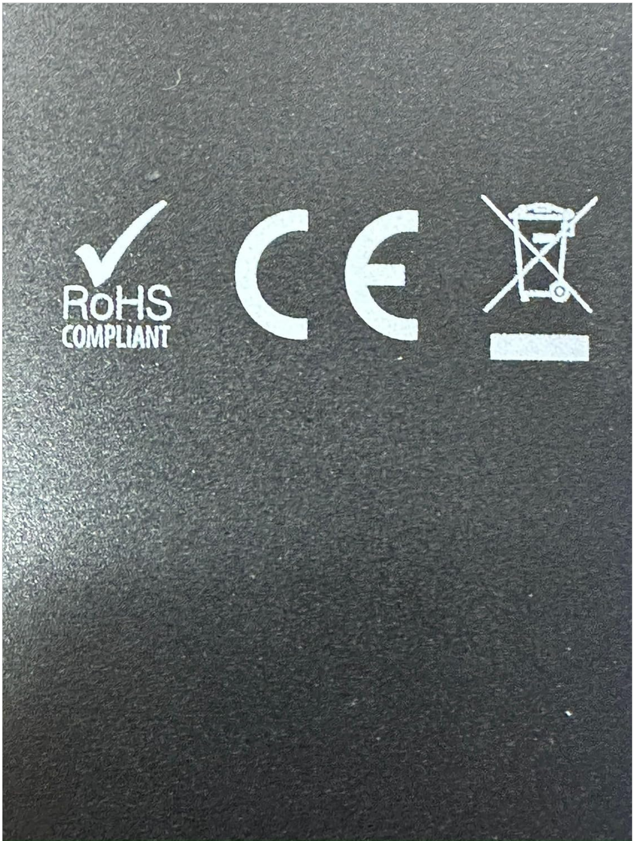
Image: Compliance markings (RoHS, CE, WEEE) indicating adherence to environmental and safety standards.