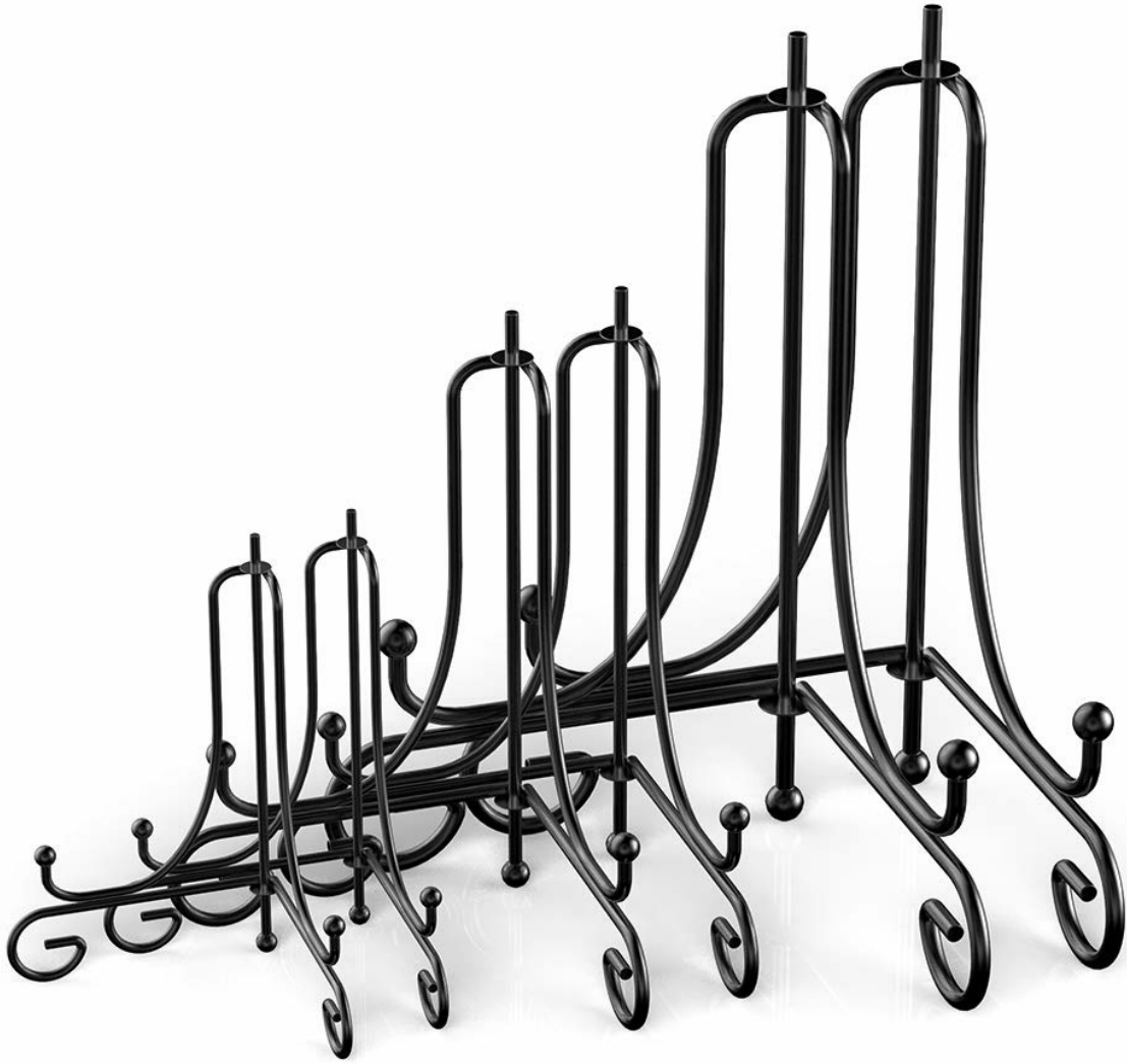
Image 1.1: Overview of the Sntieecr Iron Display Stands in three sizes.