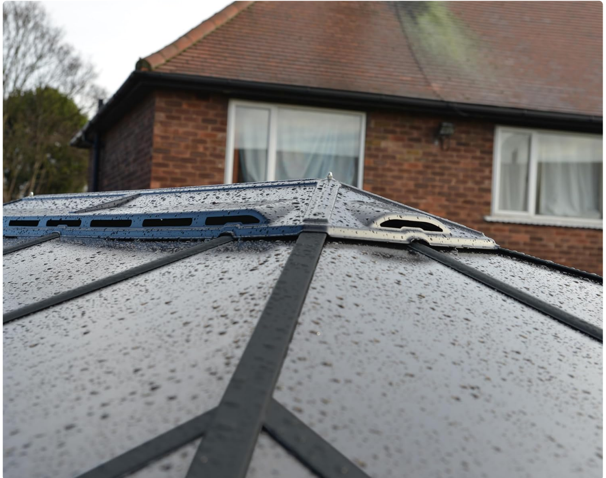
Detail of the polycarbonate roof panels, showing their water-resistant properties.