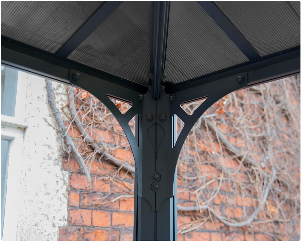
A close-up view of the sturdy aluminum frame and decorative joint work.