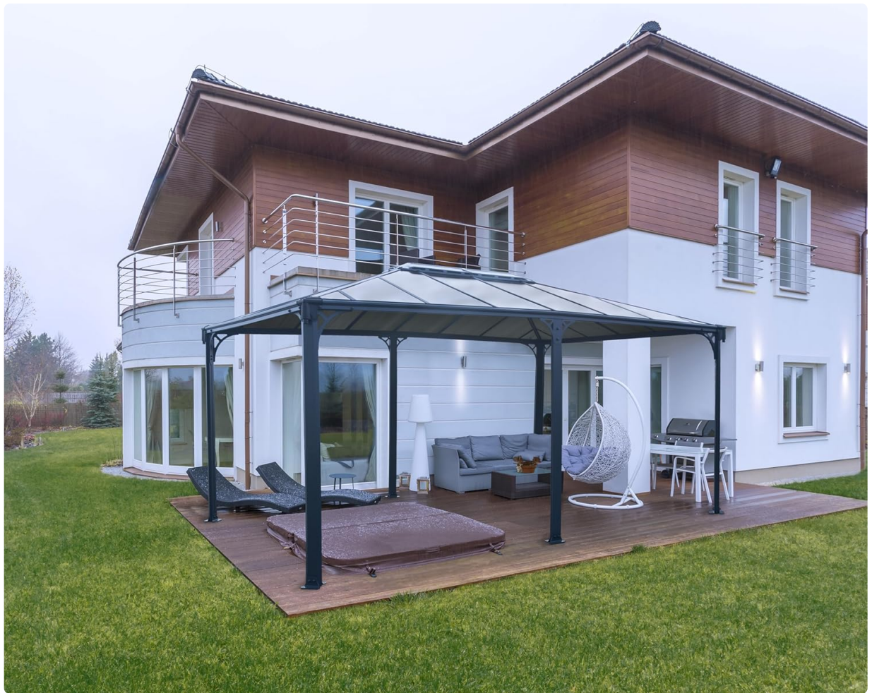
The gazebo seamlessly integrates into various outdoor environments, providing a comfortable shaded area.