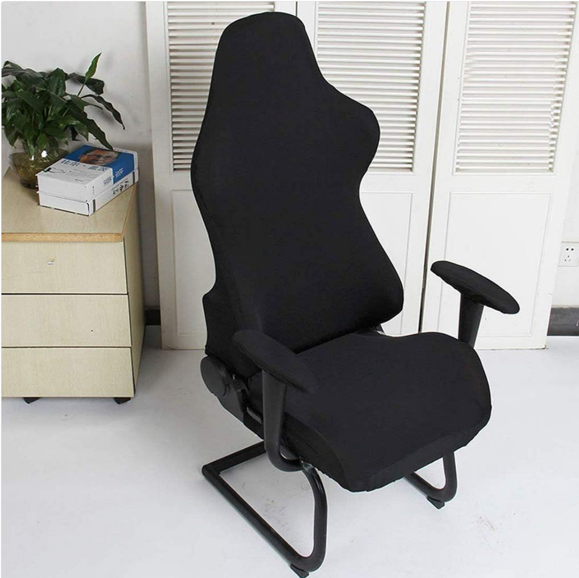
Image 7.1: A gaming chair fully covered with the slipcover, demonstrating its aesthetic integration into a room.

Once installed, the slipcovers provide a refreshed look and added protection to your chair. The stretchy fabric allows for normal chair adjustments, including reclining and swiveling, without hindrance.