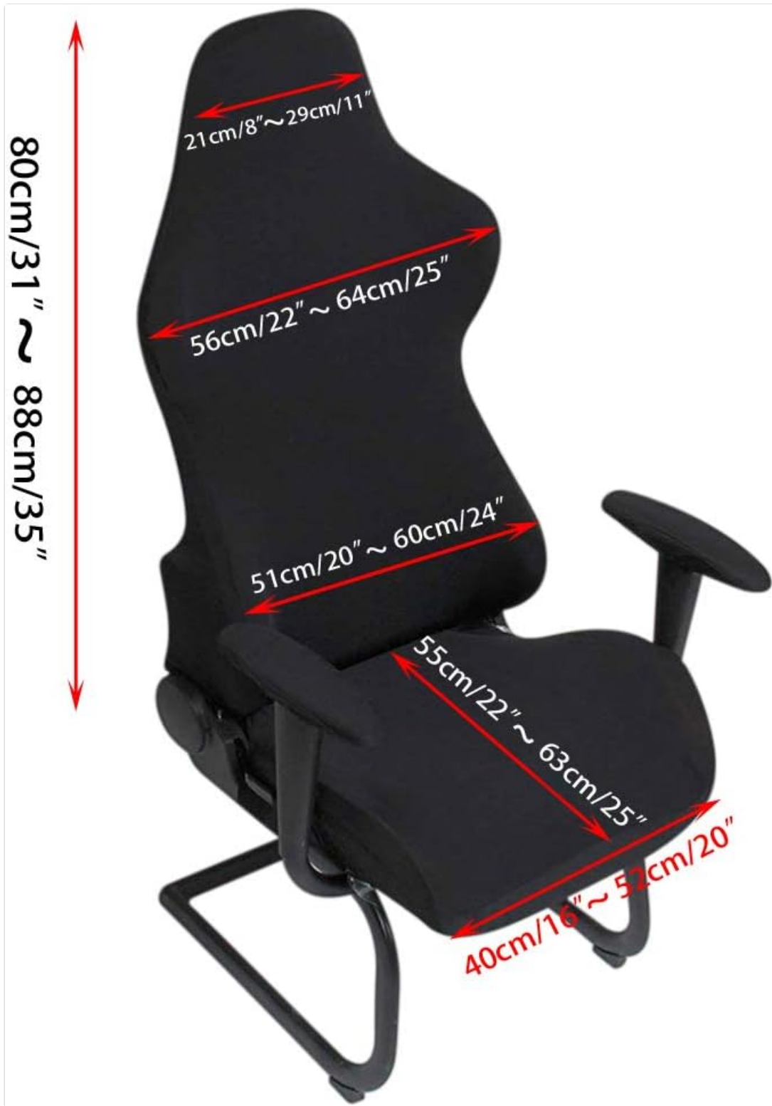
Image 5.1: Visual size guide with measurements for various parts of a gaming chair to ensure compatibility with the slipcover.

These slipcovers are suitable for computer chairs, armchairs, swivel chairs, gaming chairs, and computer boss chairs. They are not suitable for chairs where the arms are attached to the backrest.