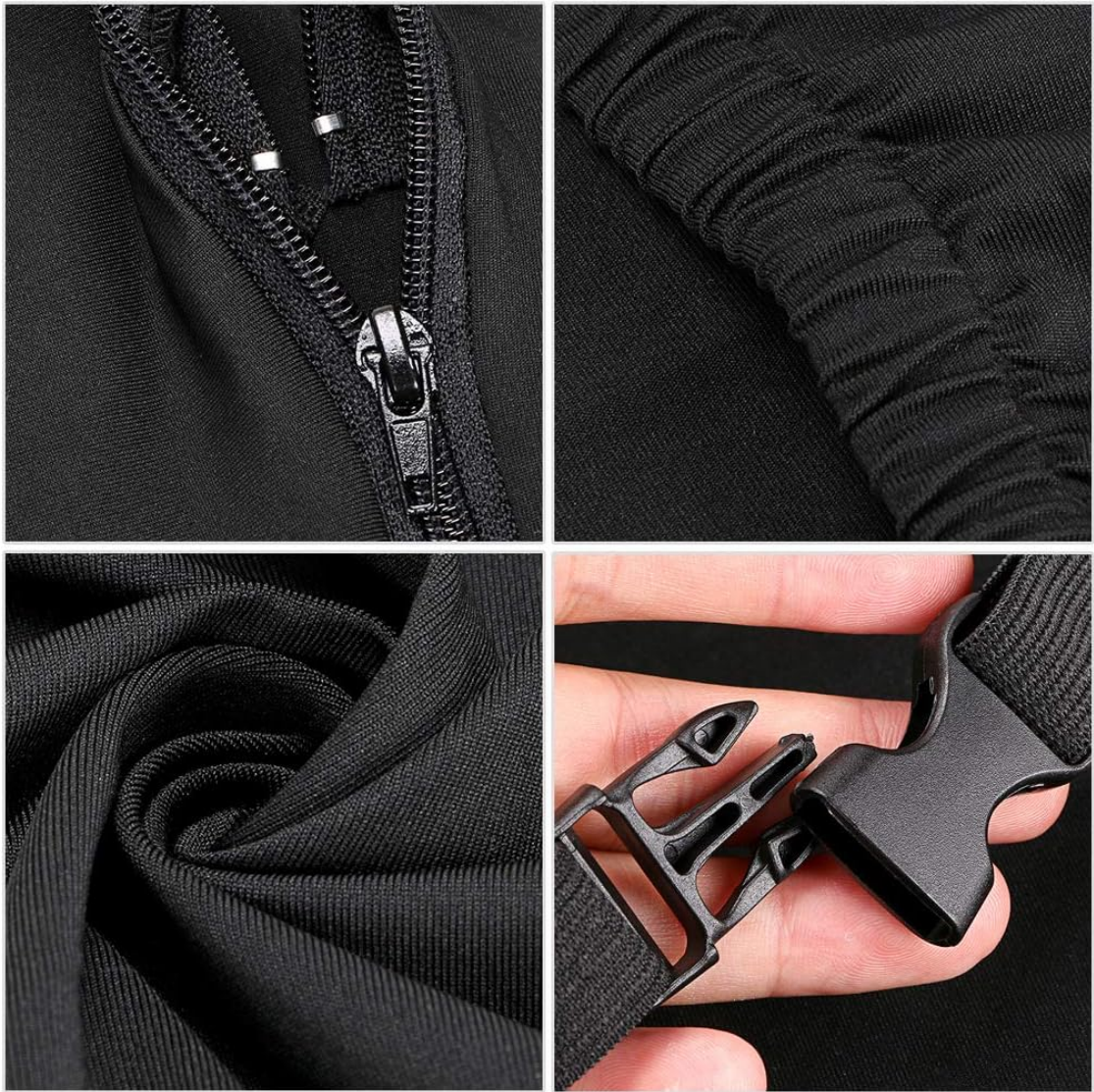
Image 4.1: Detailed view of the slipcover's smooth zipper, high elasticity, soft fabric, and convenient buckle for secure fitting.