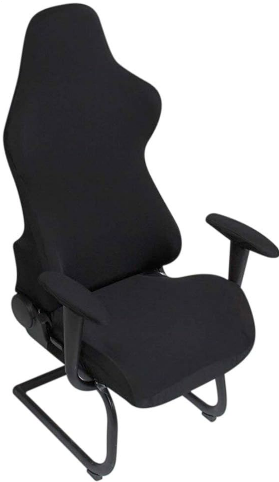
Image 1.1: BTSKY Ergonomic Office Computer Game Chair Slipcover in black, installed on a gaming chair.