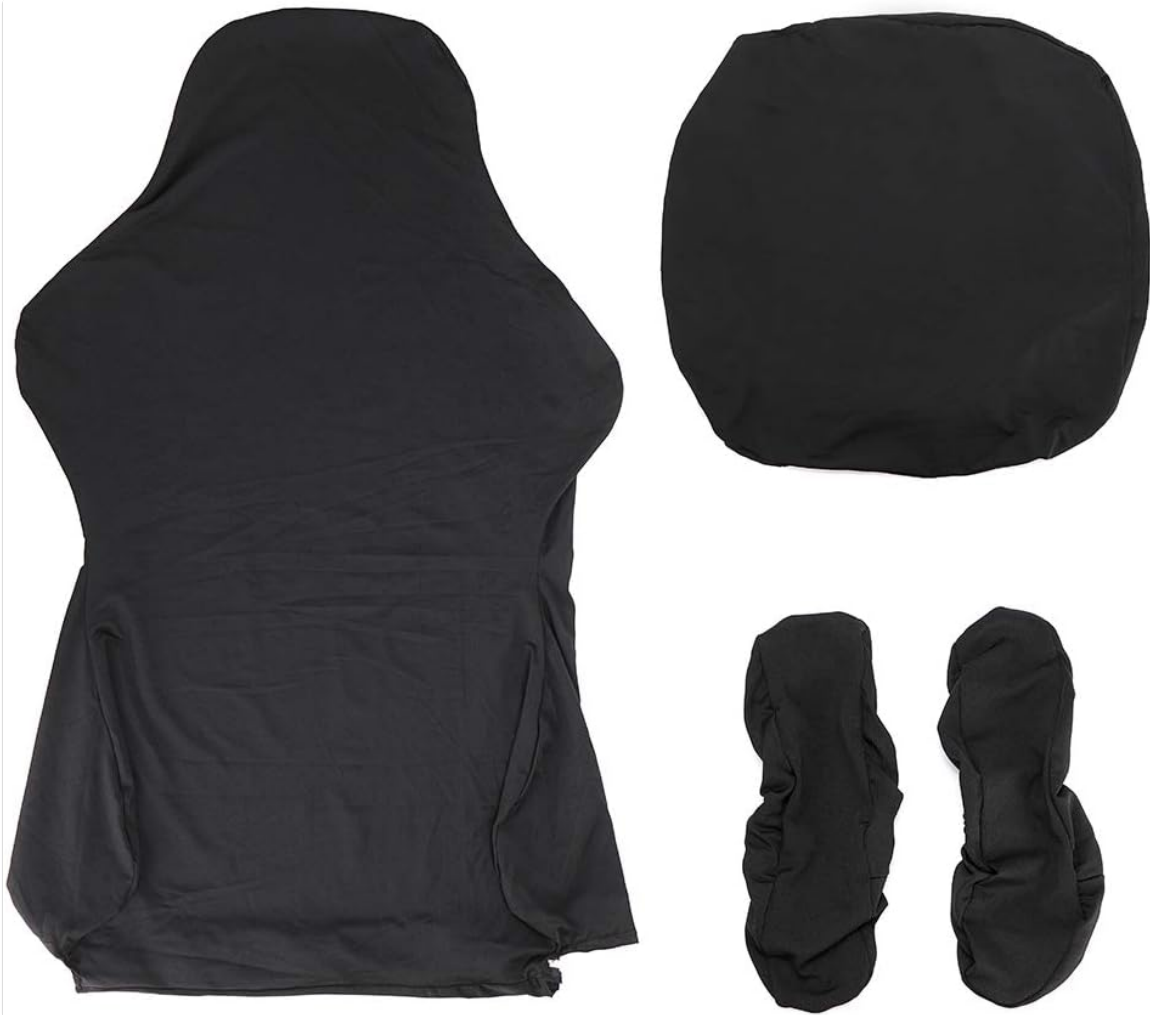
Image 3.1: The complete set of slipcover components, including the backrest cover, seat cover, and two armrest covers.