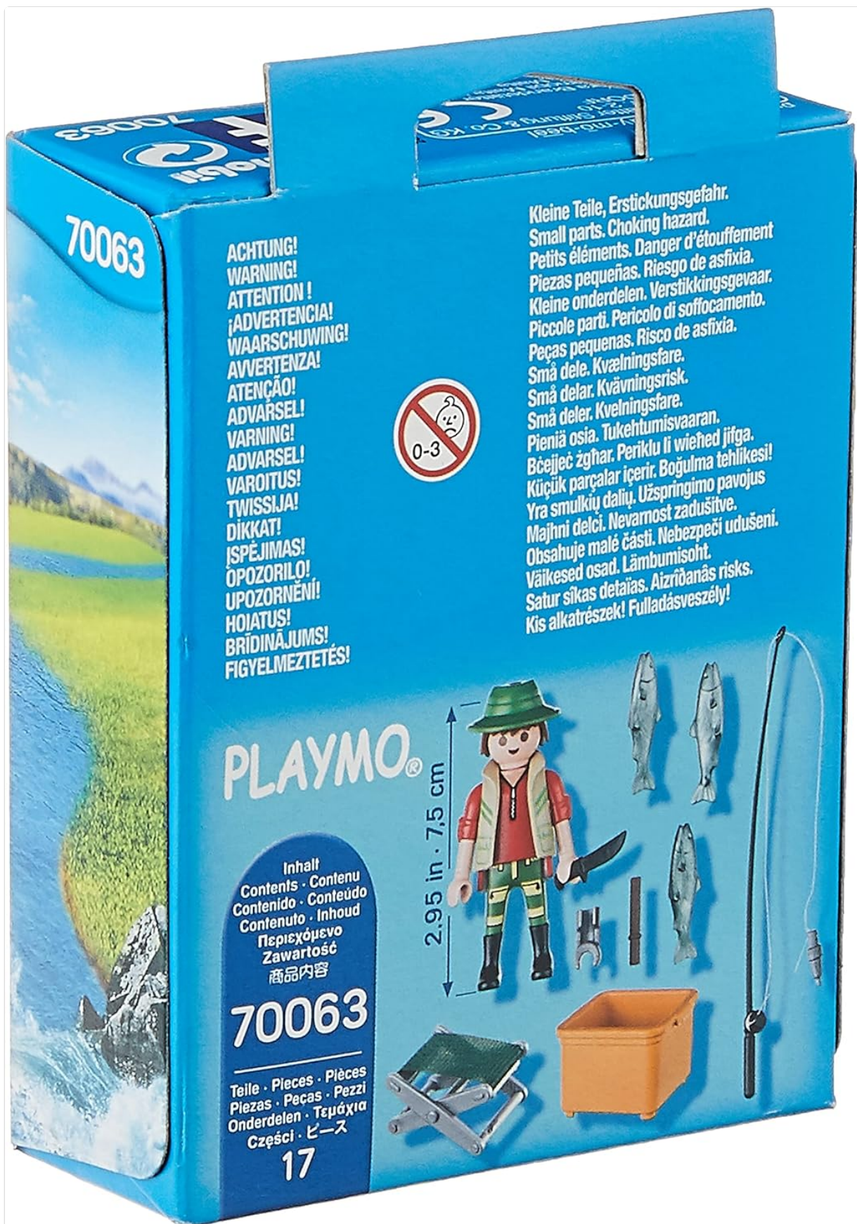
Image: Back view of the Playmobil 70063 Special Plus Fisherman packaging, detailing contents and safety information in multiple languages.