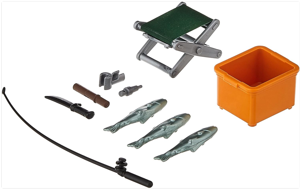
Image: All components included in the Playmobil 70063 Special Plus Fisherman playset, laid out for inspection.