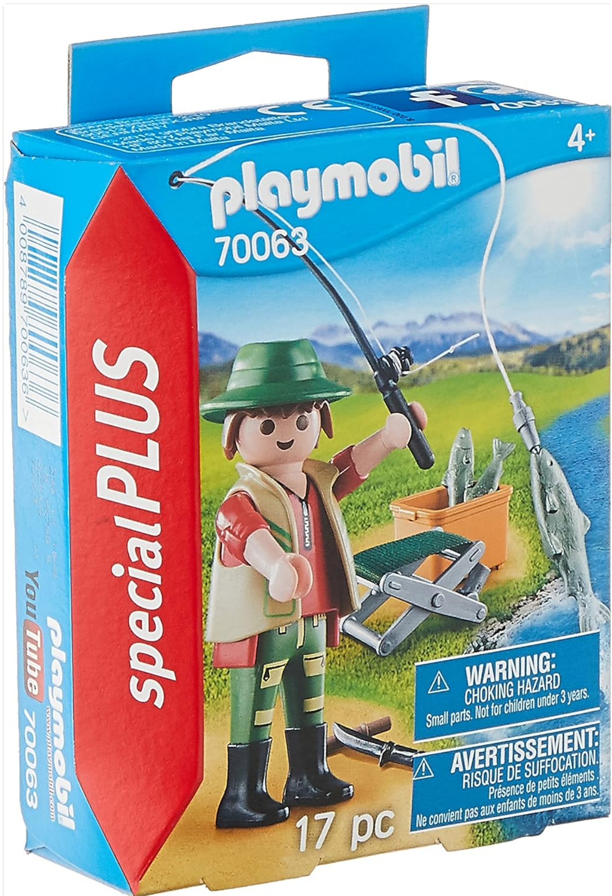
Image: Front view of the Playmobil 70063 Special Plus Fisherman packaging, showing the assembled figure and accessories.