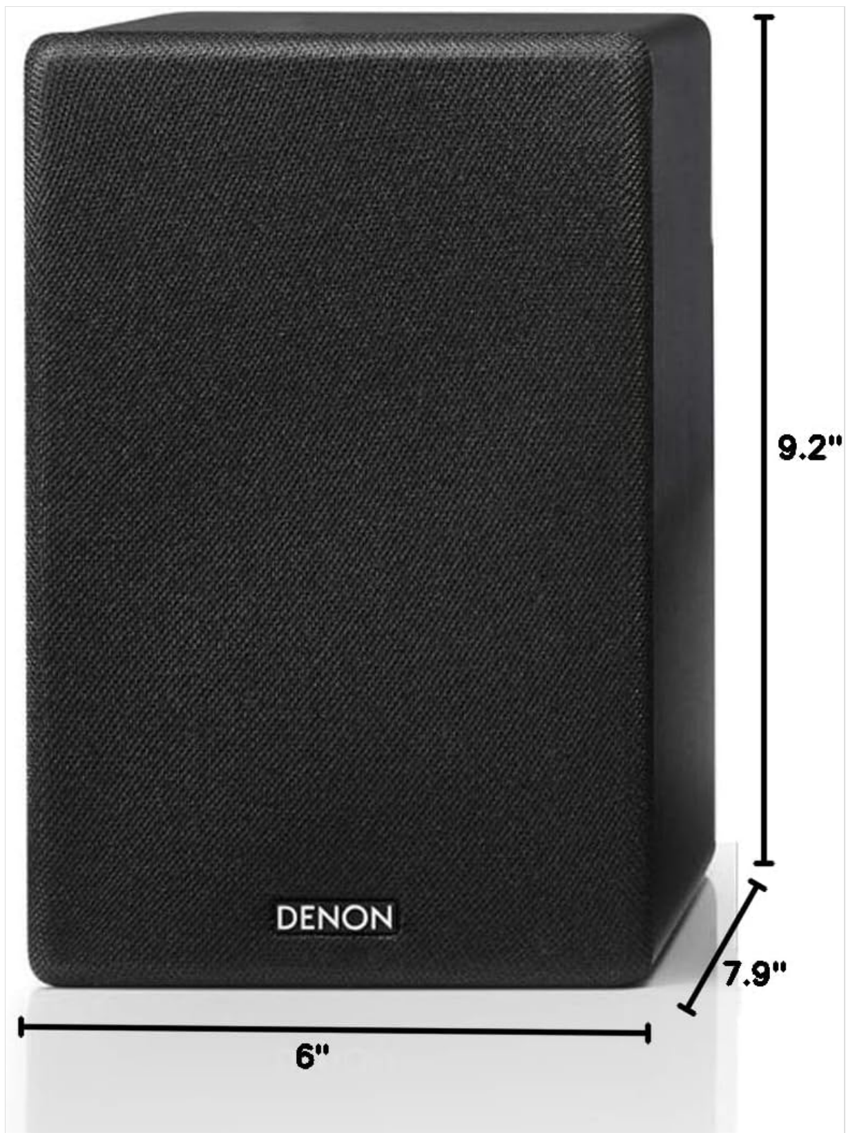
Figure 1: Denon SC-N10 Bookshelf Speaker with labeled dimensions. The speaker measures 6 inches wide, 9.2 inches high, and 7.9 inches deep.