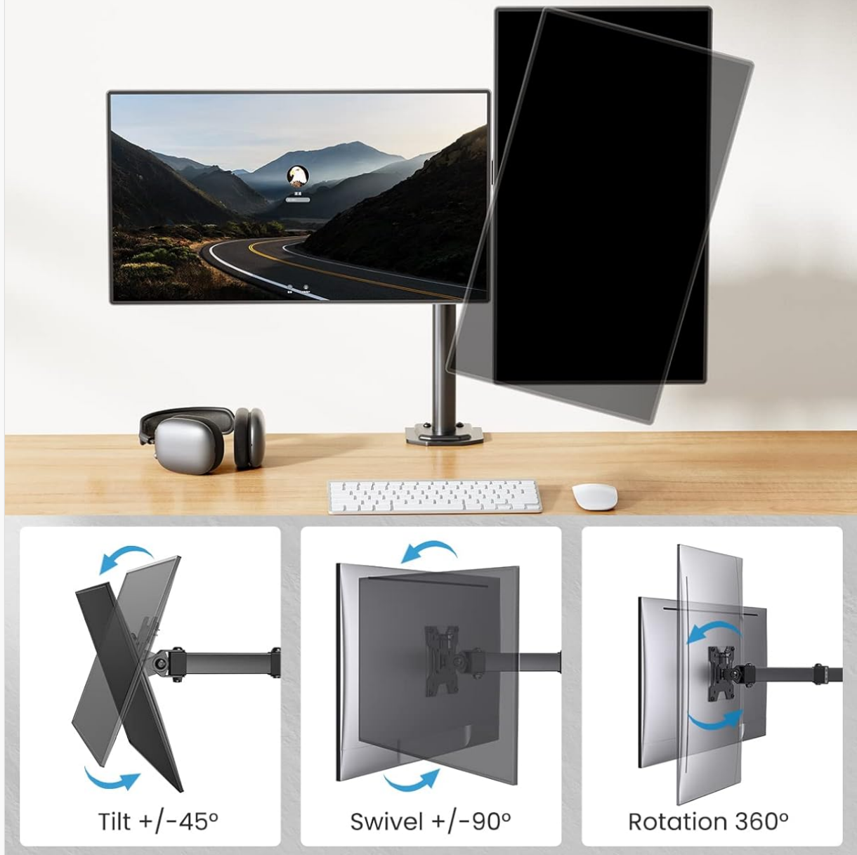
Figure 4: Demonstrating the tilt, swivel, and rotation capabilities of the monitor mount.

Tilt, swivel, and rotate to customize your angle