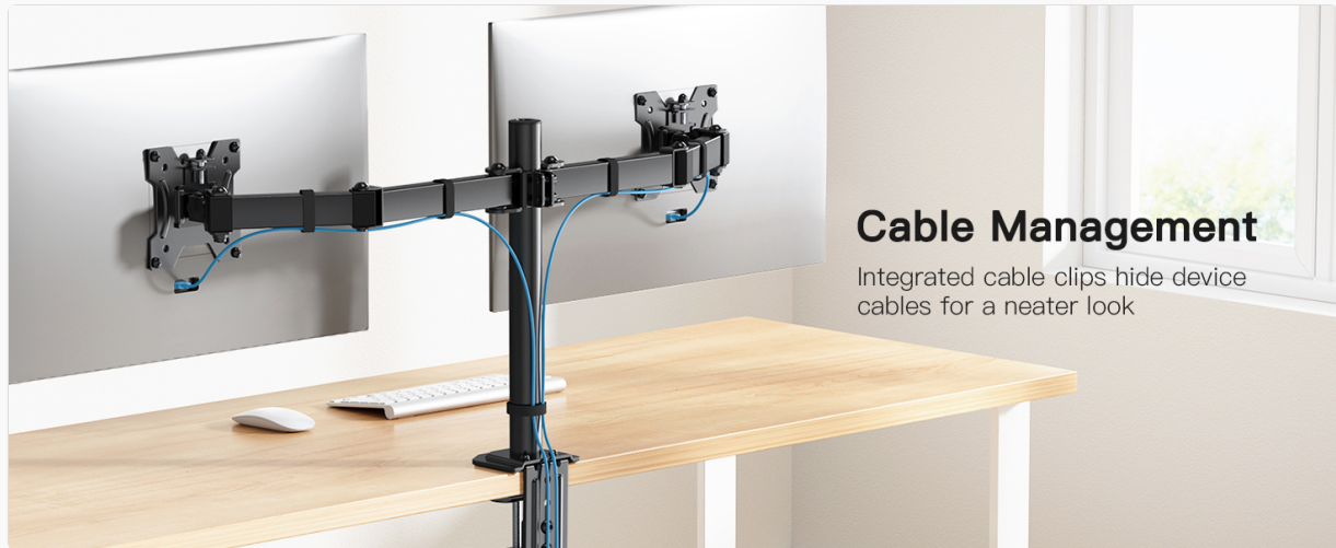
Figure 5: Achieving ergonomic viewing comfort with adjustable monitor positioning.

Adjust the tightness of the joints using the provided Allen wrenches to achieve the desired resistance for movement. This prevents monitors from sagging or moving too freely.