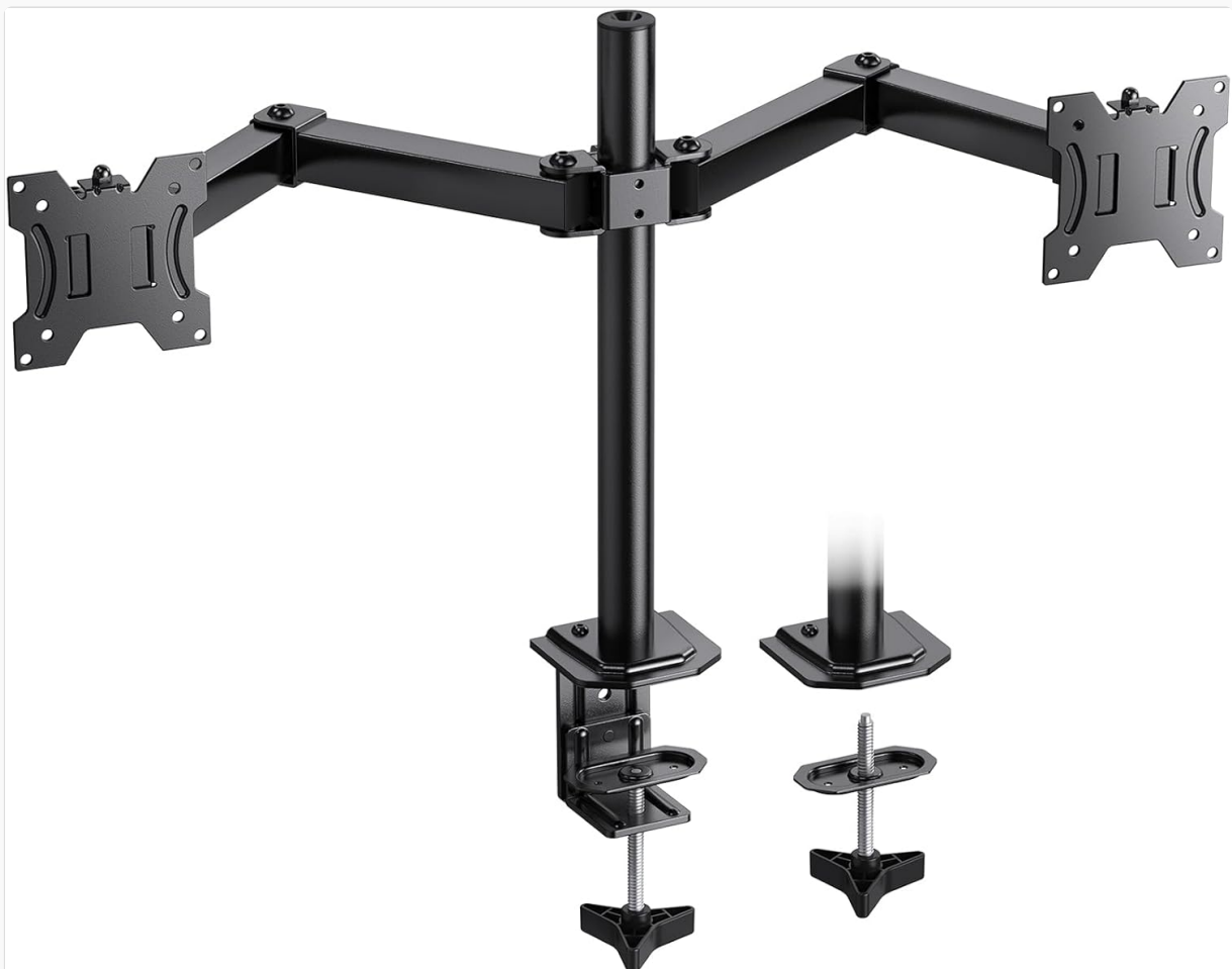
Figure 1: Overview of HUANUO HNCM7 Dual Monitor Mount components.

This manual provides detailed instructions for the assembly, operation, and maintenance of your HUANUO HNCM7 Dual Monitor Mount. Designed for monitors up to 30 inches and weighing up to 22 lbs per arm, this mount offers flexible adjustment and helps optimize your workspace. Please read these instructions carefully before installation and retain for future reference.