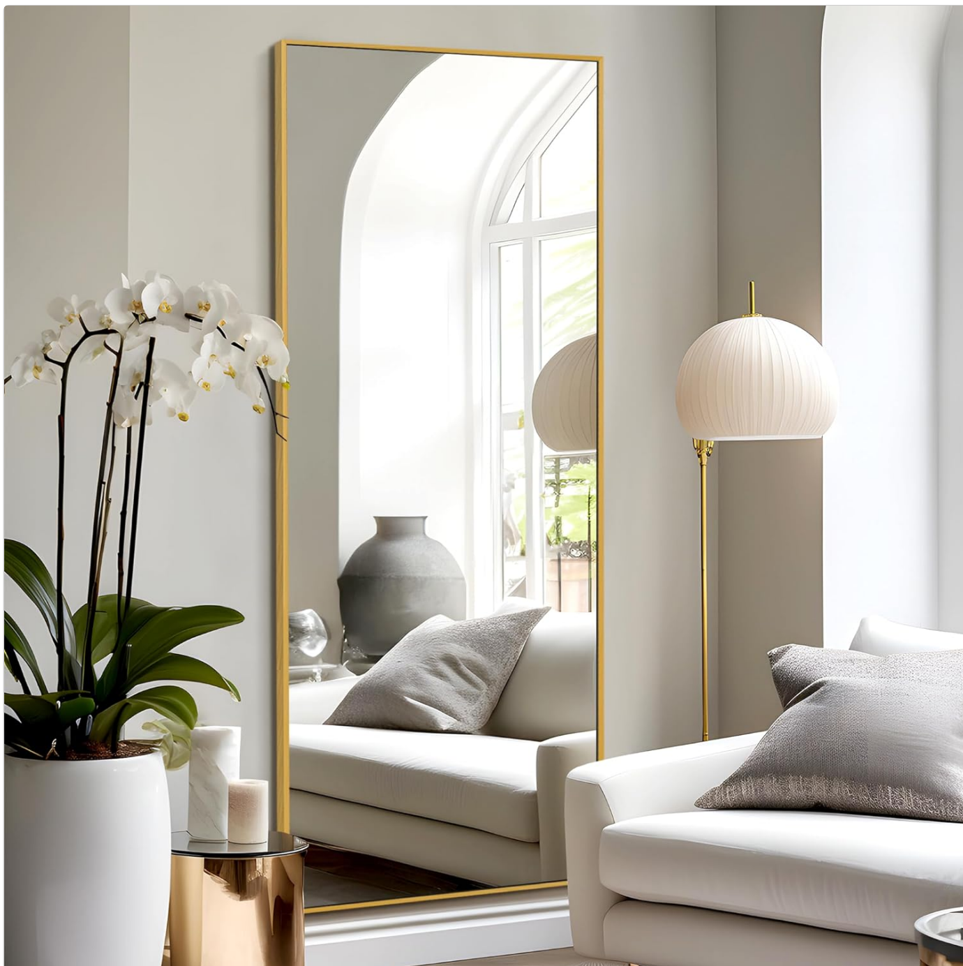
Figure 6: The mirror's surface is designed for easy cleaning, resisting water spots.