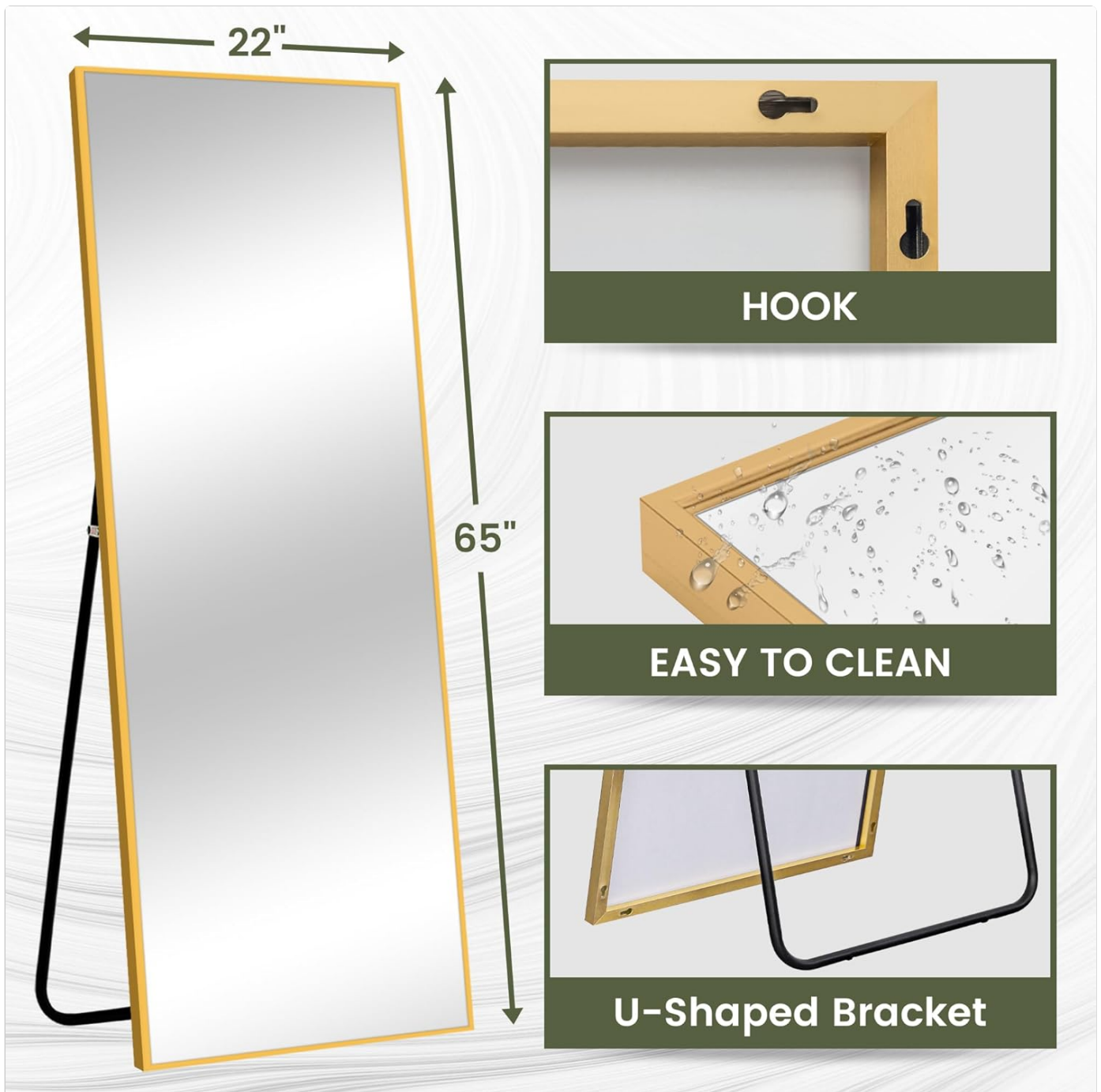
Figure 4: Detail of the gourd hooks on the back of the mirror for wall mounting.

Your browser does not support the video tag.