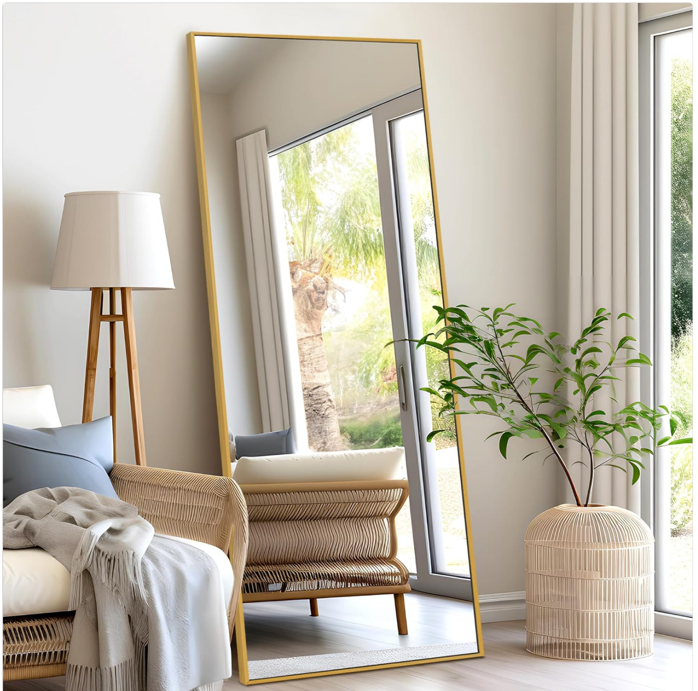
Figure 3: Mirror leaning against a wall, showcasing its full length and thin frame design.