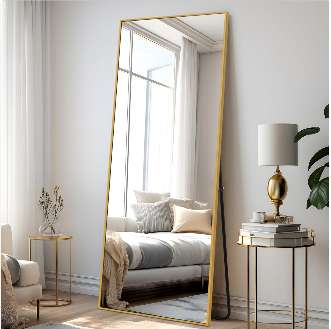
Figure 1: Mirror used in free-standing mode with its integrated U-shaped bracket.

The mirror comes with a pre-attached U-shaped bracket stand. Simply unfold the stand to the desired angle and place the mirror on a flat, stable surface. Ensure the stand is fully extended and locked into position for maximum stability.