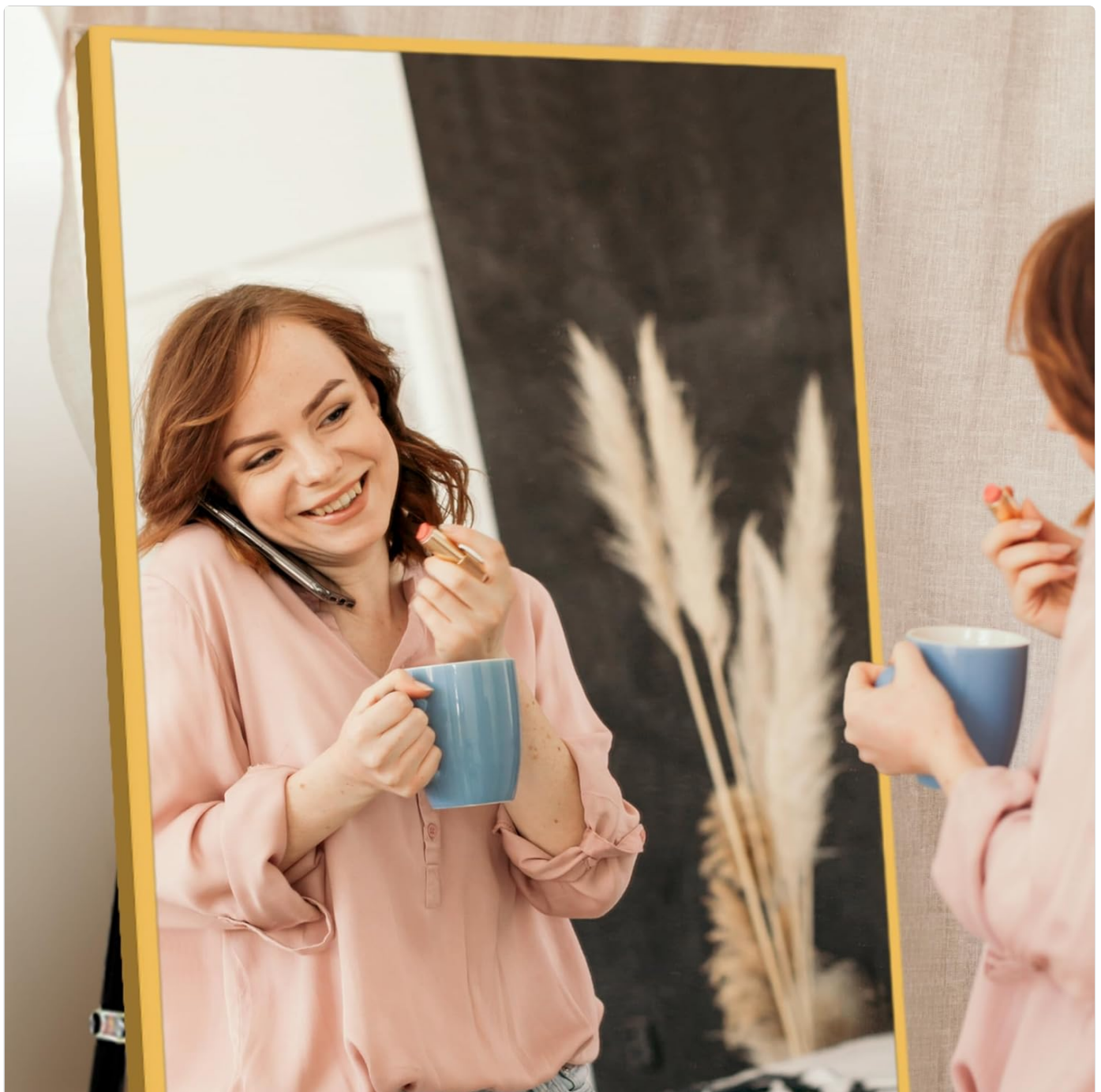
Figure 5: Mirror in use, demonstrating its utility for daily routines.