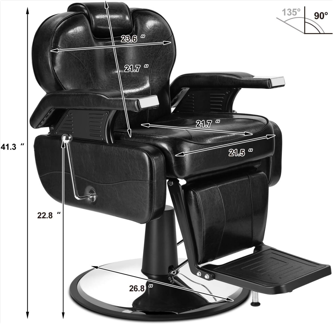
Image 8.2: This image highlights the 27-inch chrome base and the maximum load weight capacity of 450 pounds, emphasizing the chair's stability and heavy-duty construction.