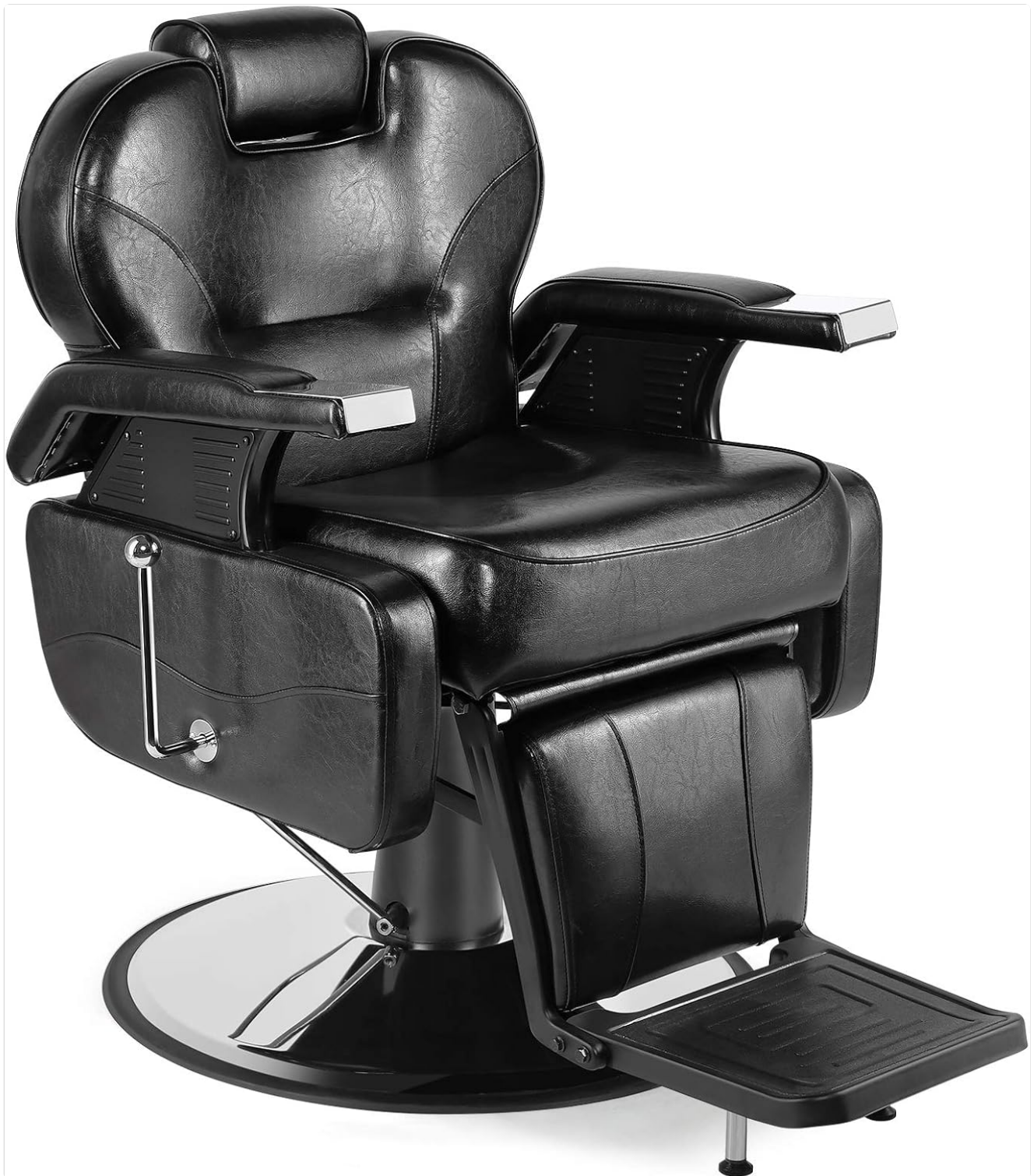
Image 1.1: The Artist hand Hydraulic Recline Barber Chair in black faux leather, featuring a sturdy chrome base and adjustable components. This image provides a general overview of the product's design and appearance.