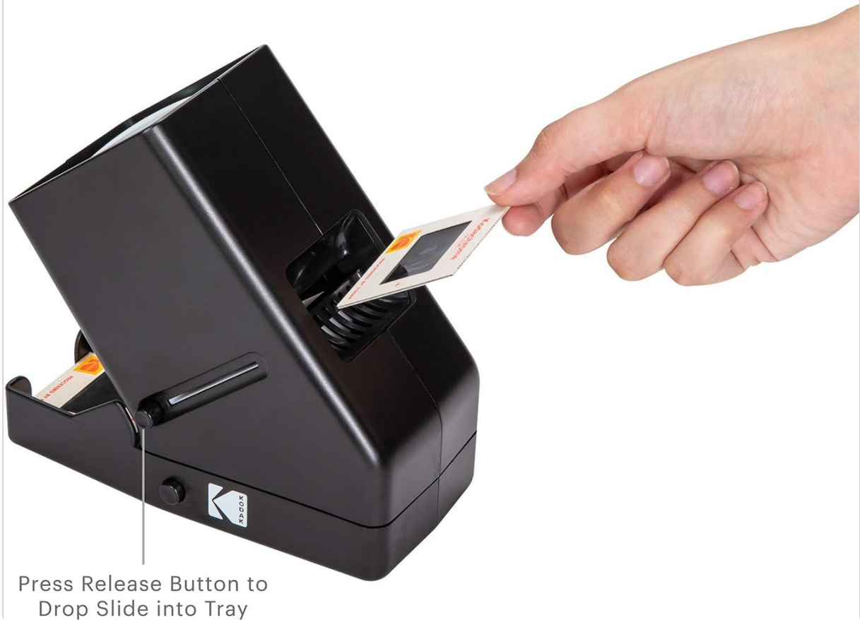
Image: A hand demonstrating the insertion of a 35mm slide into the designated slot at the top of the KODAK 35mm Slide and Film Viewer.