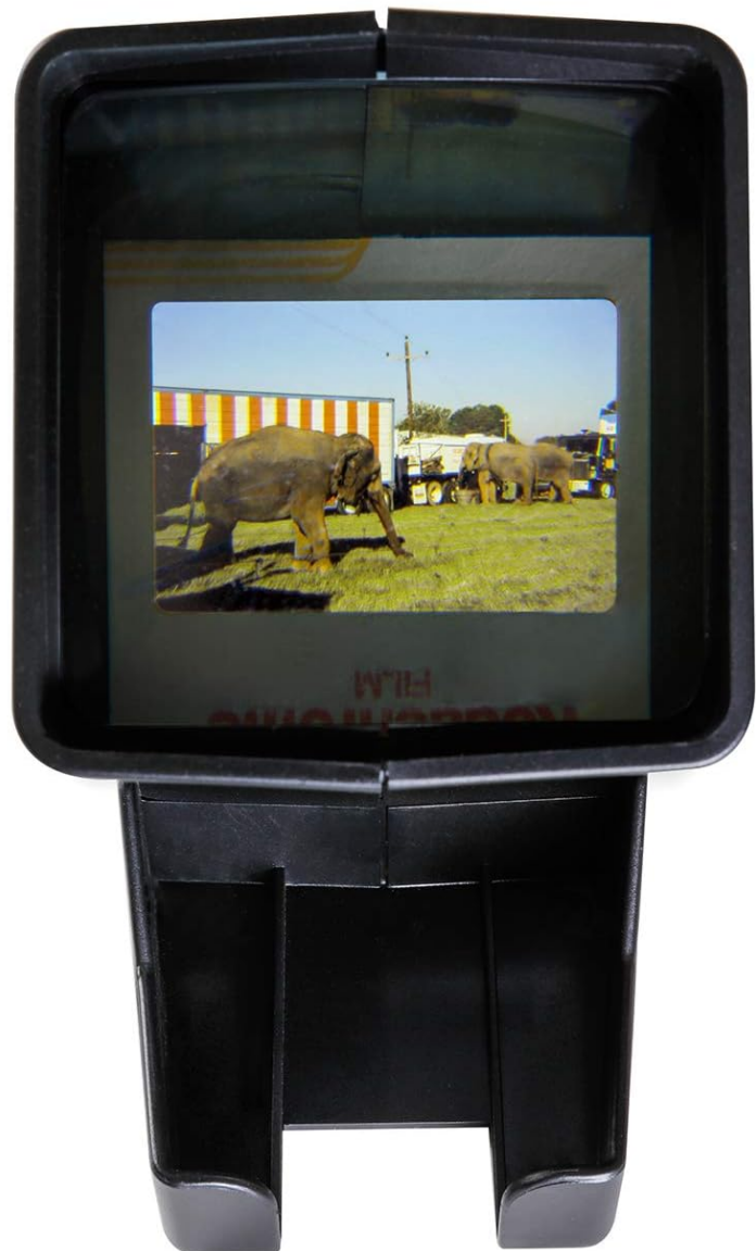
Image: The KODAK 35mm Slide and Film Viewer showcasing a magnified 35mm slide, illustrating its 3X magnification capability for easy viewing.