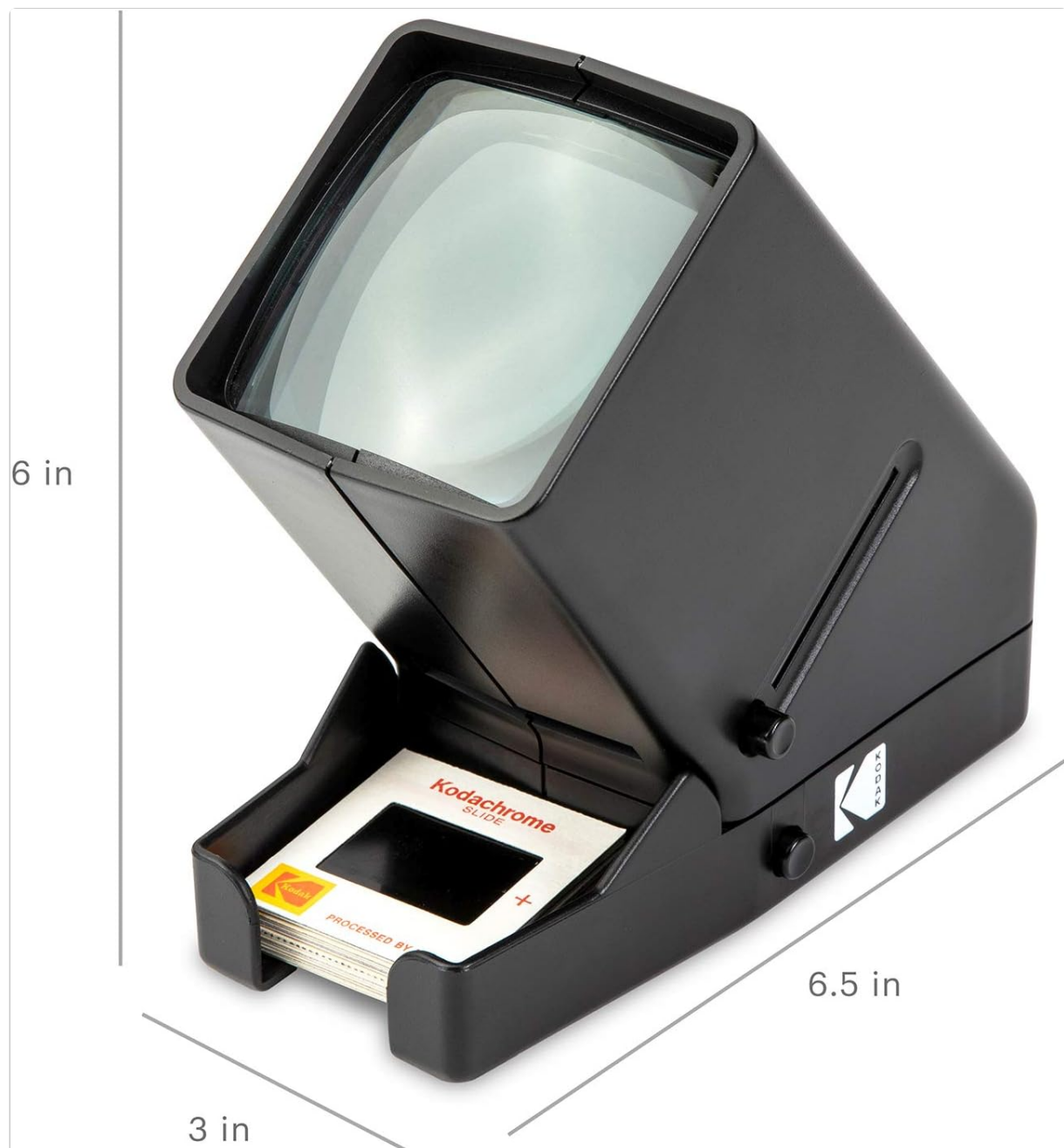
Image: The KODAK 35mm Slide and Film Viewer with its physical dimensions clearly marked for reference.