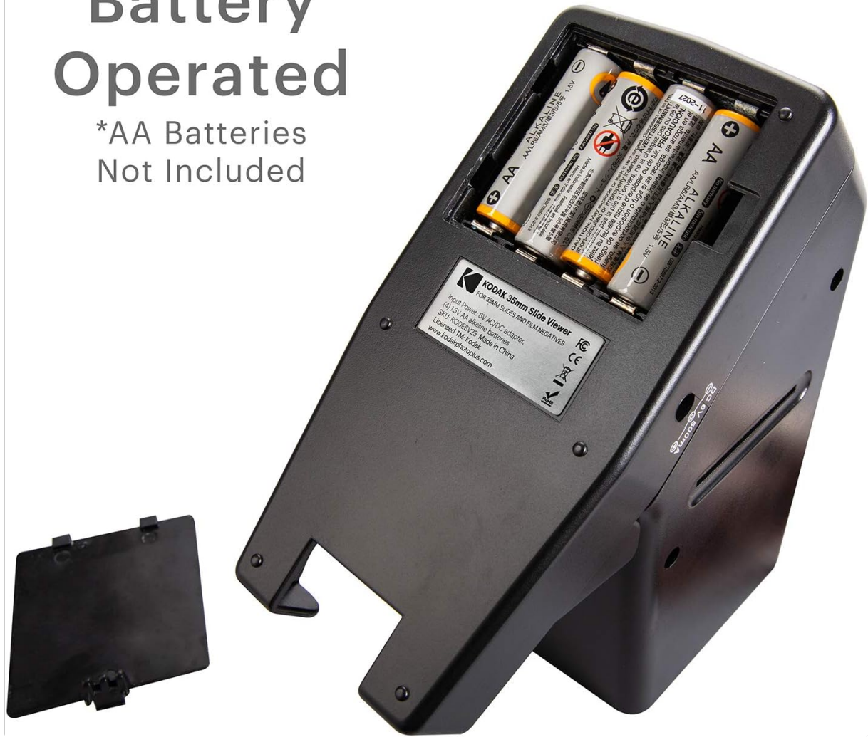
Image: The KODAK 35mm Slide and Film Viewer with its battery compartment open, showing the placement of four AA batteries for power.