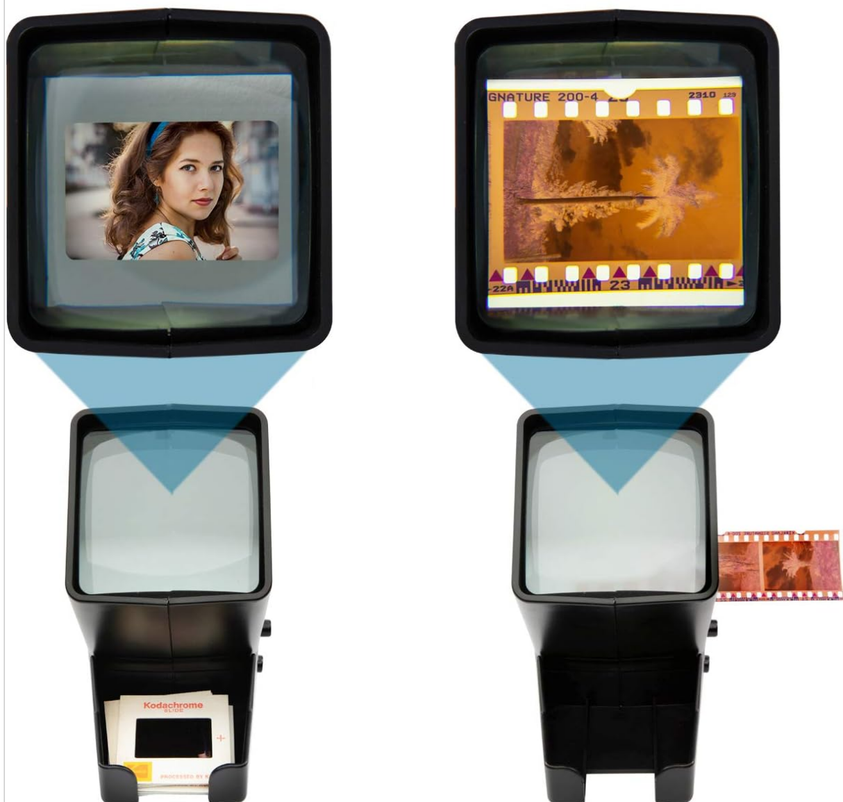
Image: The KODAK 35mm Slide and Film Viewer displaying magnified images of both a 35mm slide and a film negative on its illuminated screen.

Backlit Screen Allows You to View Slides and Negatives