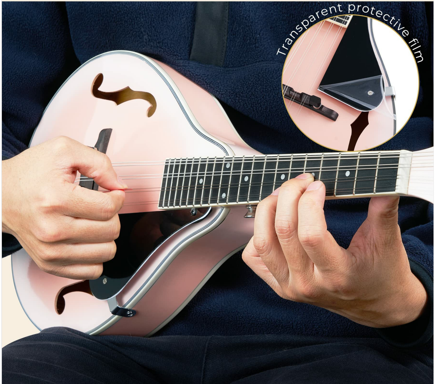
Image: A player's hand positioned over the mandolin's pickguard, illustrating how it protects the instrument from picking scratches.

Unleash your passion for music without worries about picking scratches.