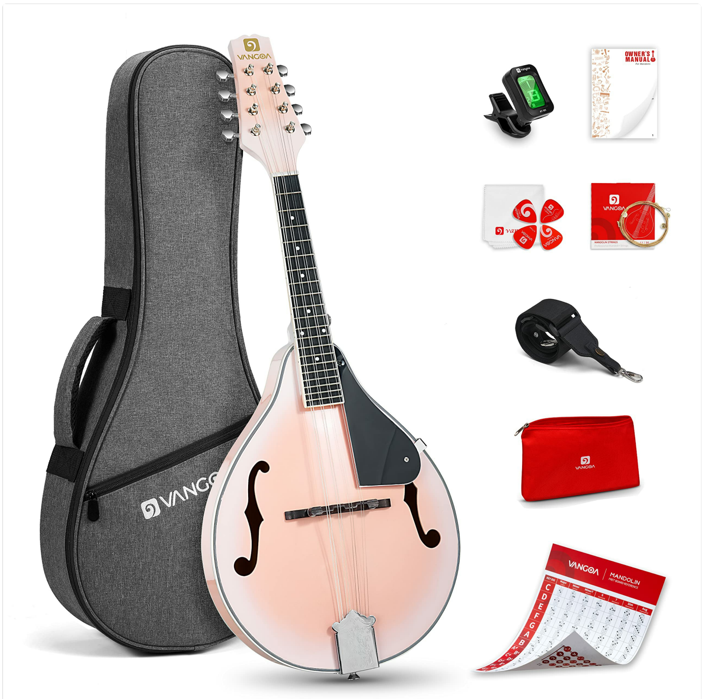
Image: The Vangoa A-Style Mandolin in Sunset Pink Mahogany, accompanied by its carrying bag, digital tuner, picks, extra strings, cleaning cloth, and strap.