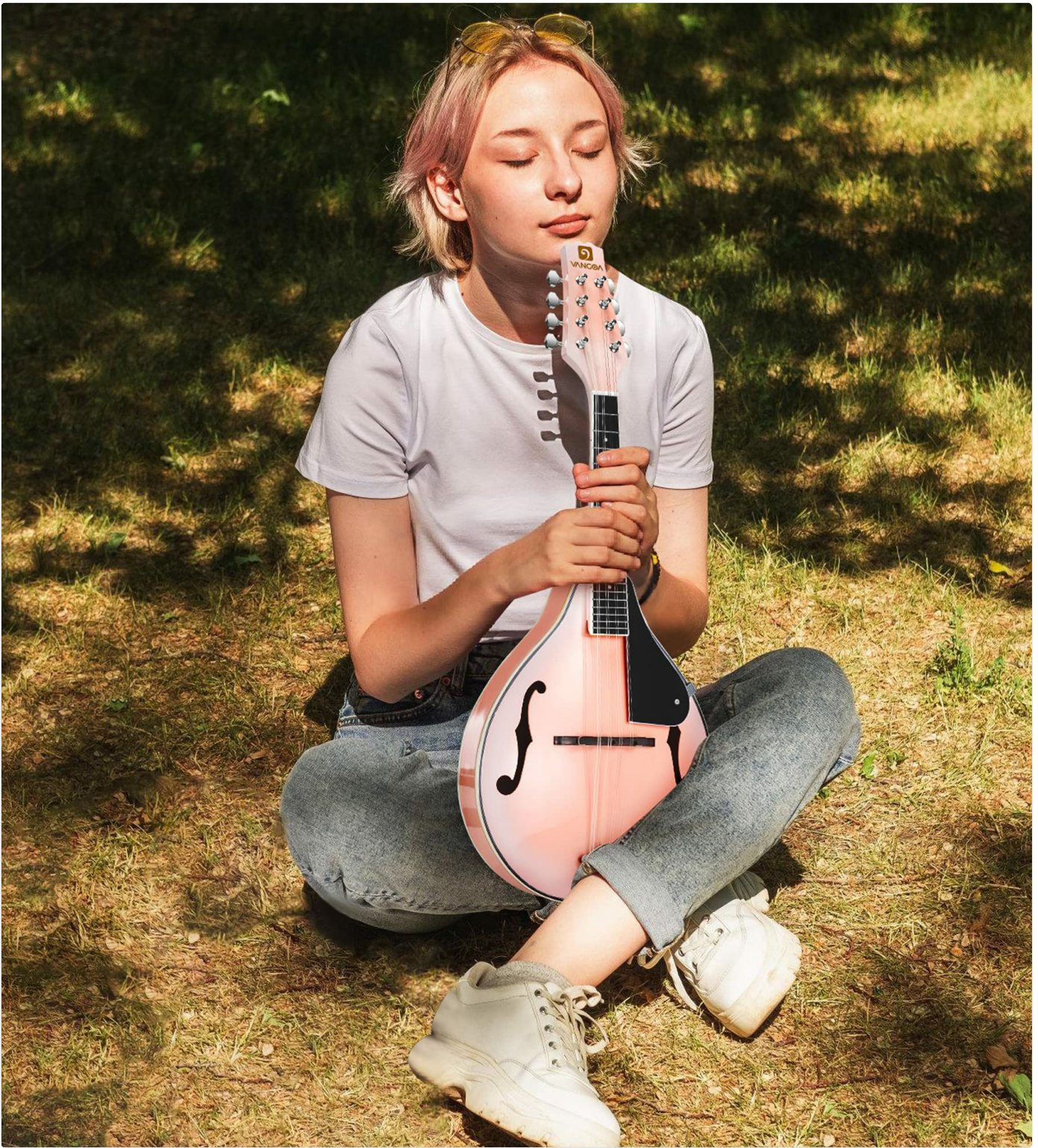
Image: A person comfortably holding the Vangoa mandolin while seated outdoors, demonstrating its portability and ease of use.