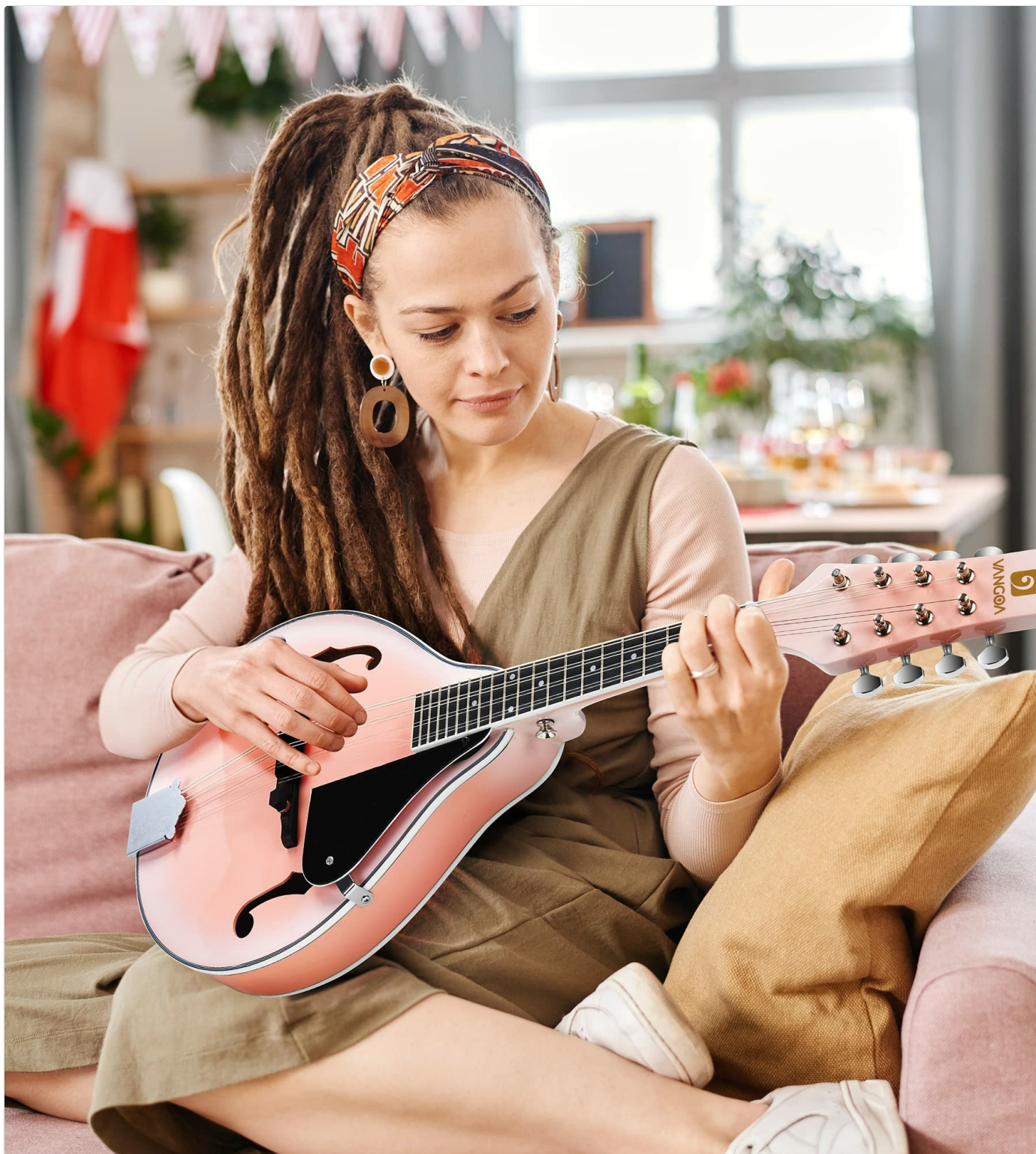
Image: A person playing the Vangoa mandolin indoors, highlighting its comfortable design for relaxed playing sessions.