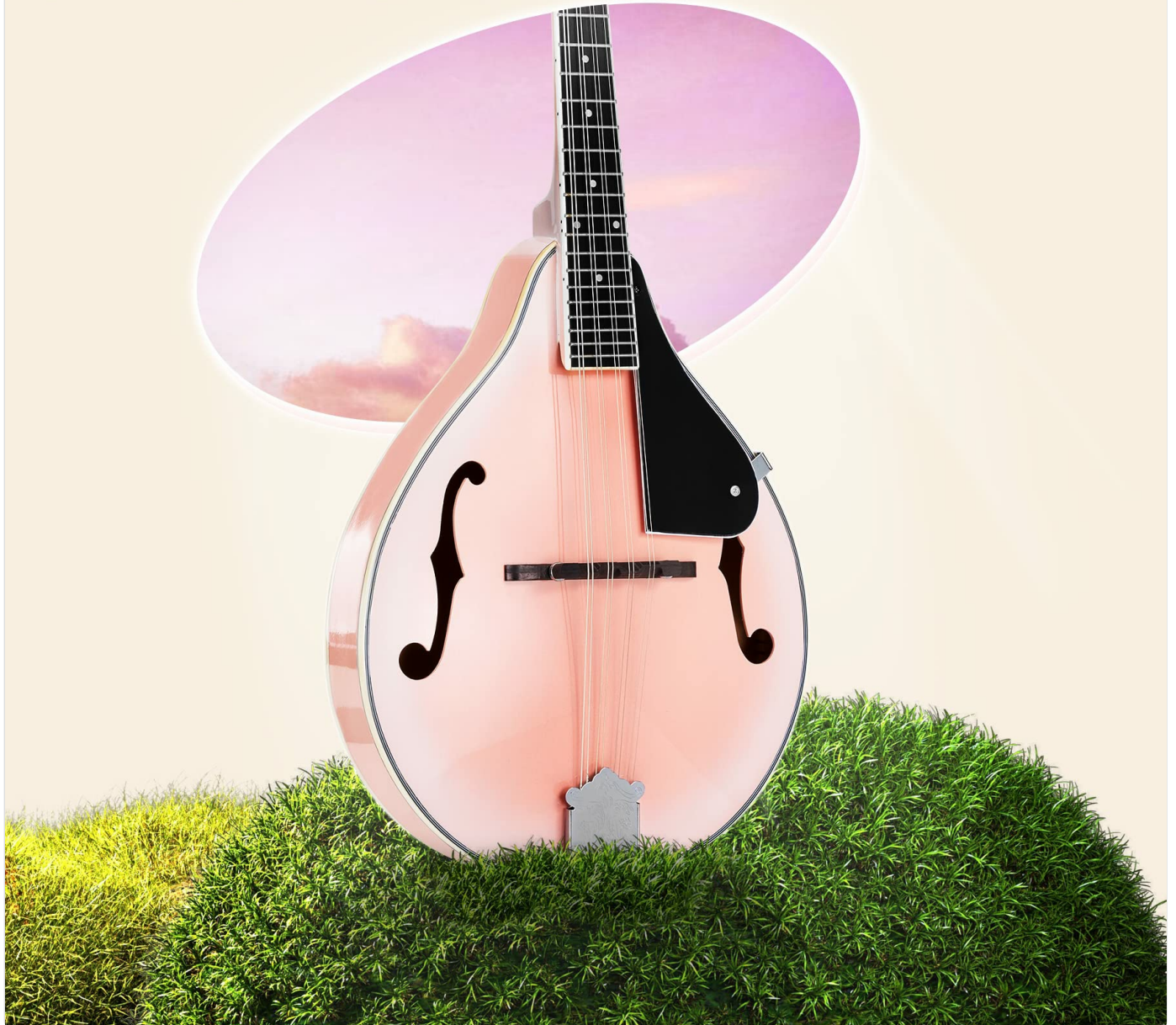
Image: A close-up view highlighting the special glossy pink finish of the mandolin, reminiscent of a sunset sky.

Like the pink sky at sunset, this mystical beauty just makes you feel good.