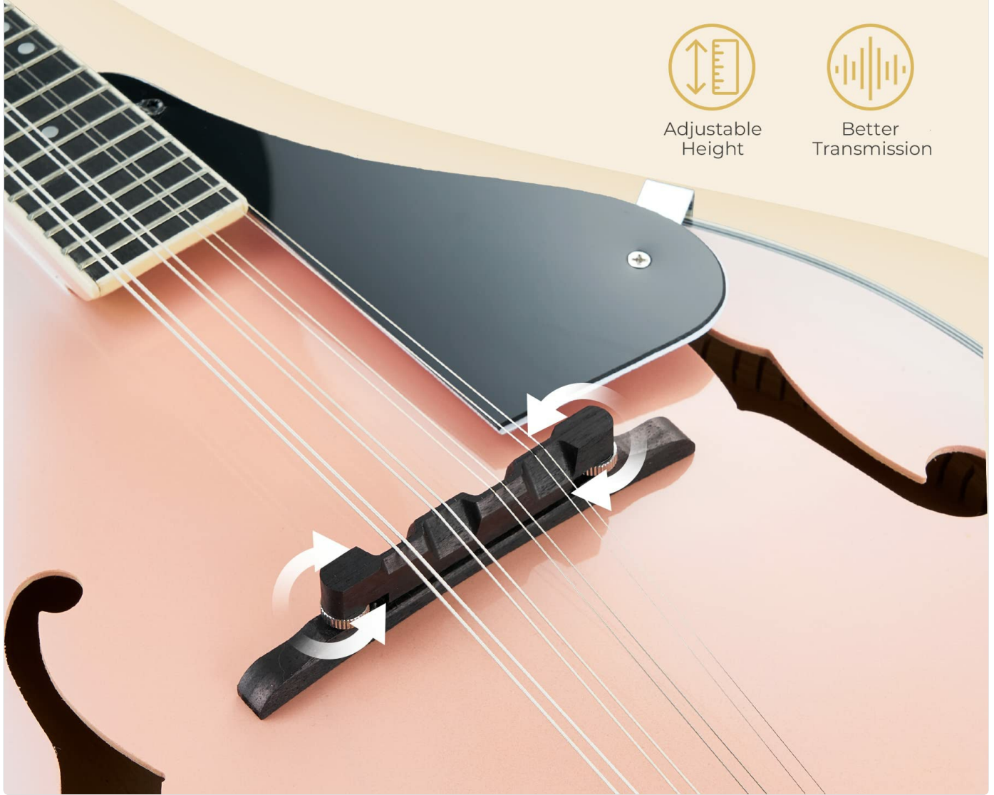
Image: A close-up of the durable walnut bridge, which is free-floating and contributes to better sound transmission. It is also adjustable for height. Allow a few days for the new strings to settle and hold their tune consistently. Continue to tune regularly before each playing session.