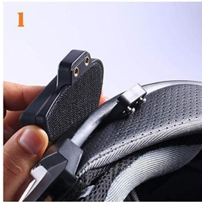
Clip is installed on the side of helmet