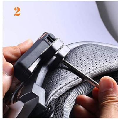
Screw lock clip