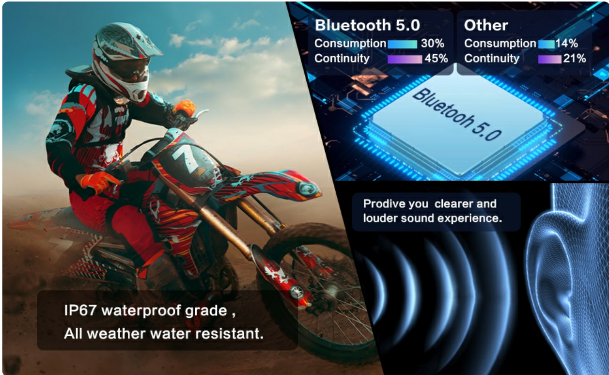
Figure 9: Highlights the IP67 waterproof grade, indicating the headset's ability to withstand all-weather conditions.