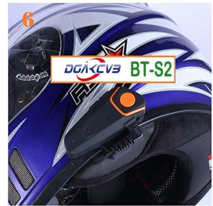
Socket insert the host.