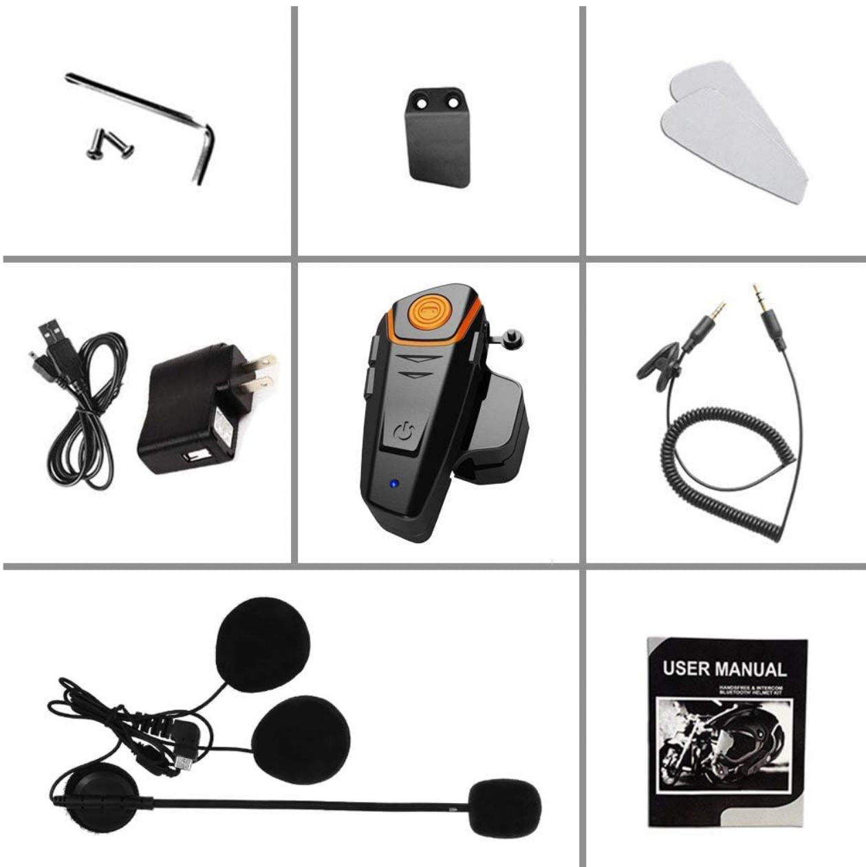
Figure 3: All items included in the BT-S2 package, showing the main unit, microphone, speakers, charging cable, power adapter, mounting hardware, and user manual.