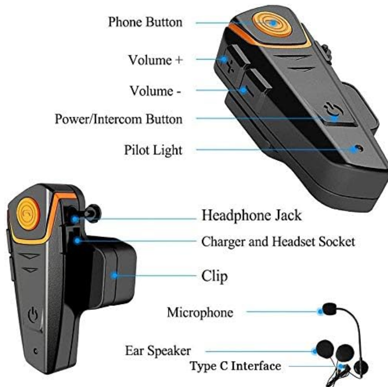
Figure 6: Labeled diagram of the BT-S2 headset showing the Phone Button, Volume +/-, Power/Intercom Button, Pilot Light, Headphone Jack, Charger and Headset Socket, Clip, Microphone, Ear Speaker, and Type C Interface.