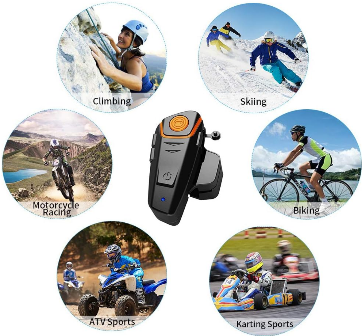
Figure 2: The BT-S2 headset is suitable for various activities such as climbing, skiing, motorcycle racing, biking, ATV sports, and karting sports, highlighting its versatility.