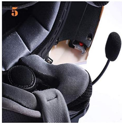
Magic sticker fixed left and right earphones