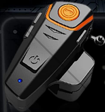
Figure 1: Overview of BT-S2 Bluetooth 5.0 features including 1000m intercom, Hi-Fi stereo, 3-way intercom, mobile phone connectivity, DSP noise reduction, waterproof design, FM radio, GPS, and music playback.