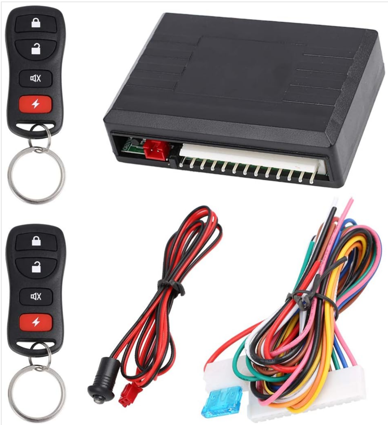
Figure 2.1: Complete X AUTOHAUX Keyless Entry System kit.

Video 2.1: Unboxing and overview of the kit contents.