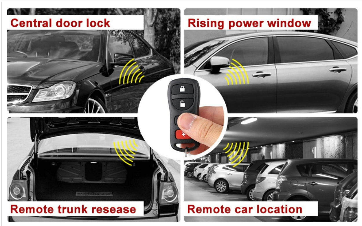
Figure 6.1: Keyless Entry System Features.

Video 6.2: Demonstration of remote control functions for a keyless entry system.