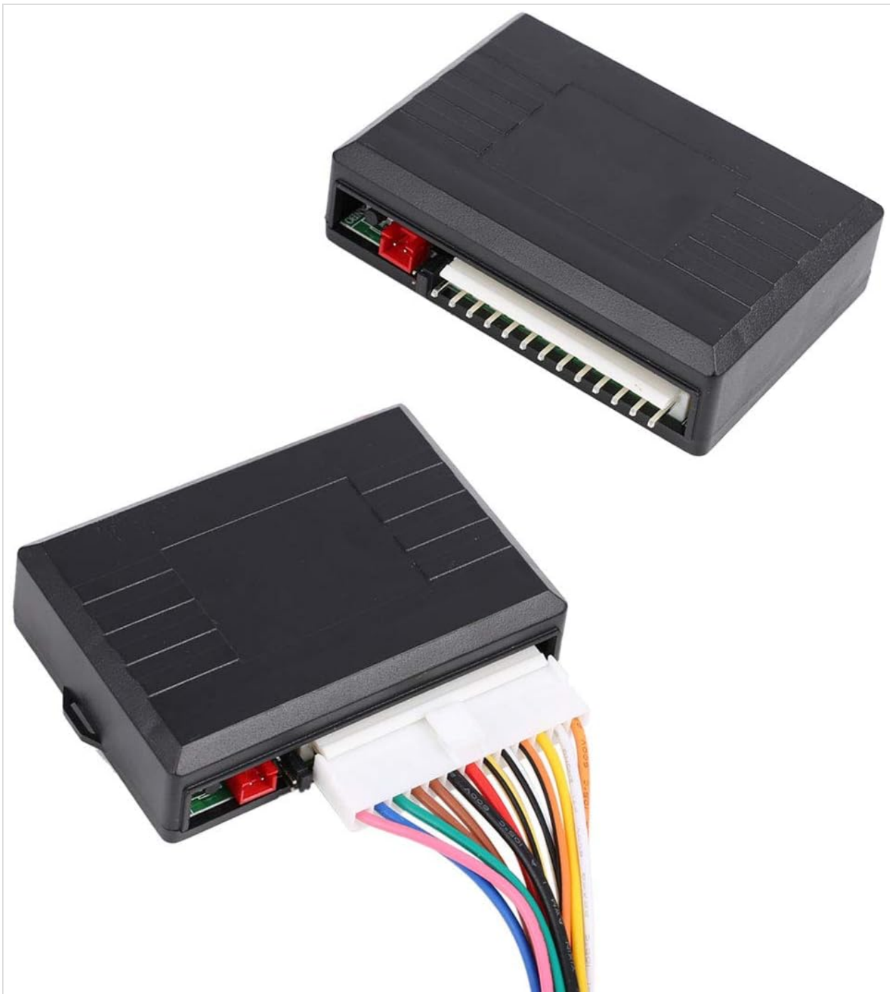
Figure 3.1: Main Control Unit and Wiring Harness.