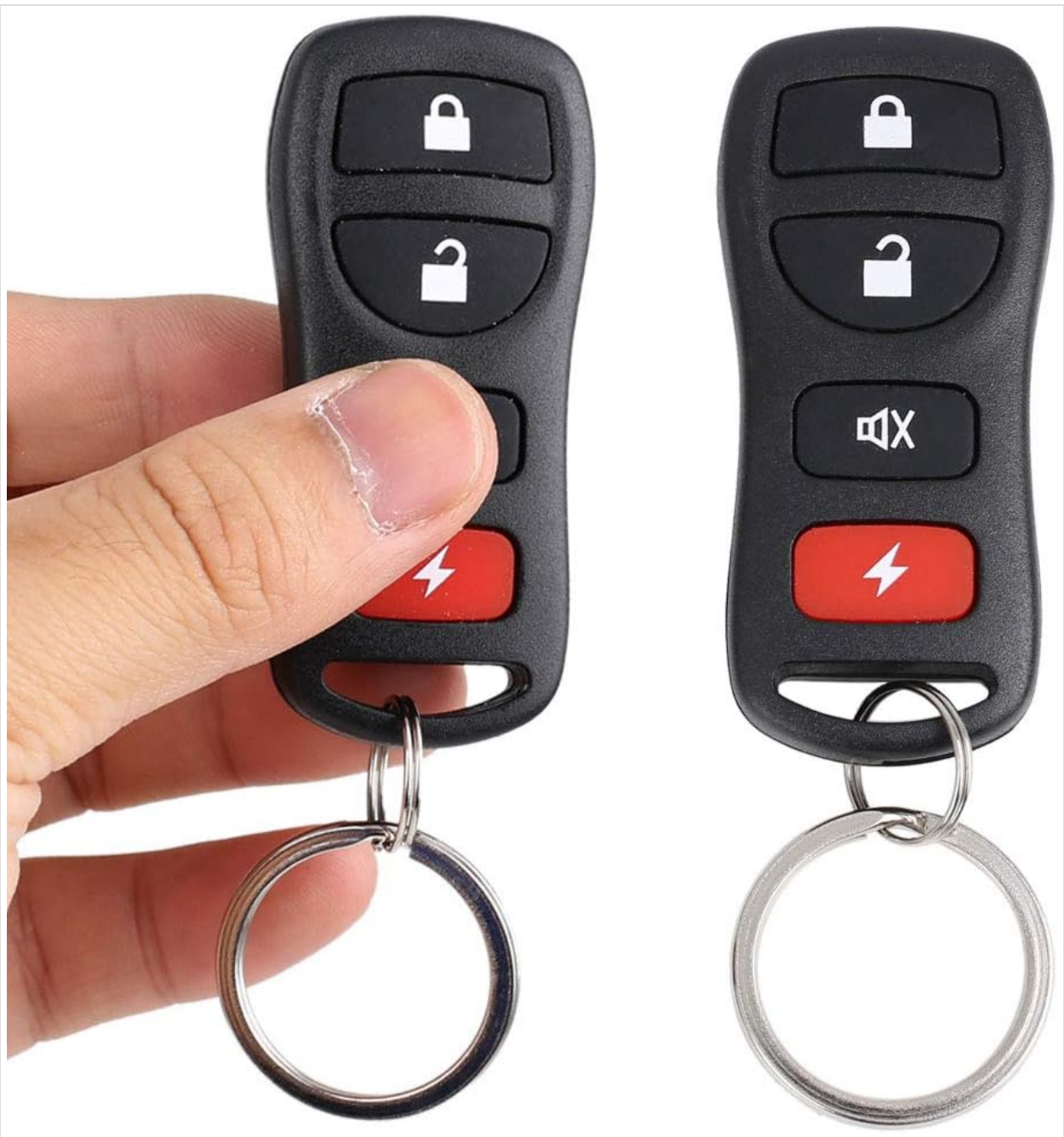
Figure 3.2: Remote Key Fobs.