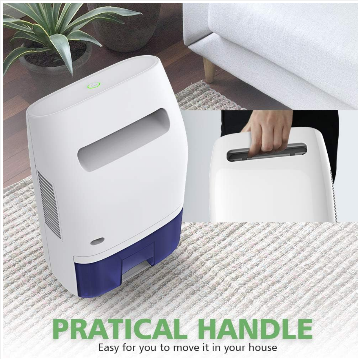
Figure 2.3: The dehumidifier features a practical handle for easy portability.