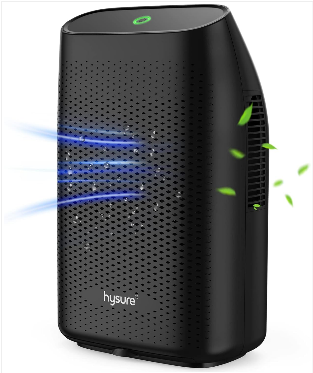
Figure 2.1: Hysure T8 Plus Dehumidifier, front view.