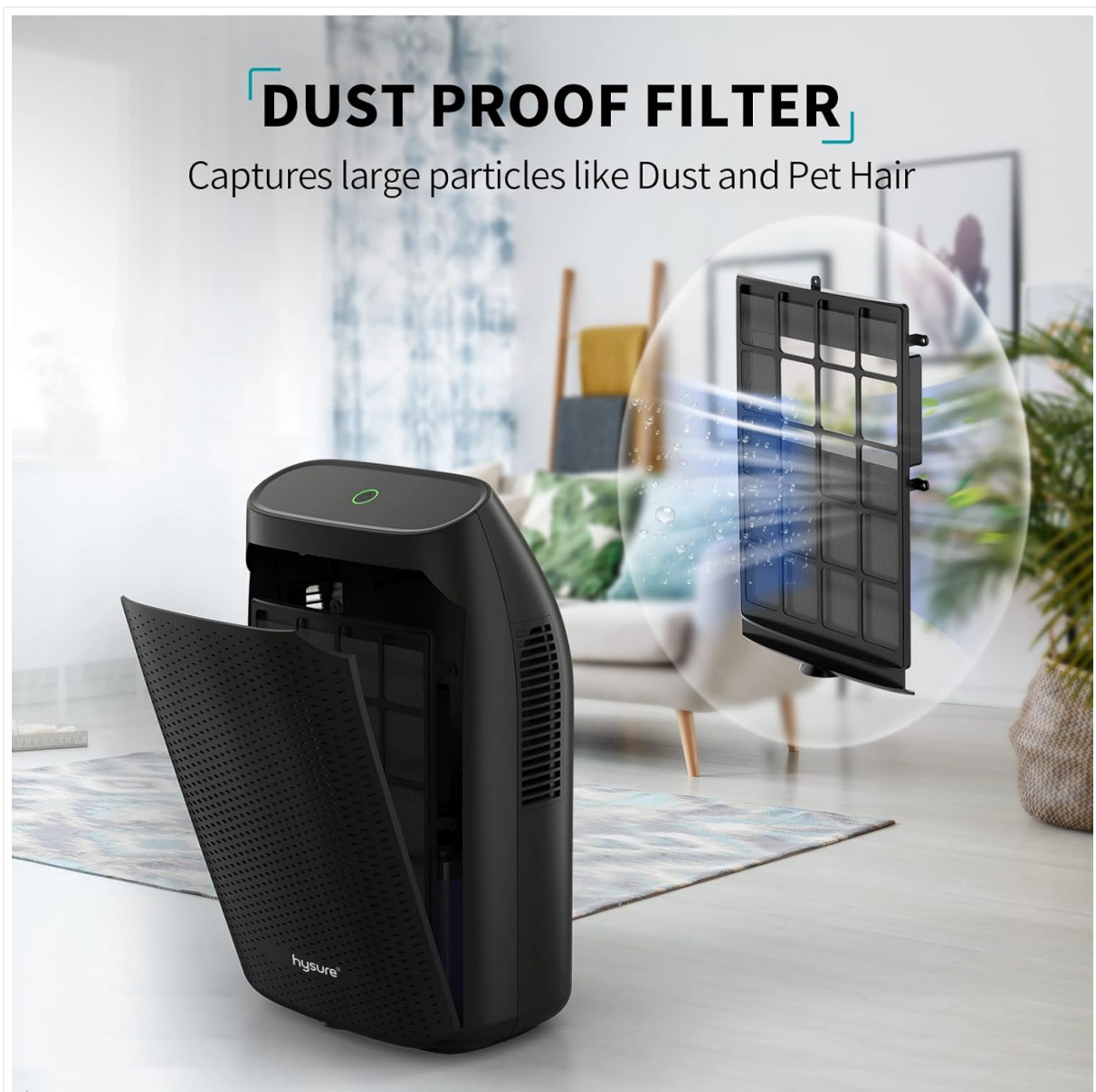
Figure 5.1: The removable dust-proof filter helps maintain air quality and unit efficiency.