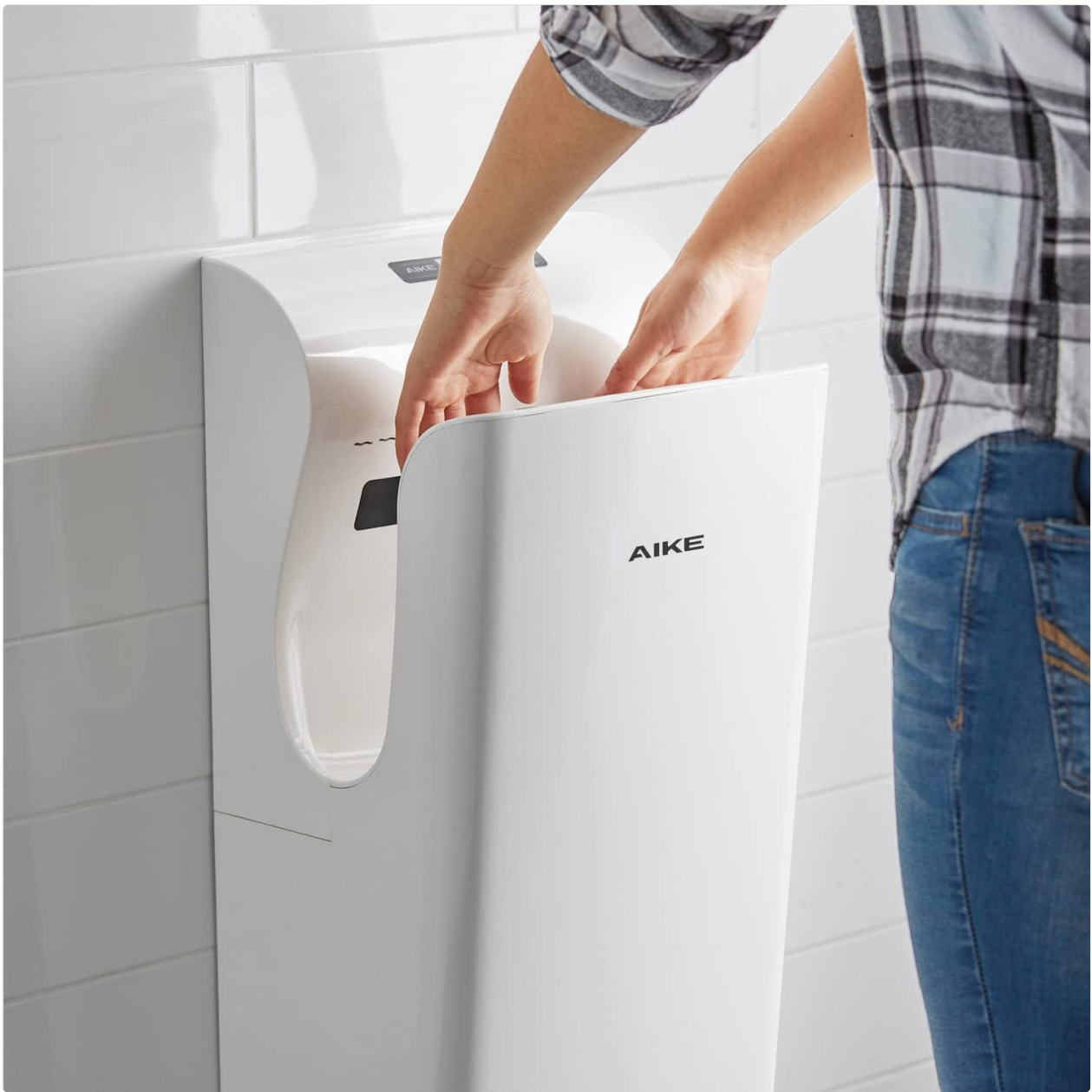
Figure 3: Proper hand placement for drying.