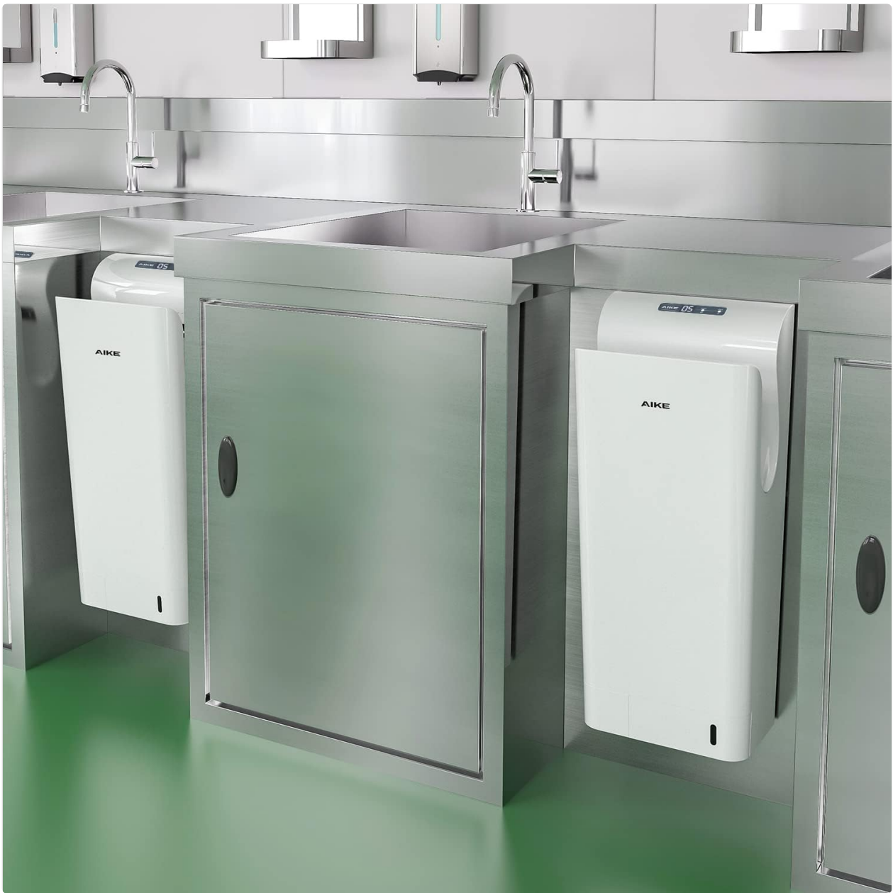
Figure 1: AIKE AK2030 hand dryers in a commercial setting.