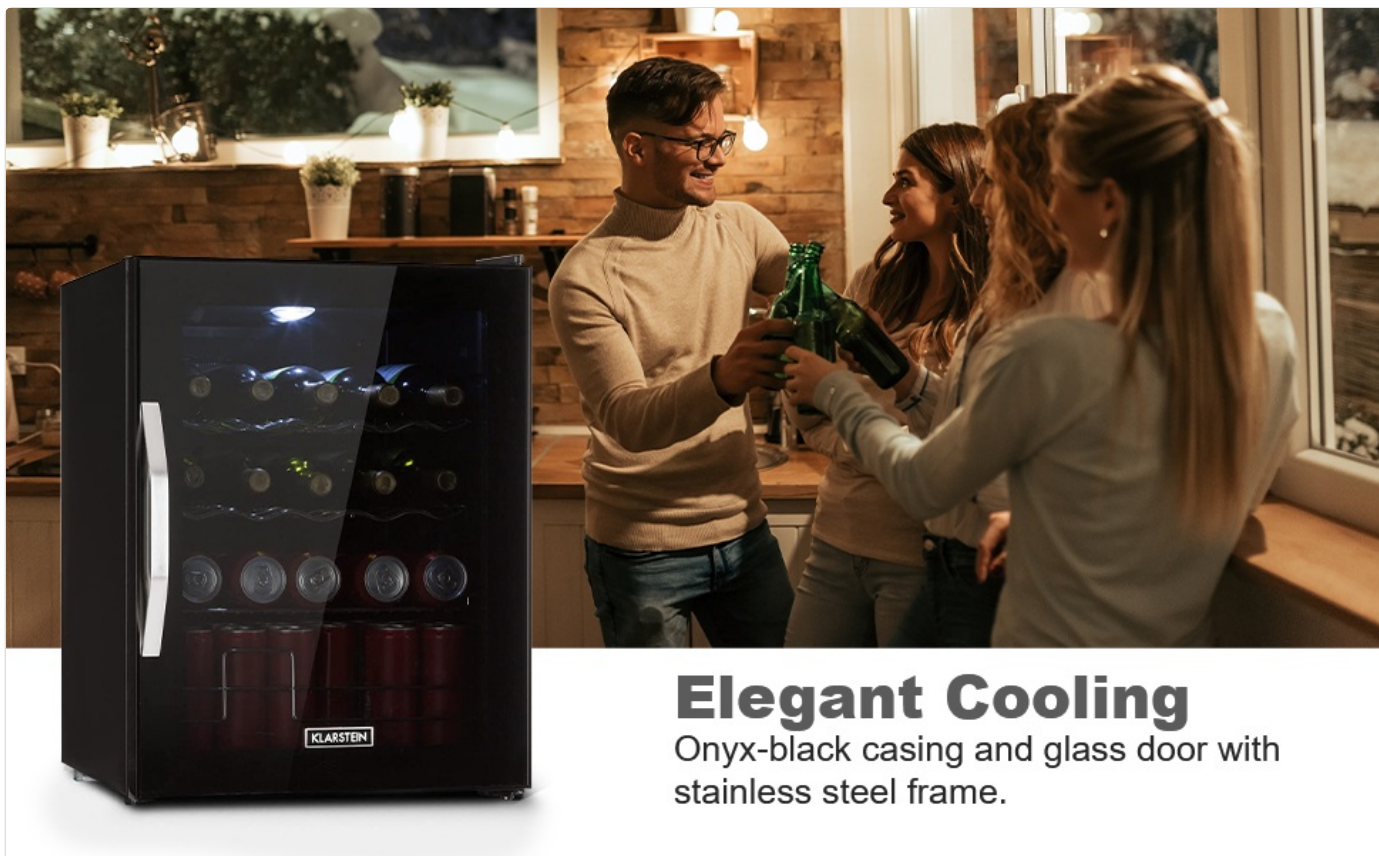
Image 1.2: The Beersafe Minibar integrated into a kitchen environment, highlighting its elegant cooling capabilities and aesthetic appeal.