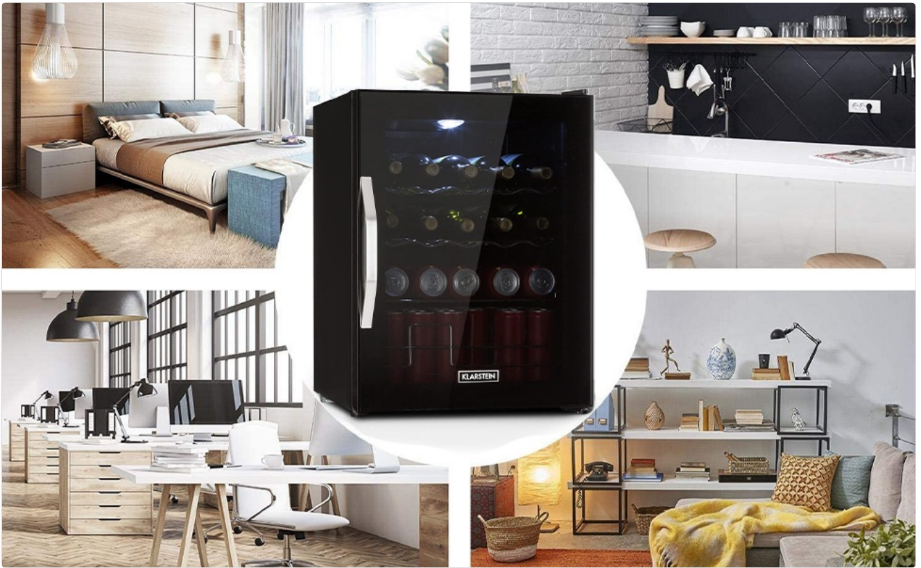
Image 4.1: Examples of suitable placement locations for the Beersafe Minibar in different home and office environments.