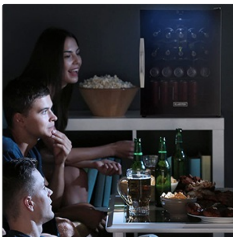
Image 1.3: The Beersafe Minibar in a social setting, demonstrating its quiet operation and convenience for entertaining.