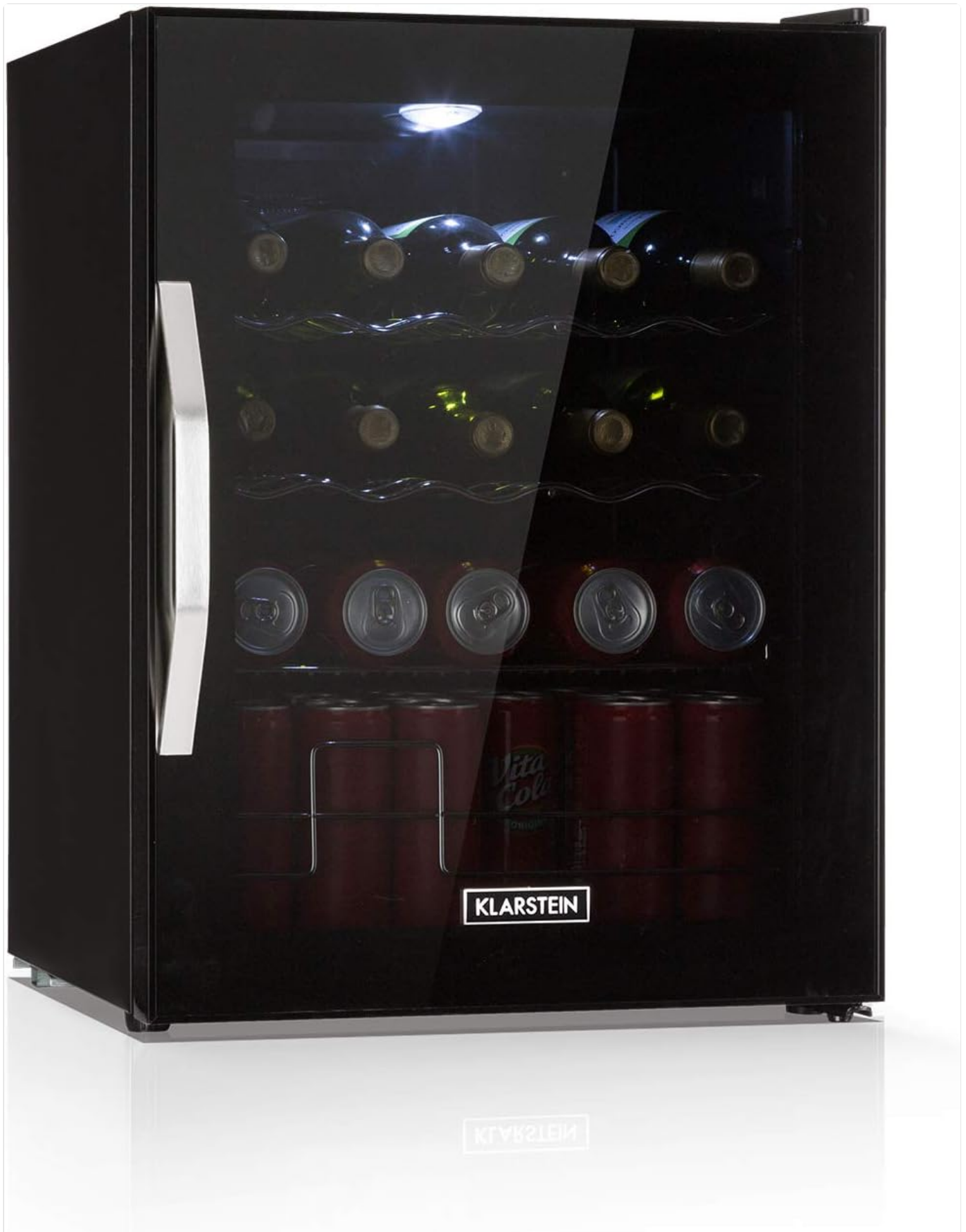
Image 1.1: Front view of the KLARSTEIN Beersafe Minibar, showcasing its sleek design, glass door, and interior lighting with beverages stored inside.

This minibar boasts a durable housing with a stainless steel door frame and handle, complemented by a double-insulated panoramic glass door. The 5-step adjustable thermostat allows for precise temperature control, ensuring your beverages are cooled to your preference. Its compact form factor allows for easy placement in various rooms, and its energy-saving design consumes only 60 kWh per year.