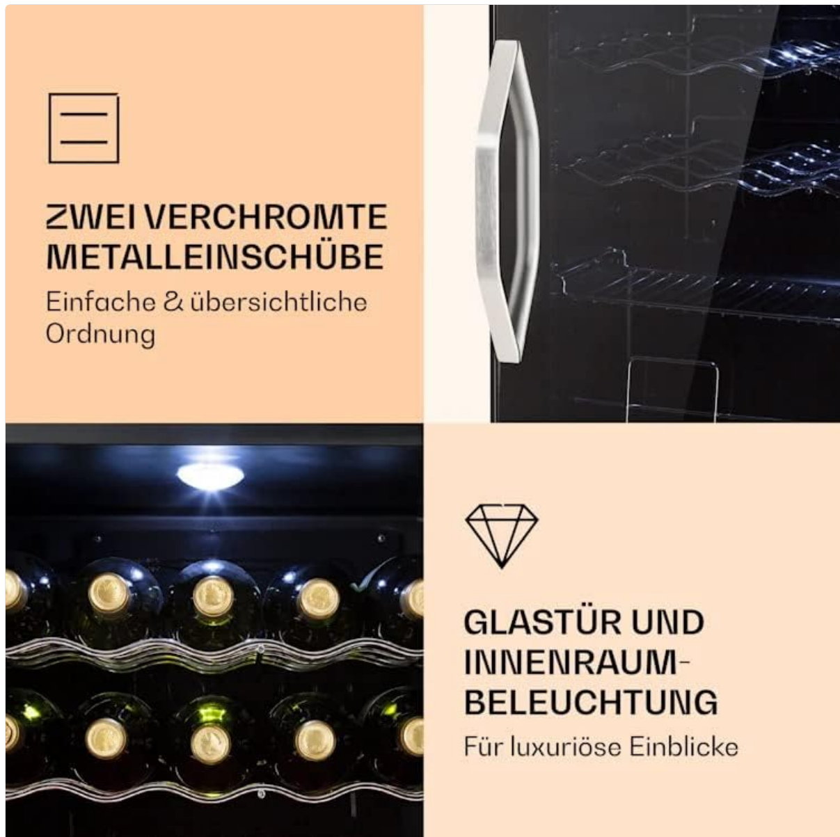
Image 5.3: The removable chrome shelves, providing flexible storage options within the minibar.

The three chrome metal inserts are removable, allowing you to adjust the internal configuration to accommodate different sizes of bottles and cans. Carefully slide shelves out and reposition them as needed.